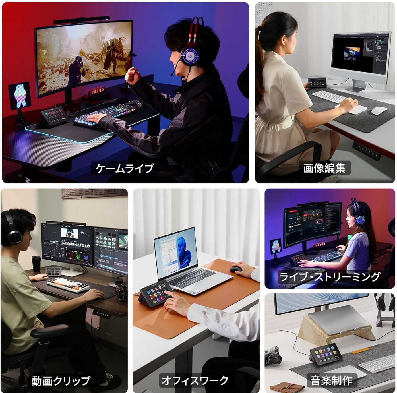
Figure 6: The D200 Stream Controller enhancing productivity across different tasks like gaming, content creation, and office work.