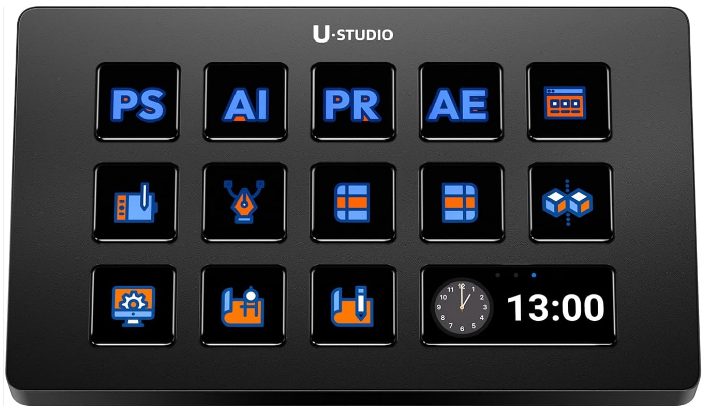
Figure 1: Ulanzi D200 Stream Controller with its 14 LCD keys.