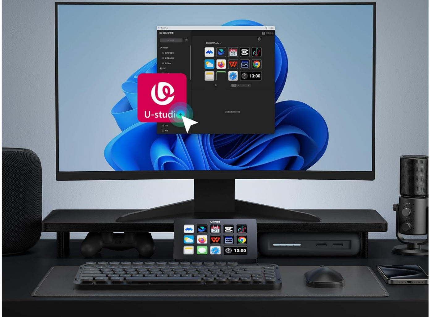
Figure 2: Connecting the D200 to your computer for immediate use.

プラグインするだけで設定完了! ドラッグ&ドロップで簡単に様々なソフトやツールをカスタマイズでき、ワークフローを自由に設計します。