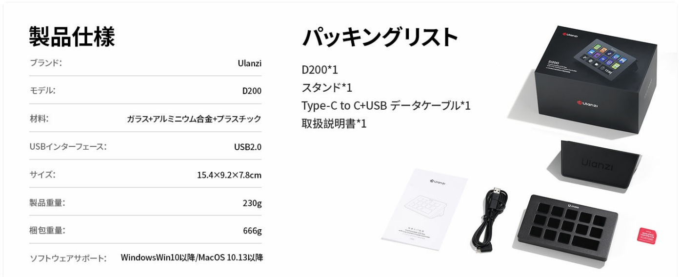
Figure 7: Detailed product specifications and included items.