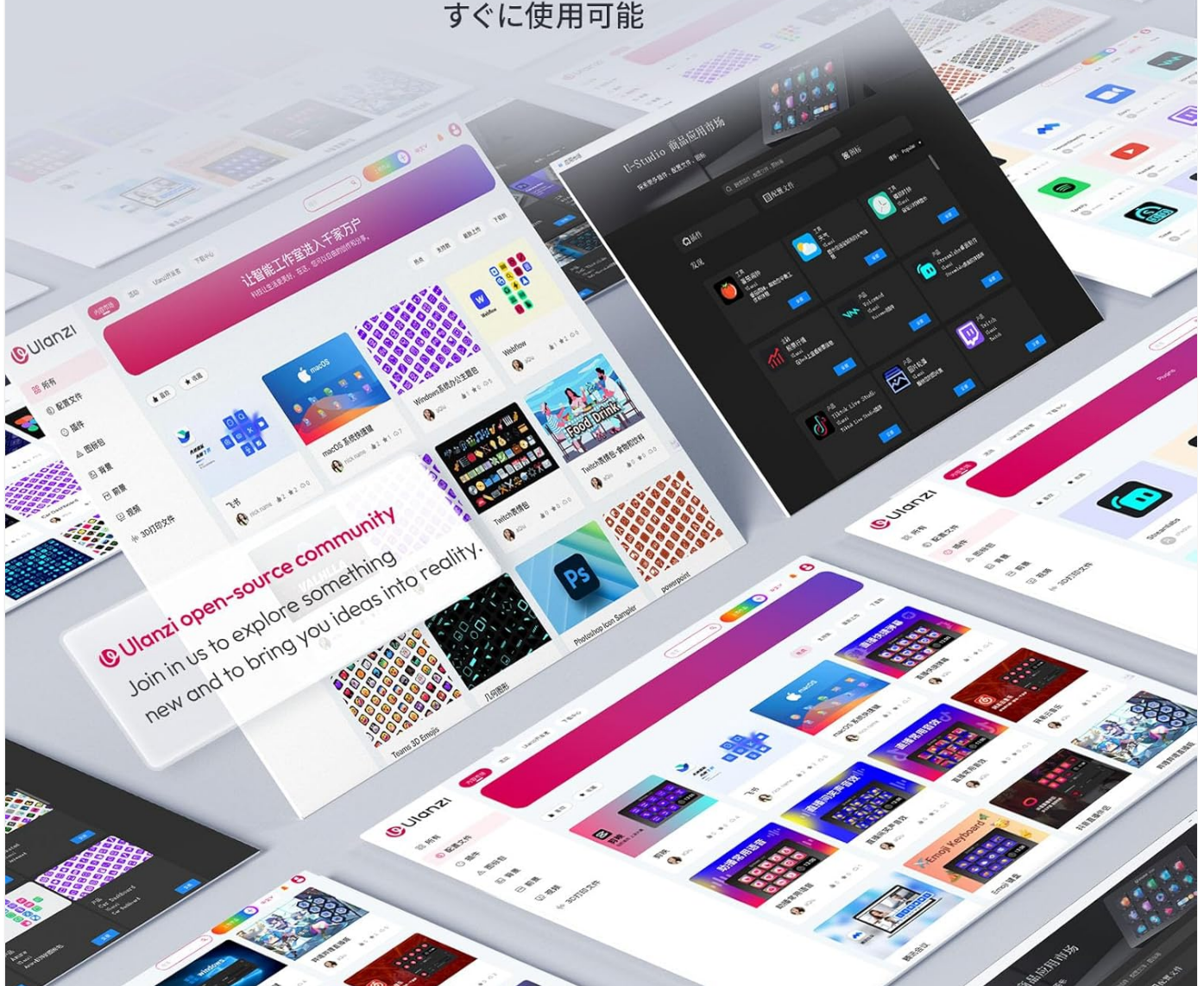
Figure 3: The U-Studio interface for managing plugins and customizations.

U-Studio App Storeでダウンロードできる。豊富なプラグイン、プロファイル、アイコン、すぐに使用可能