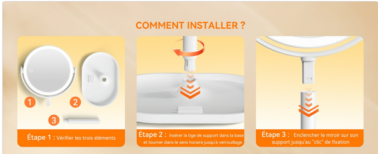
Image: Step-by-step guide for mirror assembly.