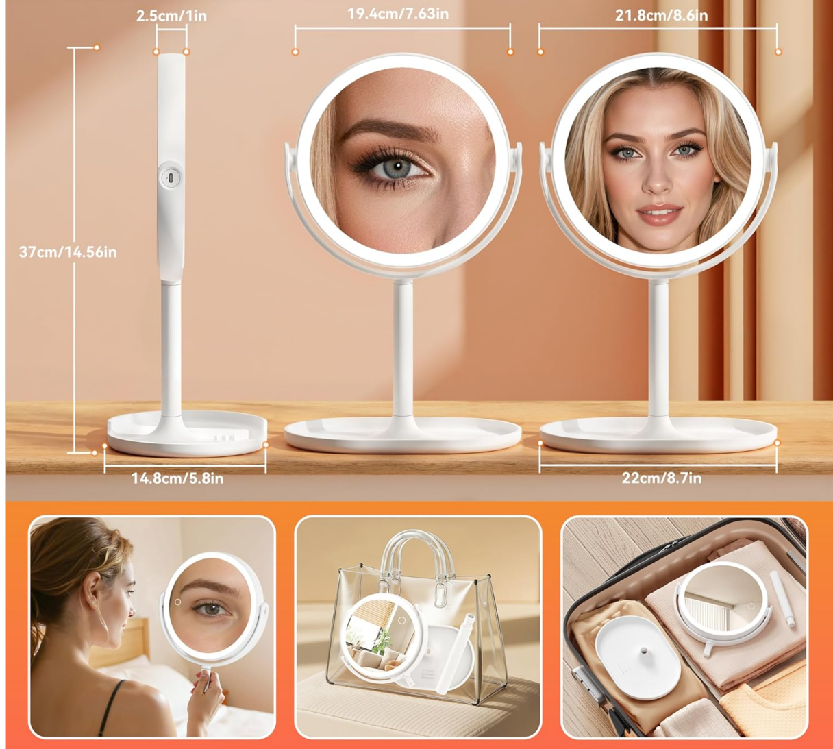
Image: The multi-functional base serving as a phone holder and storage tray.