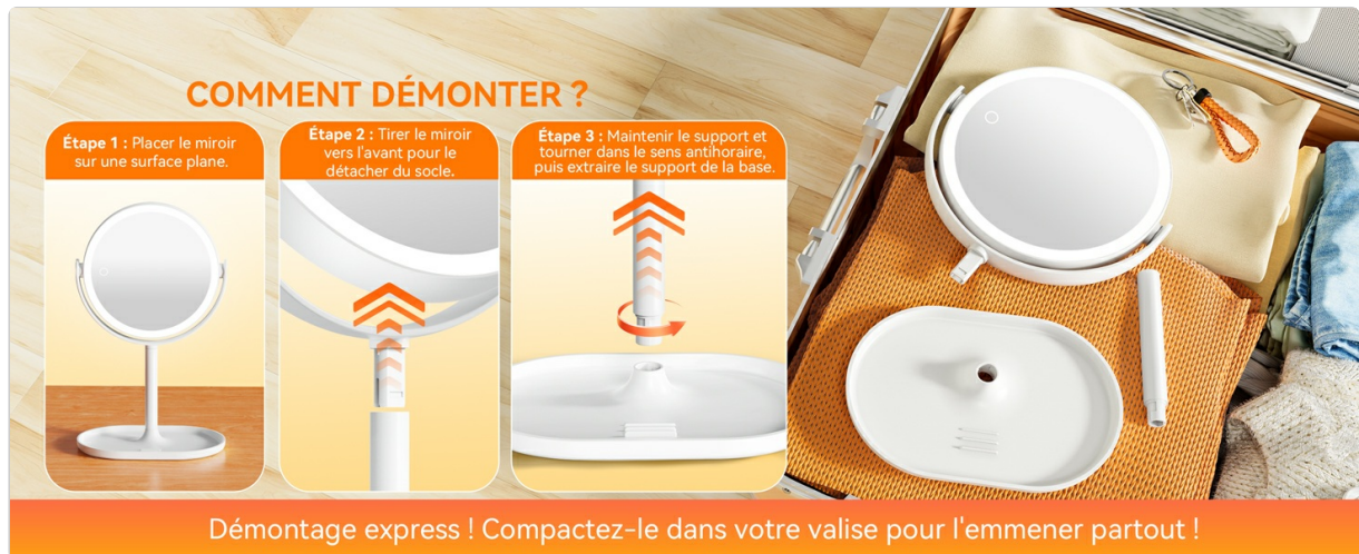
Image: Instructions for disassembling the mirror for compact storage and travel.