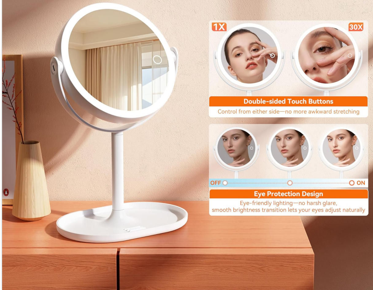
Image: Demonstrating the 1X and 30X magnification sides and the recommended usage distance for the 30X side.