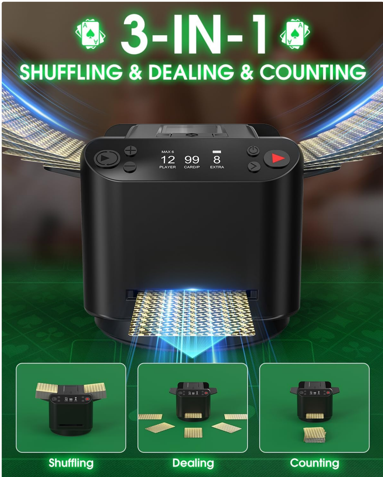
Image: A visual representation of the device's three core functions: shuffling cards in the top trays, dealing cards from the front slot, and counting cards, all integrated into one unit.