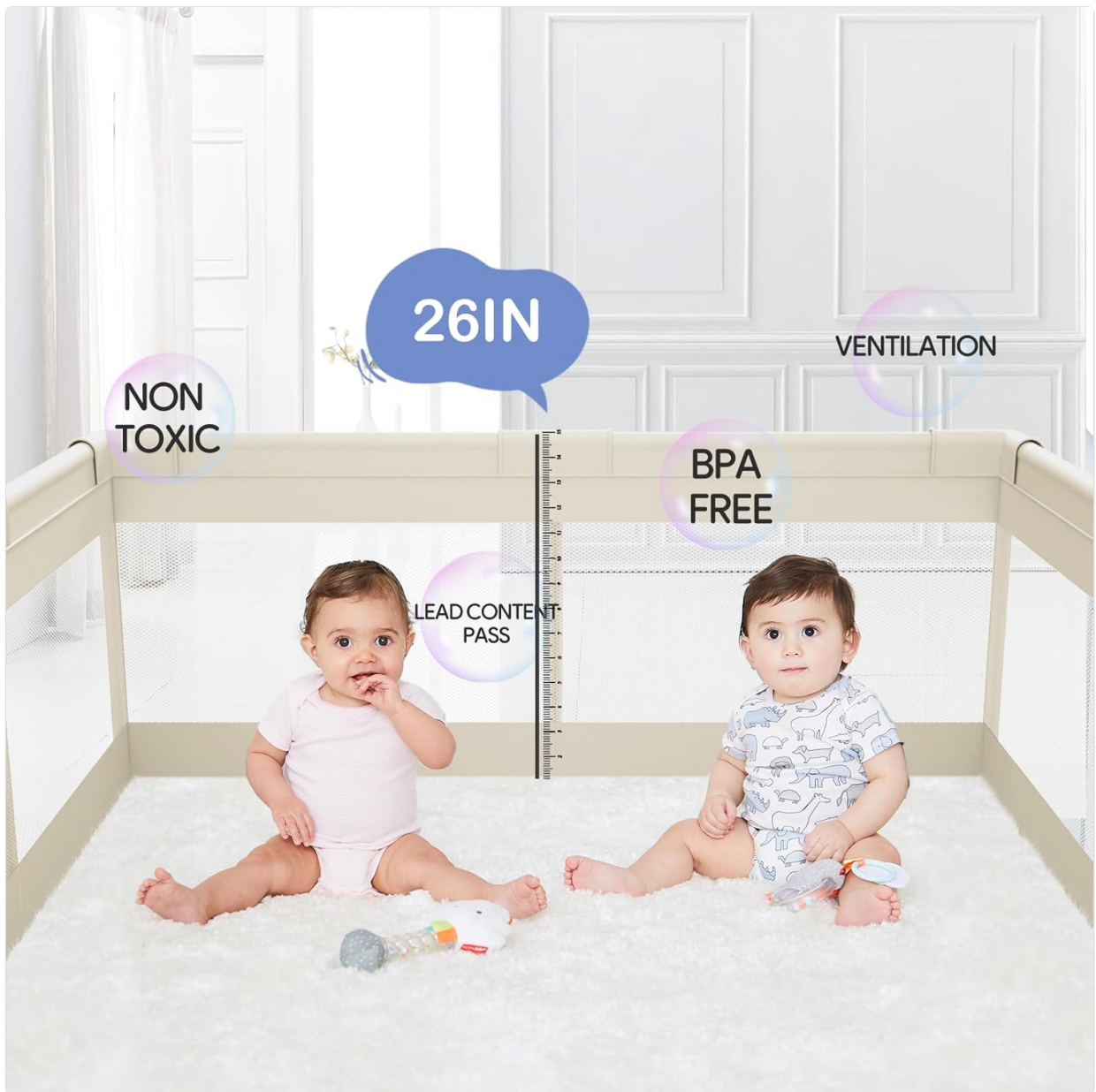
Image: Two babies inside the Fodoss playpen, highlighting its non-toxic, BPA-free, and lead-content-safe materials, along with ventilation and a 26-inch height.