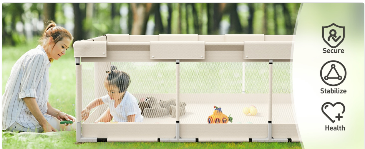
Image: Icons emphasizing the playpen's secure, stable, and health-conscious design, shown with a baby and parent outdoors.