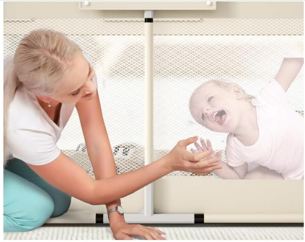
360° mesh, interact with baby at any time