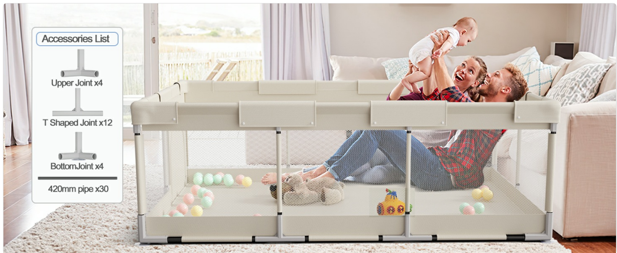
Image: An illustration detailing the various components included for playpen assembly, such as pipes, joints, pulling rings, and the main fabric.