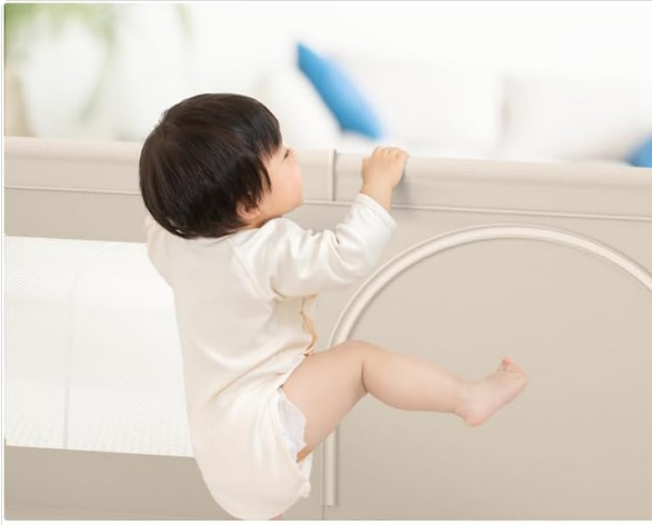
Stable playpen, baby can't climb out