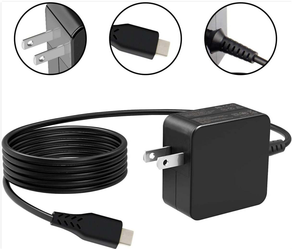
Image 3.2: Views of the Marg 45W AC Power Adapter Charger. The image shows the two-prong AC plug, the USB-C connector, and the adapter's overall design from different angles.