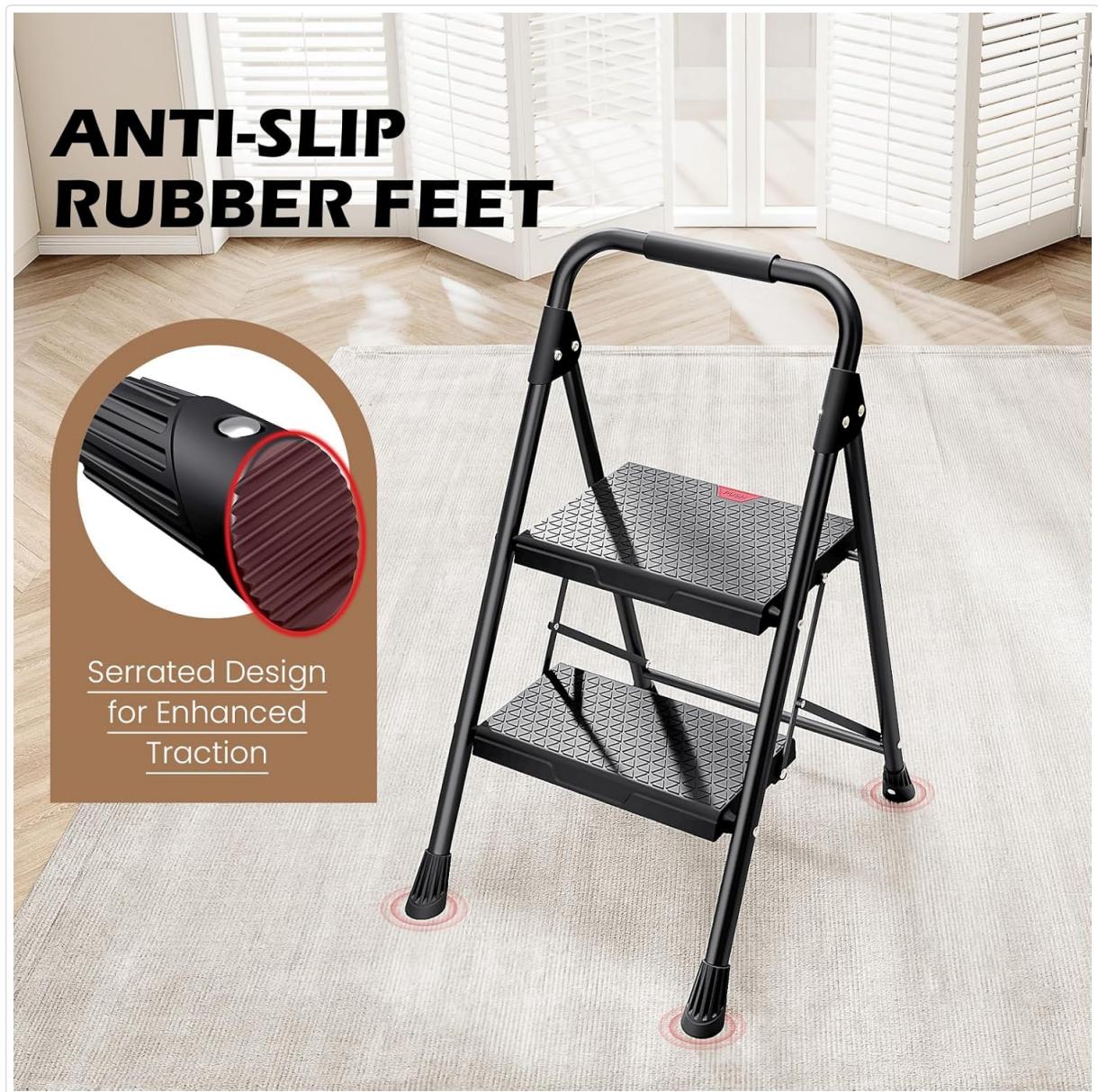
Figure 6.3: A close-up view of the ladder's anti-slip rubber feet, featuring a serrated design for enhanced traction and stability on various surfaces.