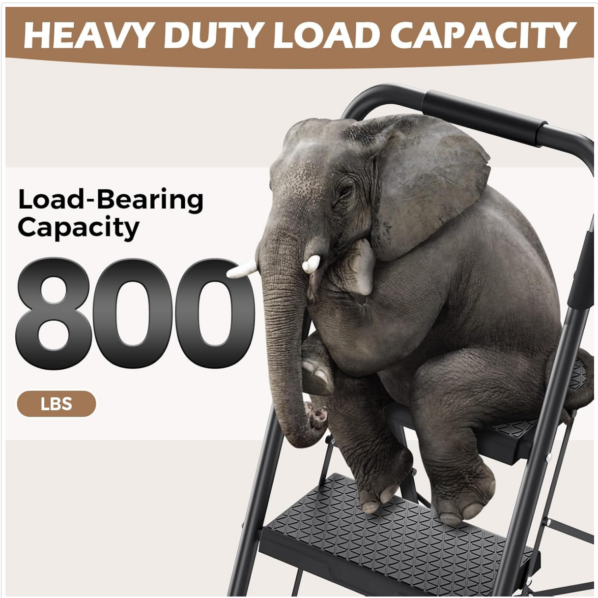
Figure 6.2: Visual representation highlighting the heavy-duty construction and 800 lbs load capacity of the ladder, ensuring robust support.