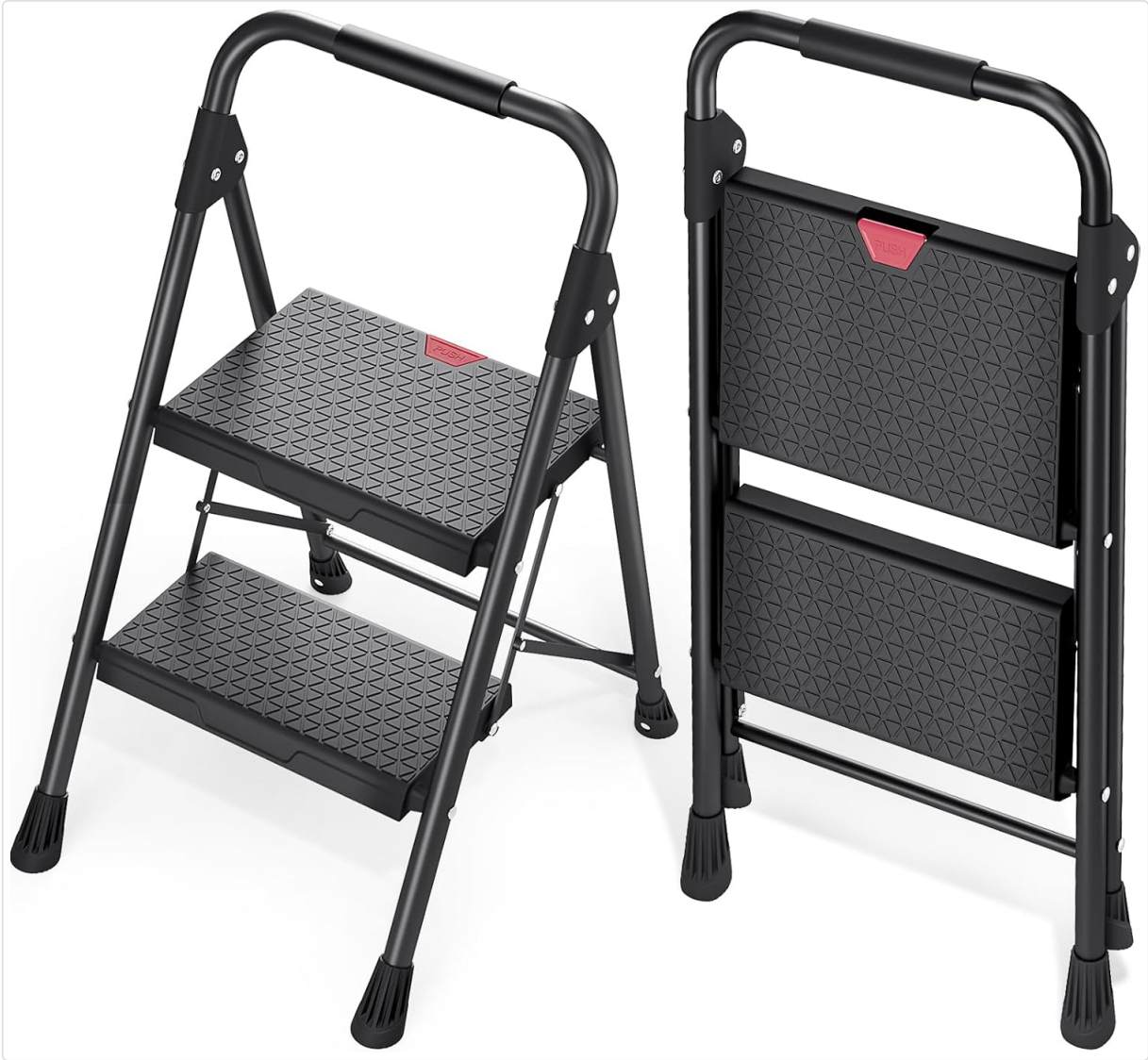
Figure 2.1: The KINGRACK 2-step folding ladder shown in both its open, ready-to-use configuration and its compact, folded state for storage.

3. Placement: Position the ladder on a stable, flat, and dry surface. Verify that all four anti-slip rubber feet are firmly on the ground.