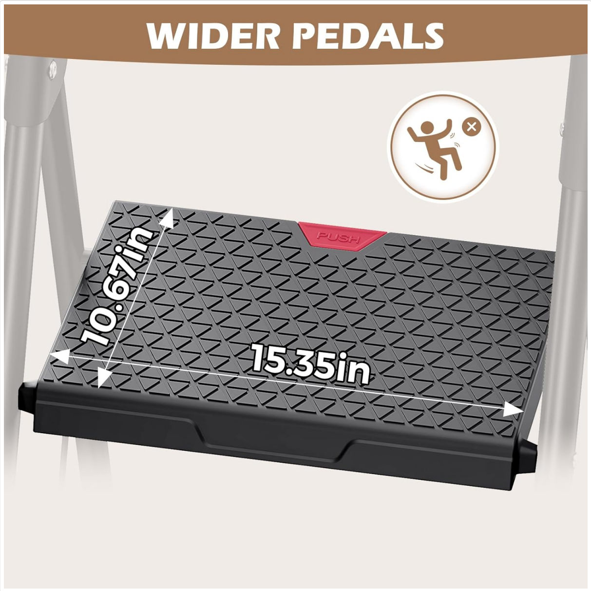
Figure 3.1: A close-up view of the ladder's wide pedals, measuring 10.67 inches by 15.35 inches, featuring a textured anti-slip surface for enhanced stability and comfort.