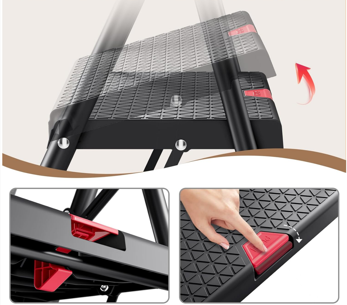
Figure 2.2: This diagram illustrates the safety lock mechanism. When the ladder is fully extended, the red buckle automatically locks into place, ensuring stability. To fold, press the red button to release the lock.