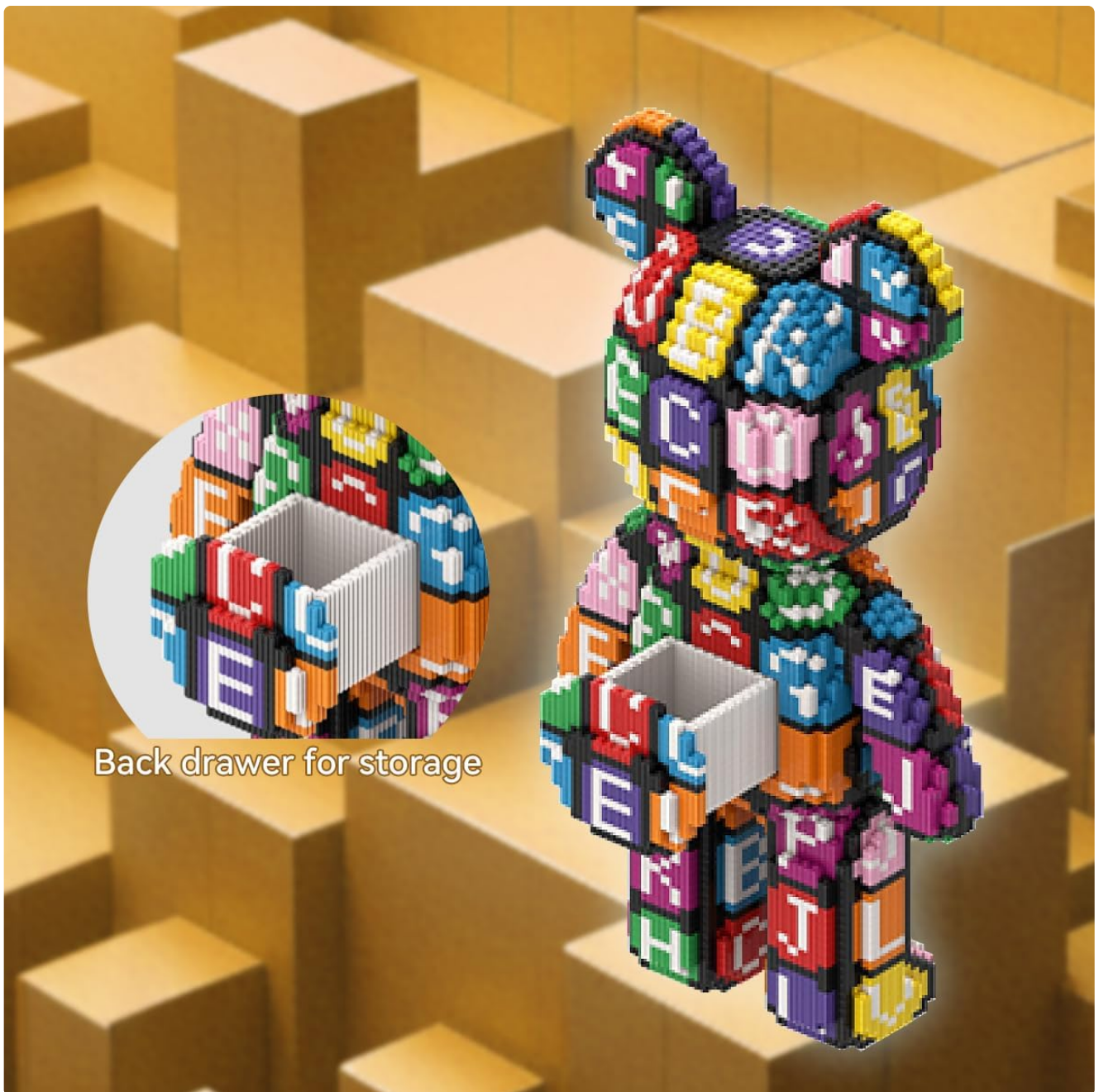
Image Description: This image highlights a functional feature of the DAHONPA Bear Bricks model: a small, integrated drawer located on its back. The drawer is shown partially pulled out, revealing its storage capacity. This feature allows for discreet storage within the completed model.