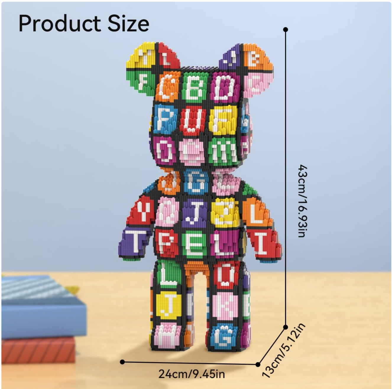
Image Description: This image displays the assembled DAHONPA Bear Bricks model from the front, with measurement lines indicating its approximate dimensions. The model stands 43cm (16.93 inches) tall, is 24cm (9.45 inches) wide, and 13cm (5.12 inches) deep. The model is composed of numerous small, colorful blocks forming letters and patterns.