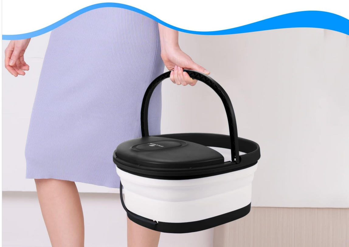
Figure 6.1: Collapsing the Foot Spa for Storage.