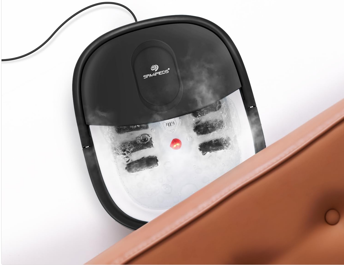
Figure 6.2: Carrying the Foot Spa with its Sturdy Handle.

Immerse yourself in comforting warmth with our luxurious foot bath, perfect for relaxing after a long day