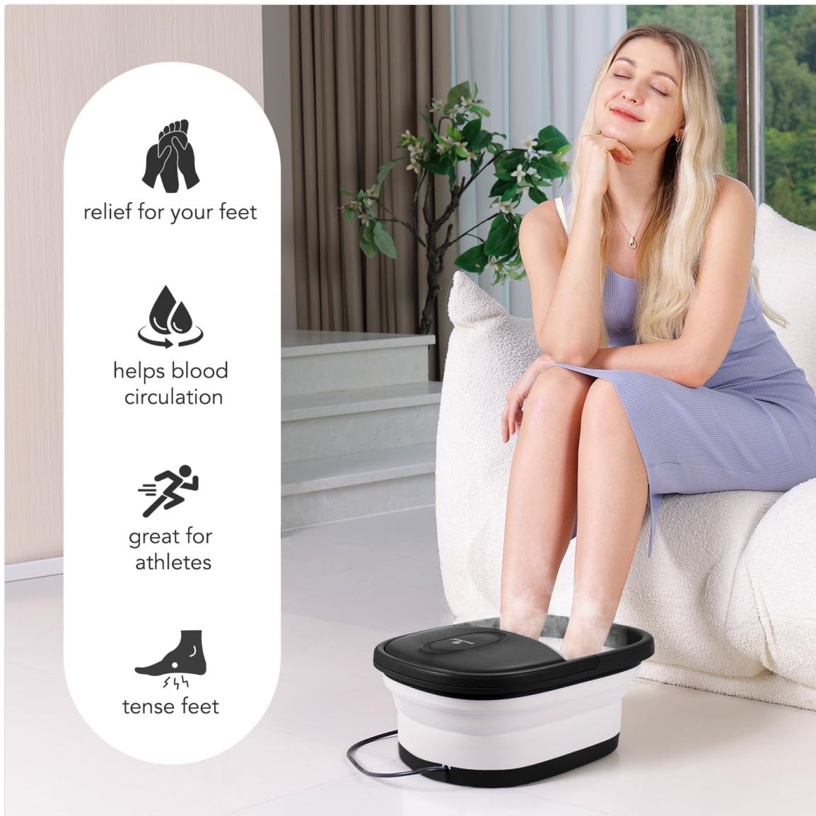
Figure 5.1: User enjoying the foot spa.