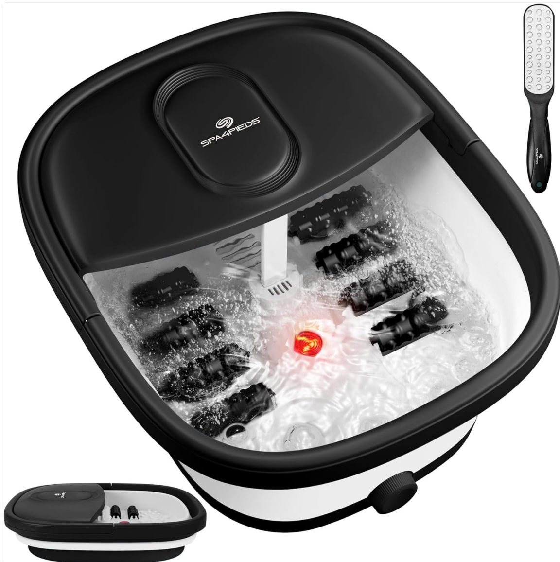
Figure 4.1: Foot Spa Ready for Use.