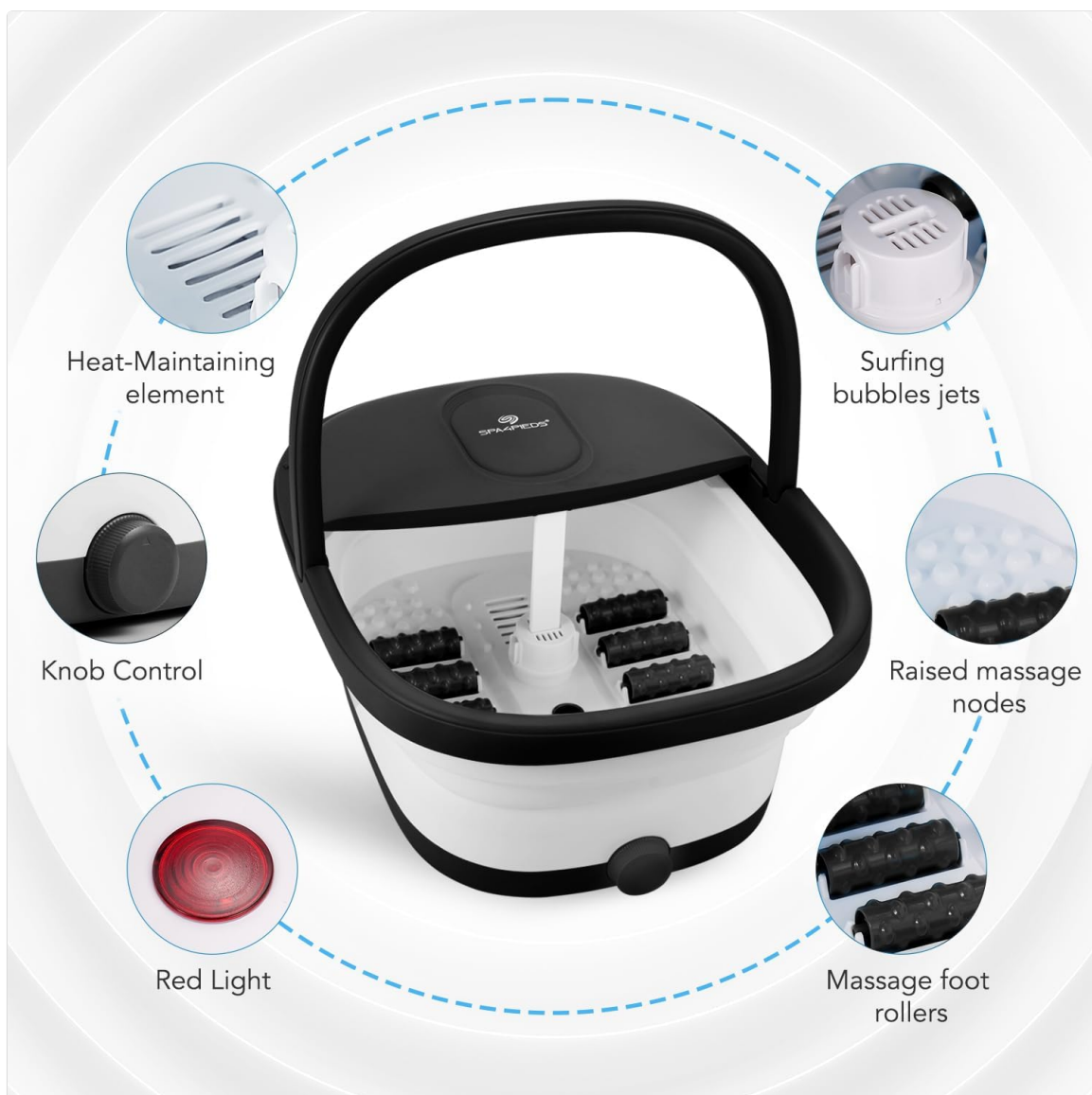
Figure 3.1: Overview of Foot Spa Components.