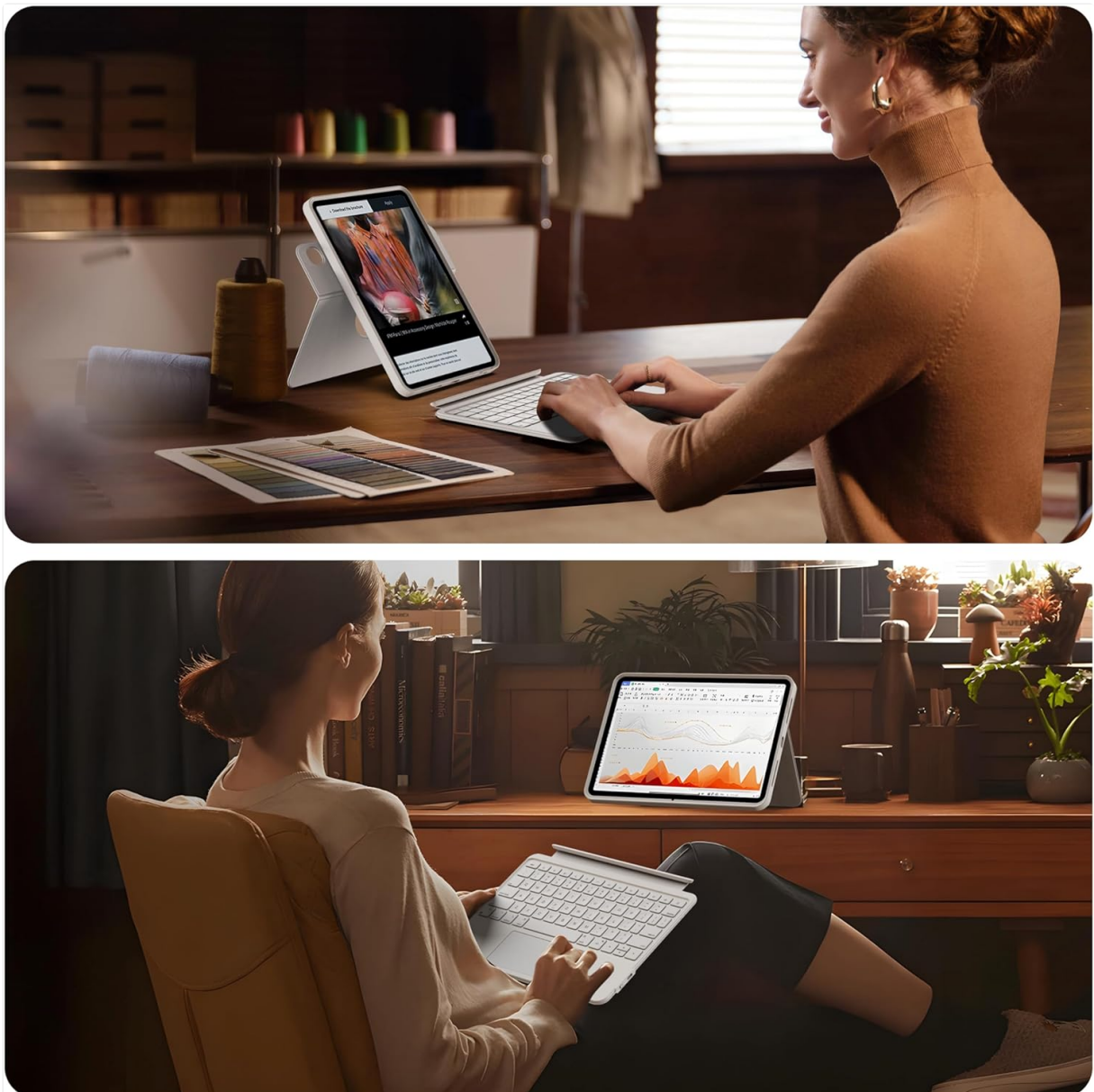
Figure 5: Examples of the keyboard case in use for productivity and leisure.