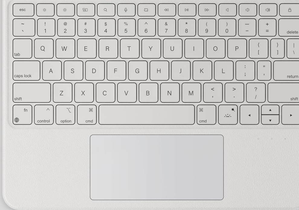
Figure 4: The 78-key keyboard layout.

Large Keys + Spacious Touchpad Independent Hotkey Design