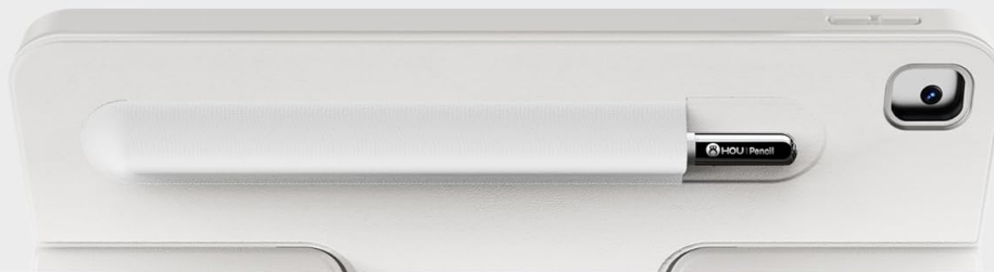
Figure 2: Overview of key product features.