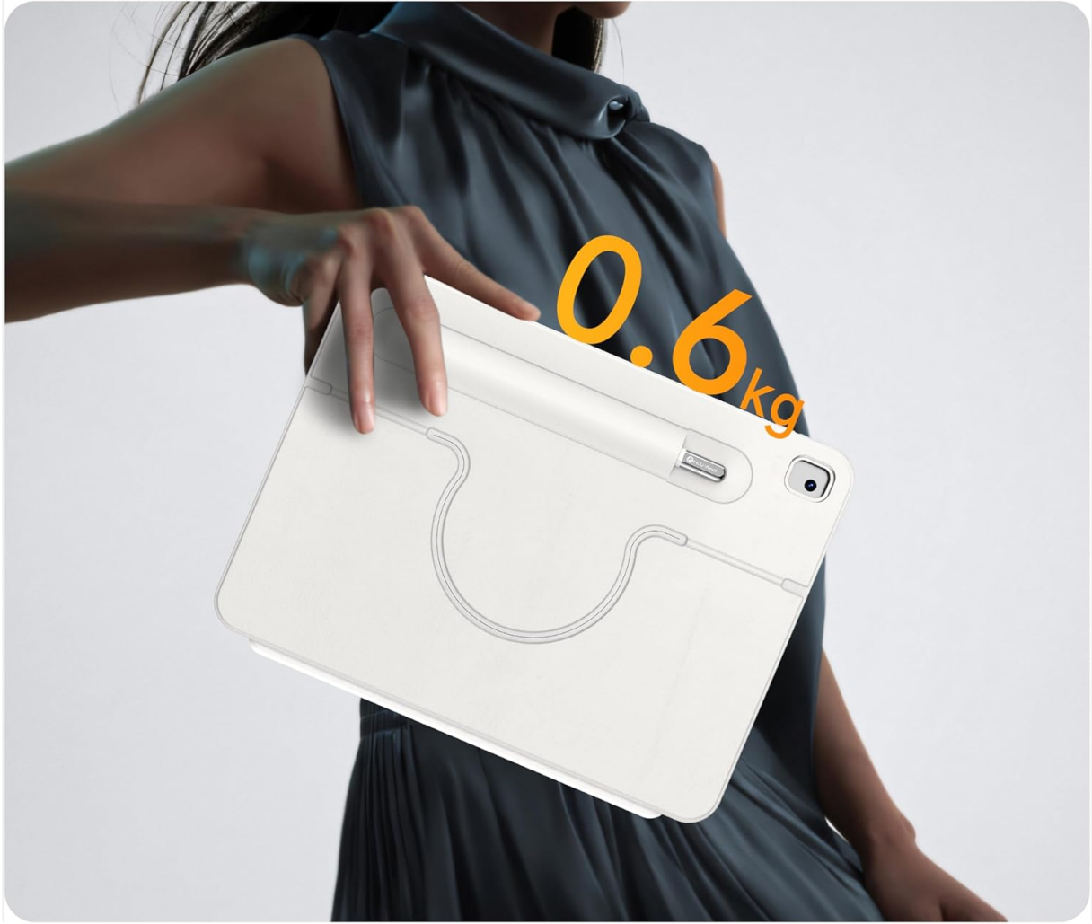
Figure 6: The ultra-light design of the keyboard case emphasizes its portability.