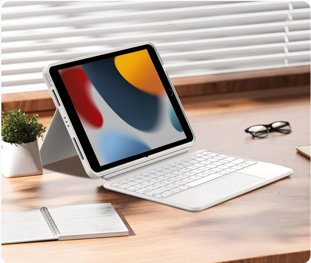
Figure 7: The keyboard case transforms your iPad into a functional laptop.