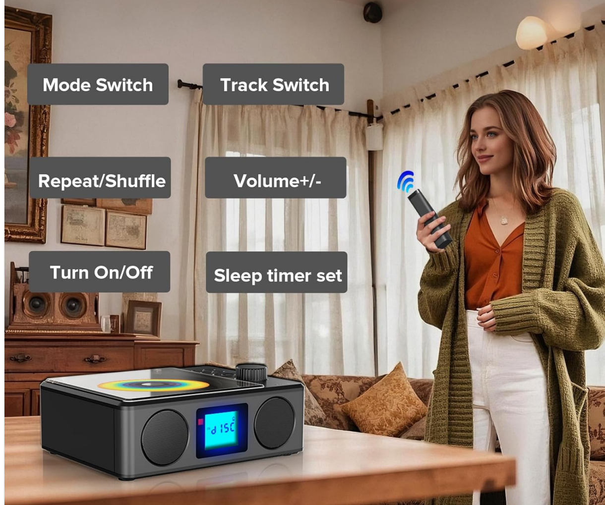
Image: A user interacting with the PM24 using the remote control, illustrating various functions accessible from the remote.