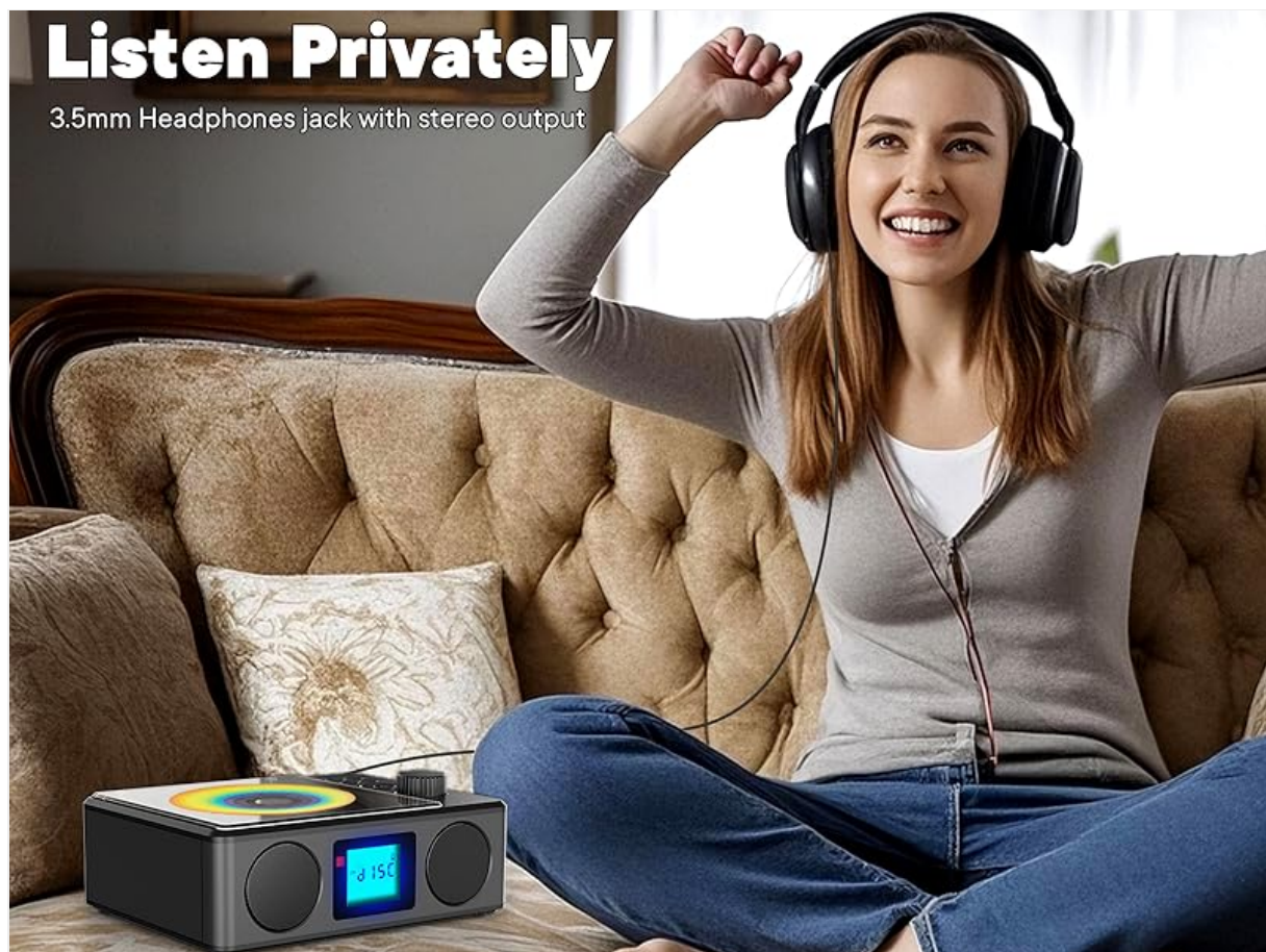
Image: A user enjoying FM radio on the PM24, with visual cues indicating different radio frequencies.