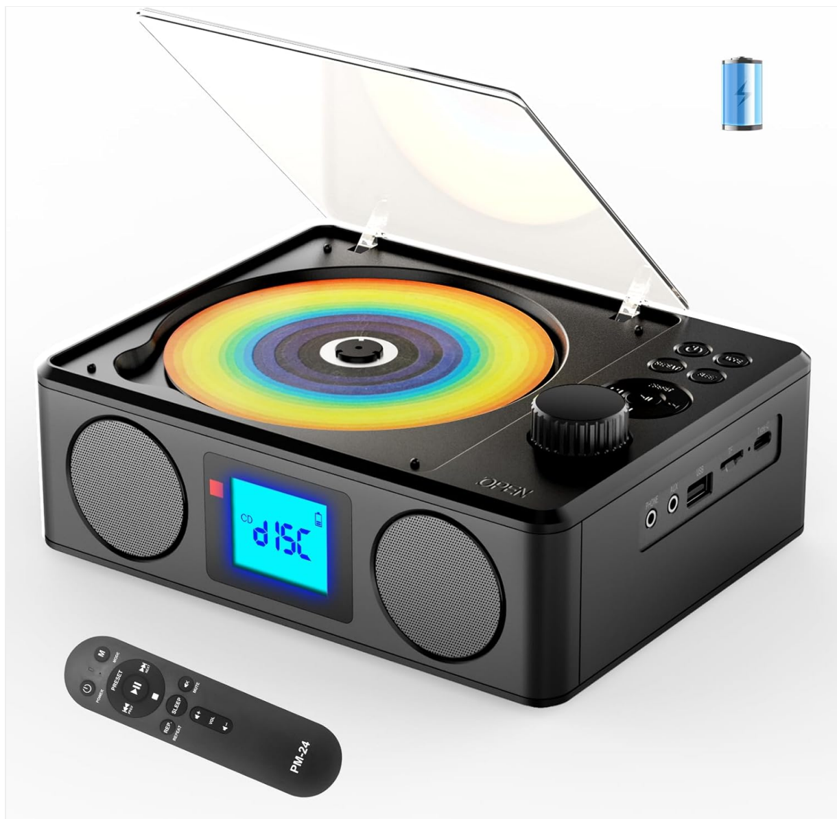
Image: The Kuephom PM24 Portable CD Player, showcasing its design with an open CD lid, remote control, and an indicator for its rechargeable battery.