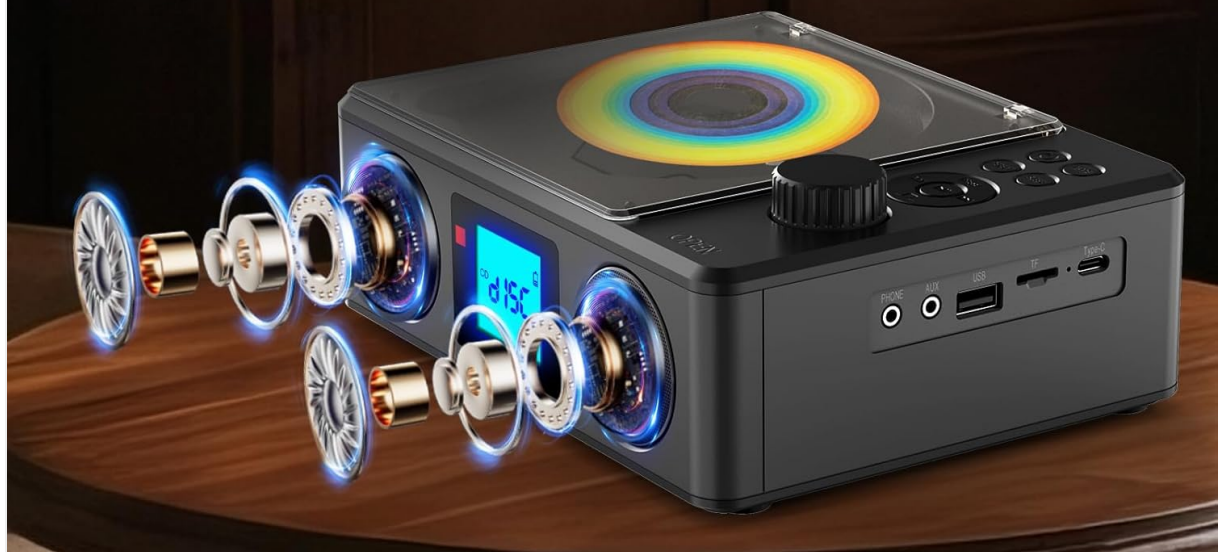
Image: A visual representation of the PM24's key features, including CD/MP3 playback, Bluetooth connectivity, USB and TF card support, FM radio, audio input, headphone jack, remote control, rechargeable battery, and sleep timer.