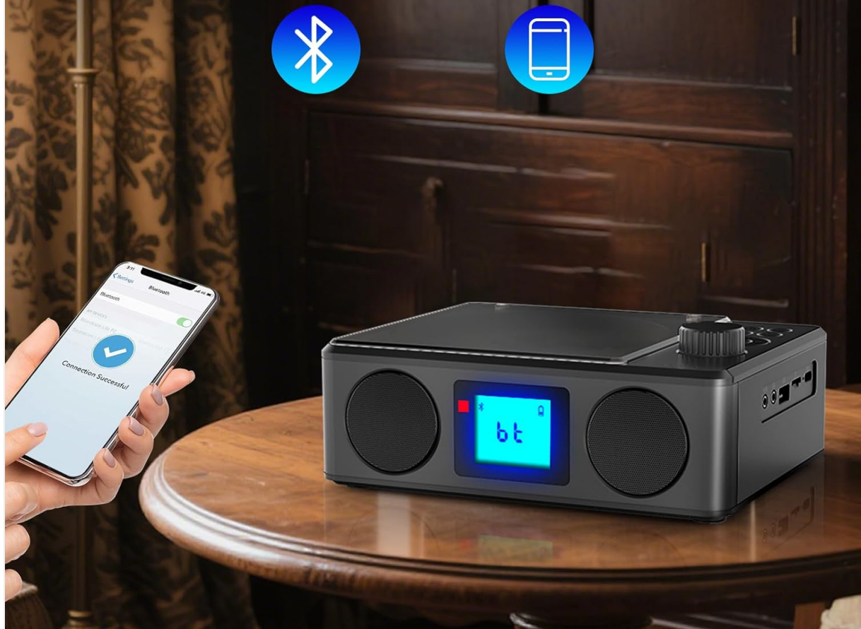
Image: A smartphone screen showing a successful Bluetooth connection to the PM24, with the player's display confirming 'bt' mode.