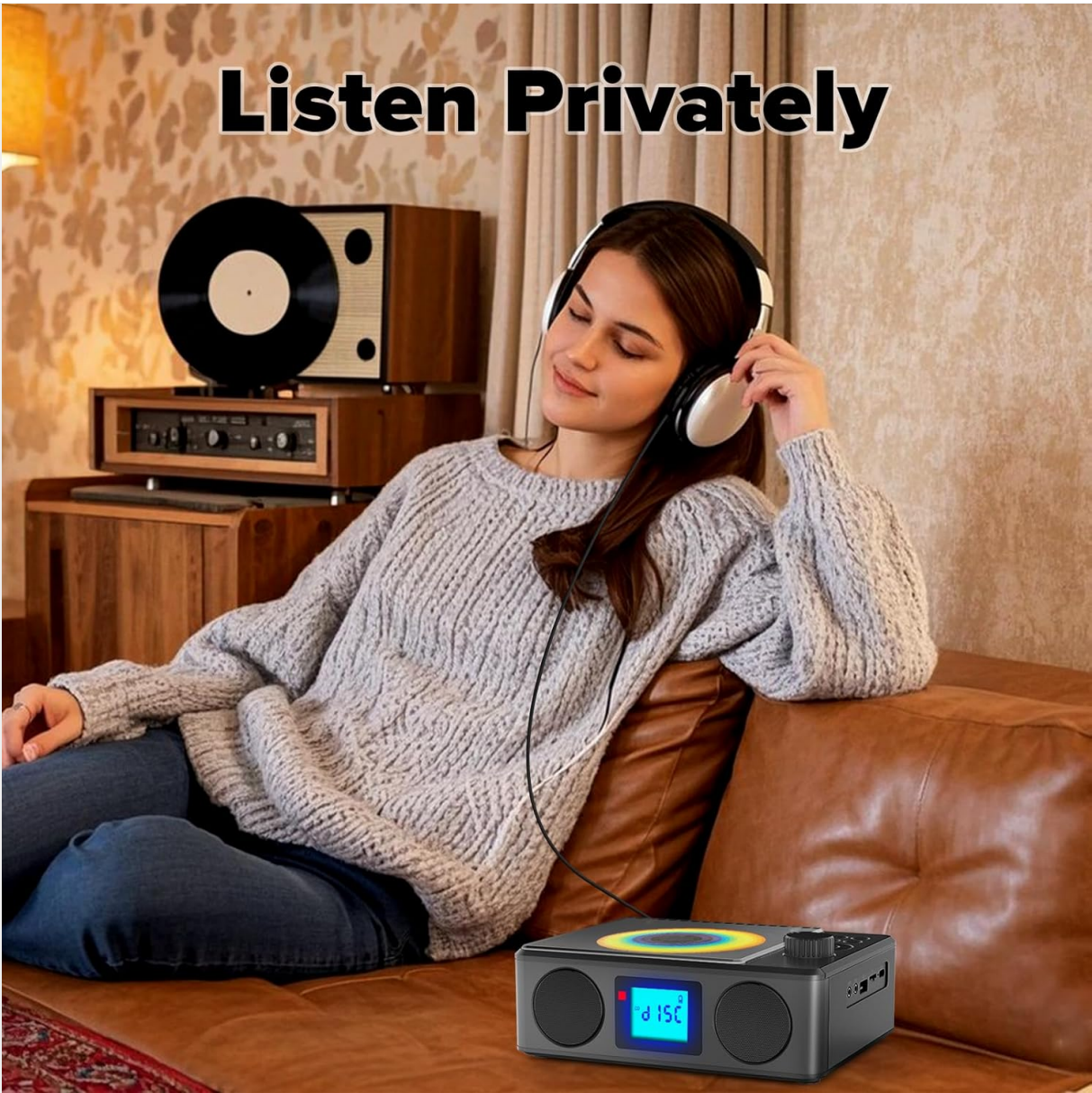
Image: A user enjoying private audio through headphones connected to the PM24.