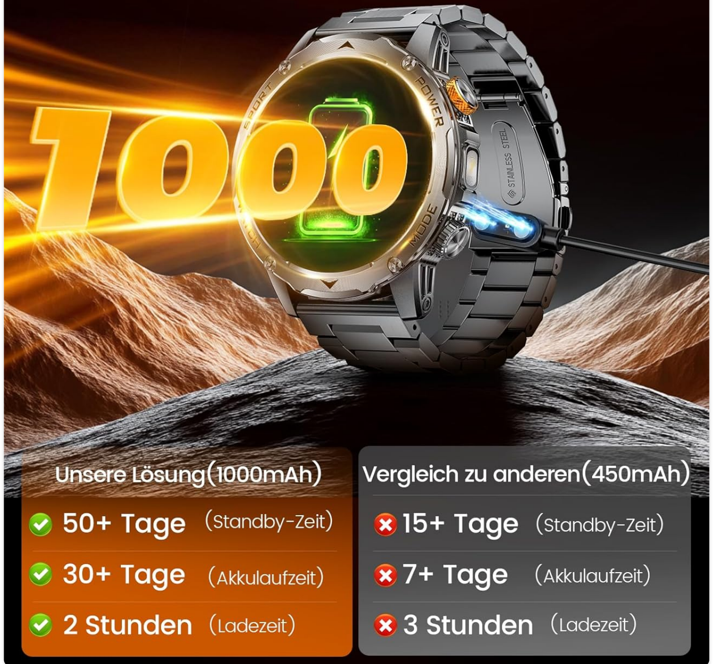
Figure 2: Charging the LIGE EF12-G Smartwatch with its high-capacity battery.