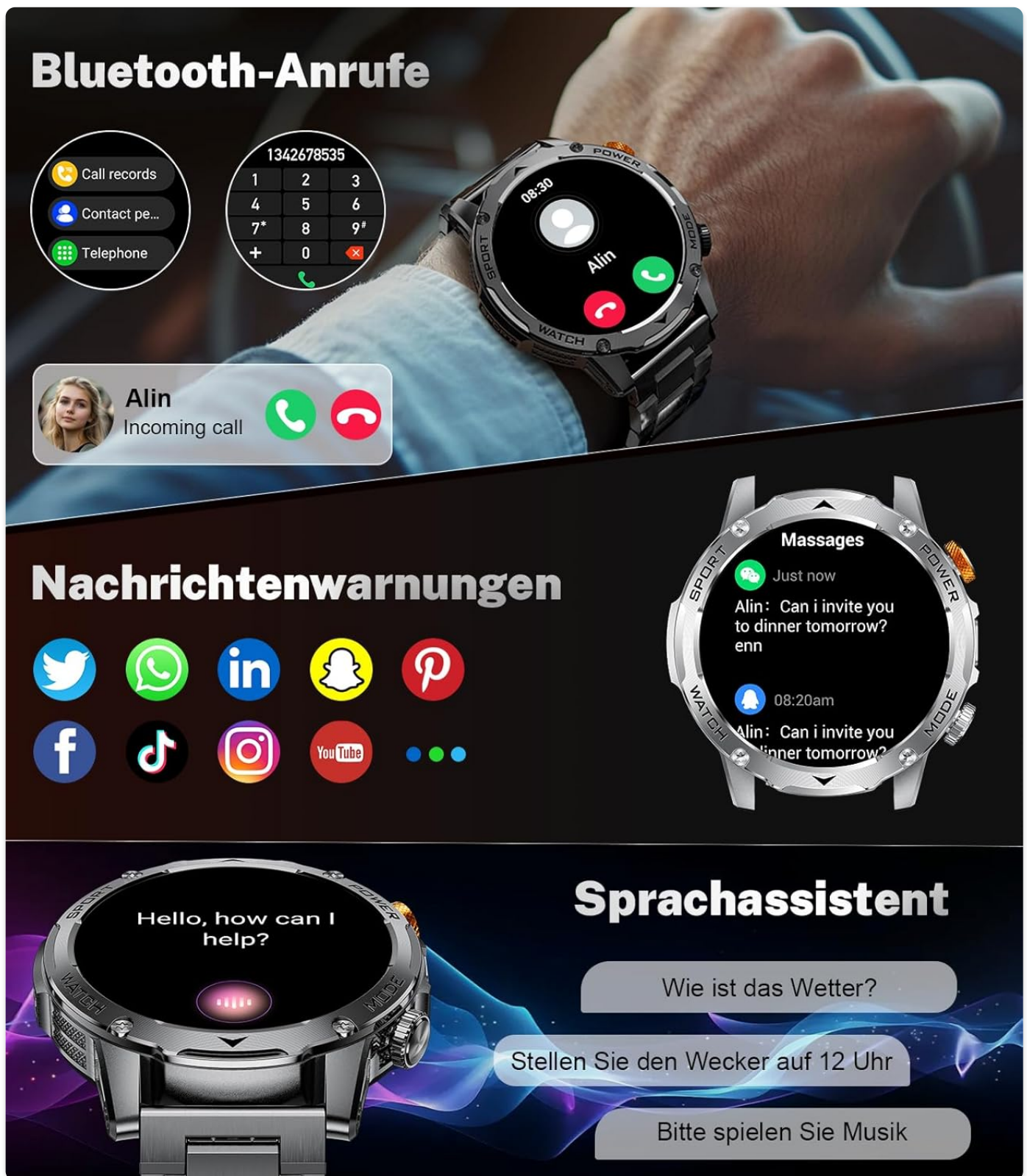
Figure 3: Smartwatch features for Bluetooth calls, message notifications, and voice assistant.