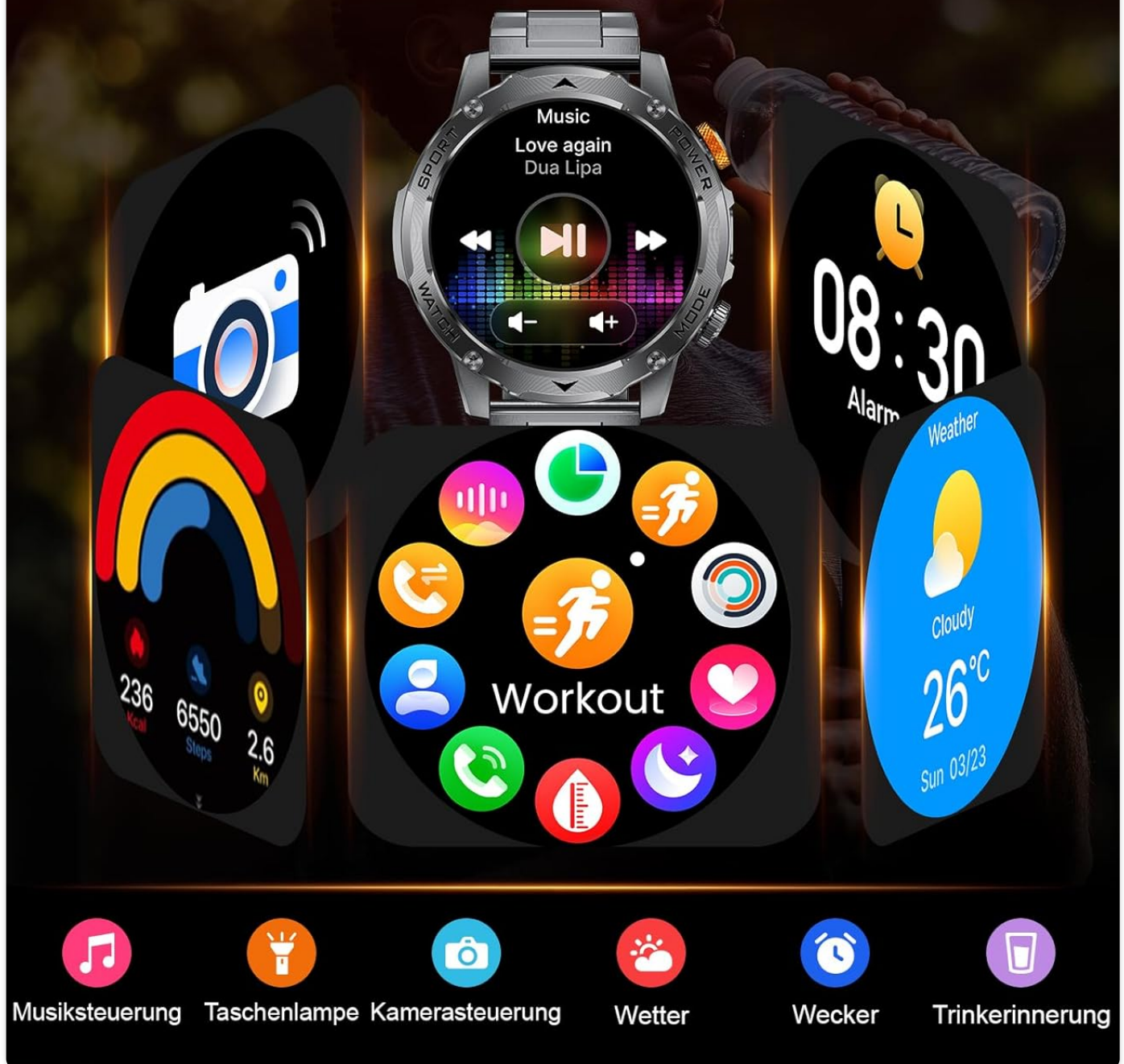
Figure 7: Multifunctional features of the smartwatch.

Macht die Smartwatch integrierter in Ihr tägliches Leben