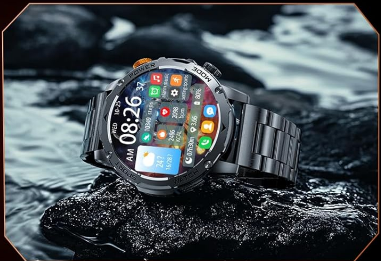
Figure 8: Smartwatch durability and water resistance.