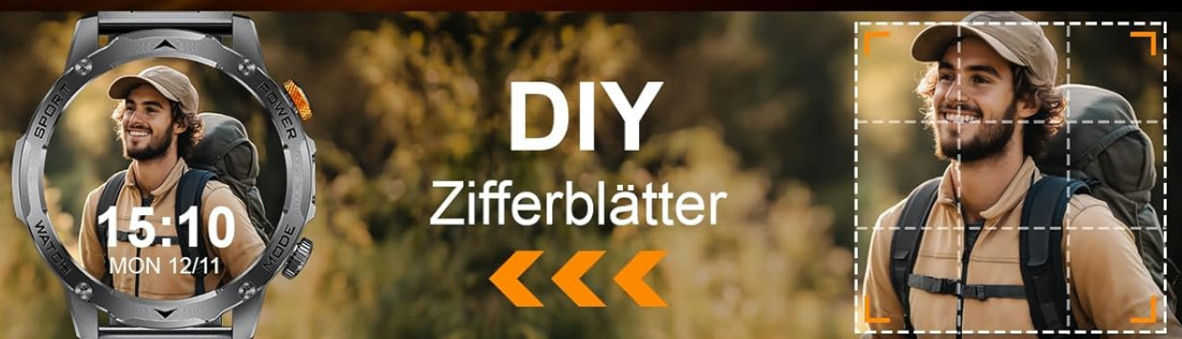
Figure 6: Customization options for watch faces.