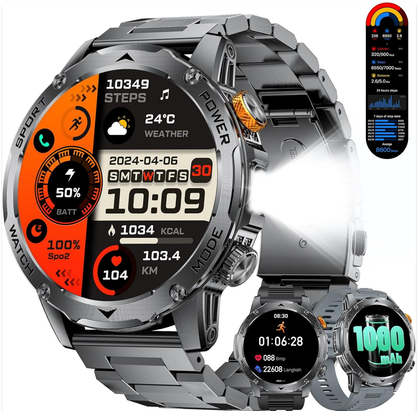
Figure 1: LIGE EF12-G Smartwatch showcasing its main display and features.