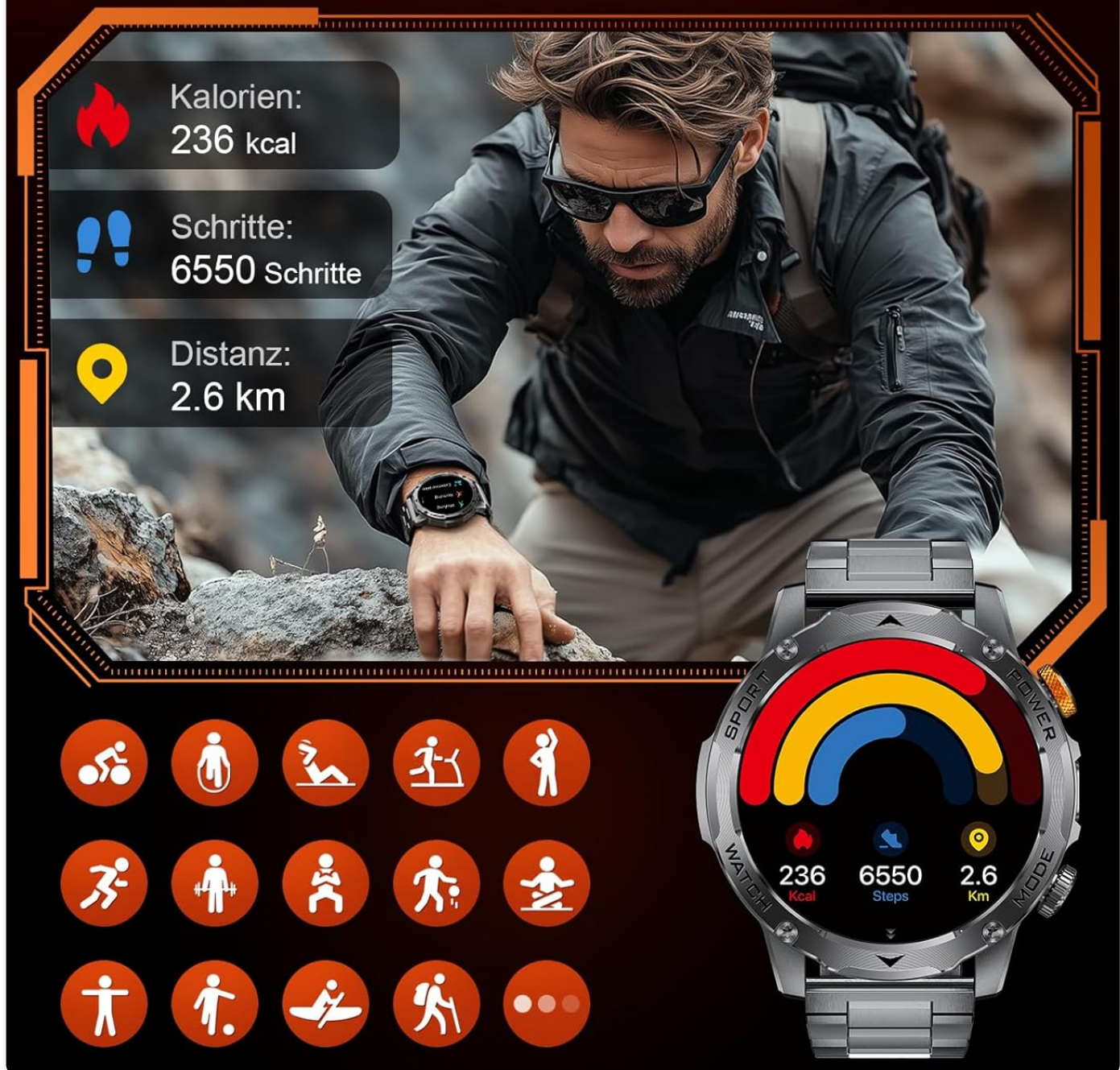
Figure 4: Overview of 100+ sports modes and activity tracking.

Trainiere in vollen Zügen und fessele jeden deiner Schritte