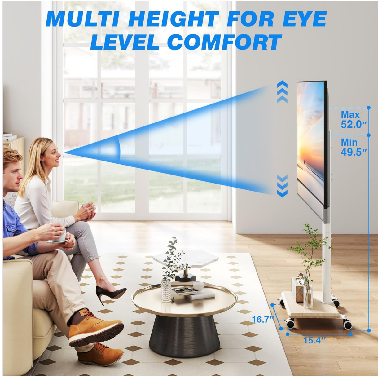
Image: Diagram showing height adjustment range.

The stand allows for flexible height adjustment to achieve an optimal viewing experience. To adjust the height, loosen the securing mechanisms on the vertical column, slide the TV to your desired height (between 49.5 and 52.0 inches), and then firmly re-tighten the mechanisms.