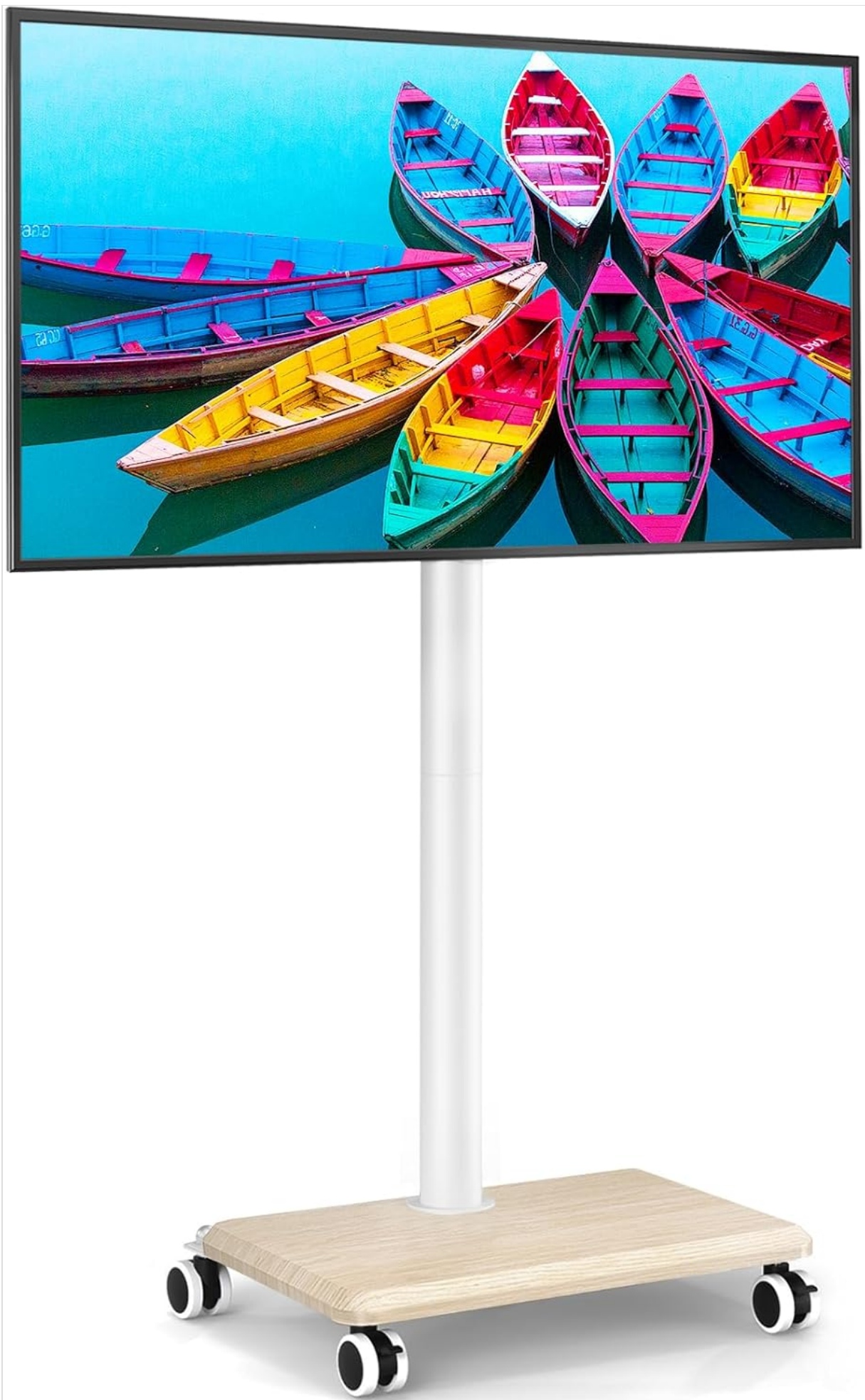
Image: River Rolling TV Stand with a TV displaying colorful boats.