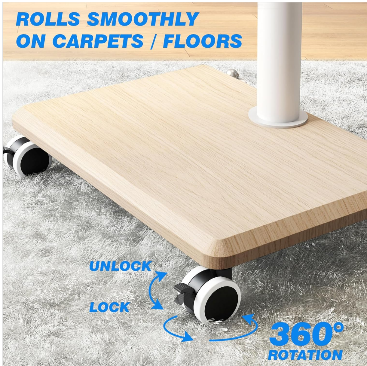
Image: Close-up of lockable wheels.