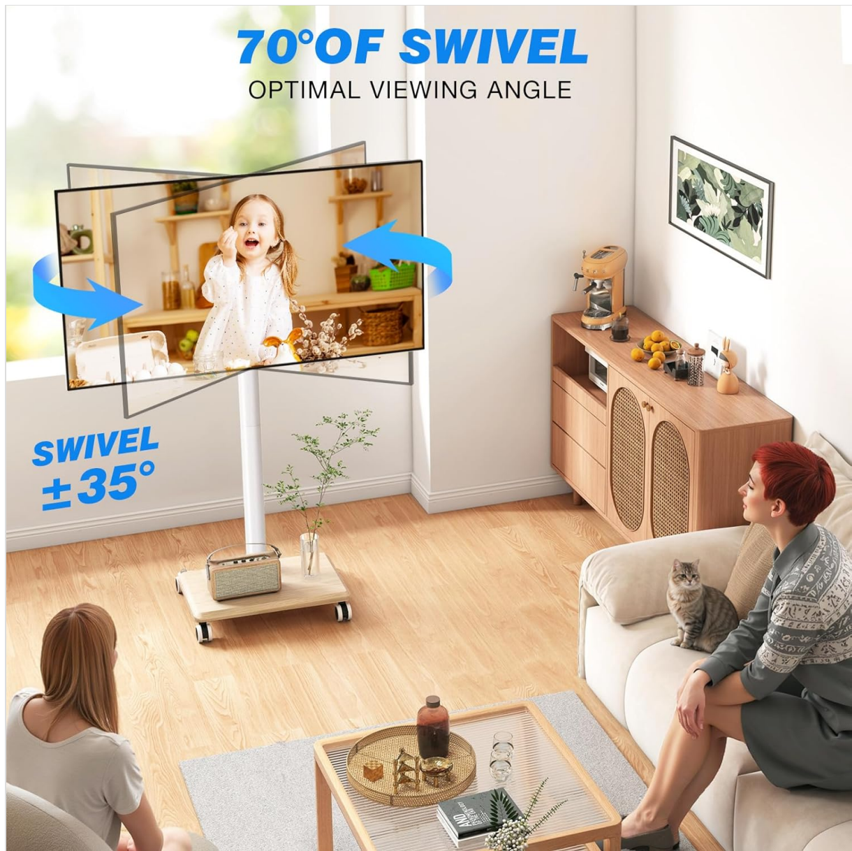
Image: Diagram showing the 70-degree swivel capability.