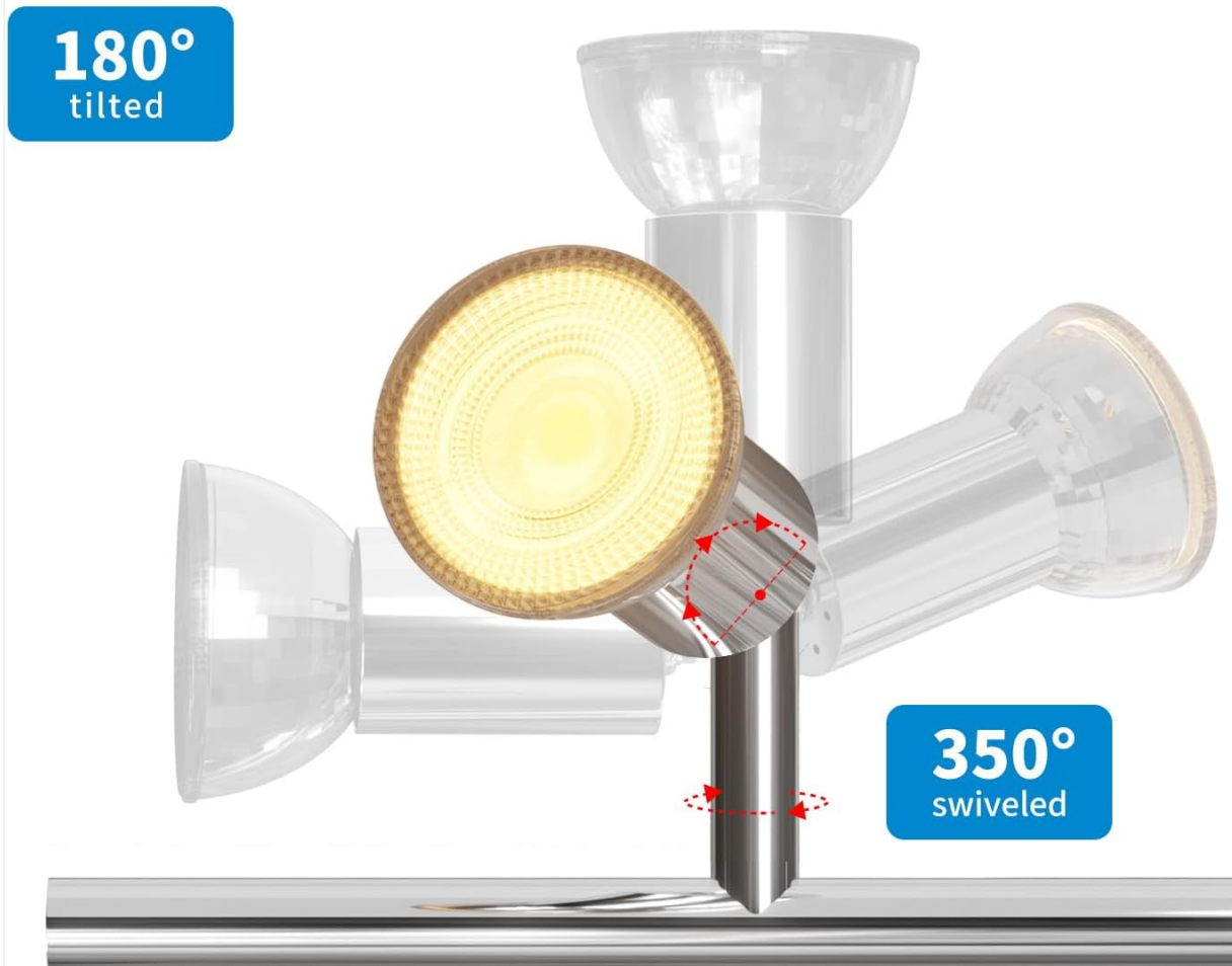
Figure 2: Adjustable Light Head Design. Each light head offers 180 degrees of vertical tilt and 350 degrees of horizontal swivel for precise light direction.