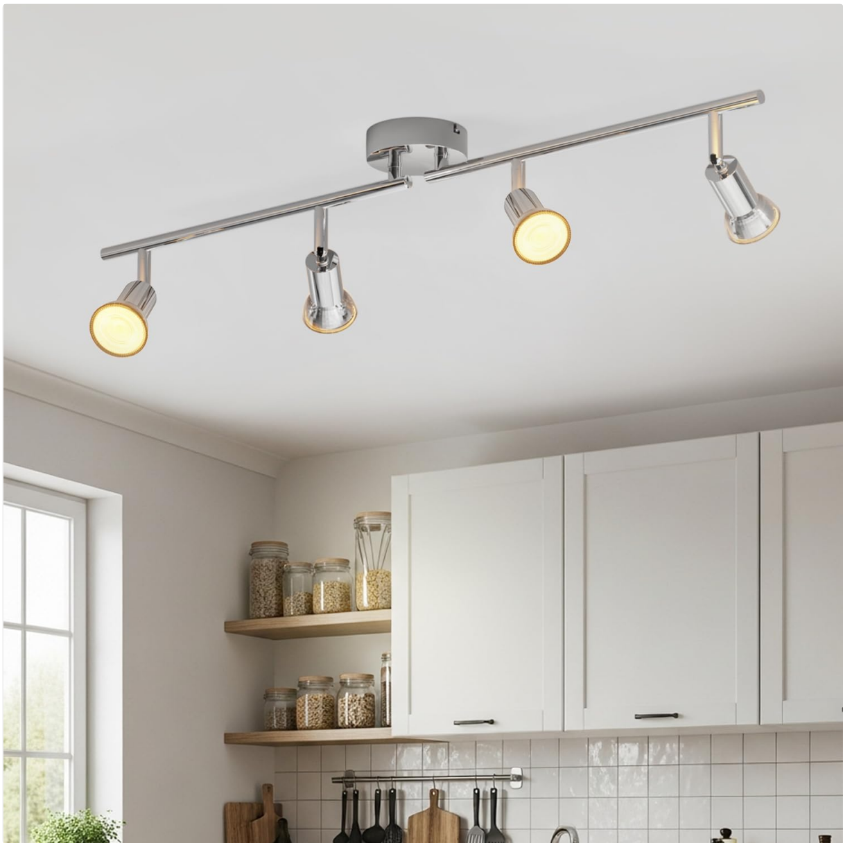
Figure 3: Fixture in Use. The track lighting provides focused illumination, ideal for task lighting or accentuating features in a room.