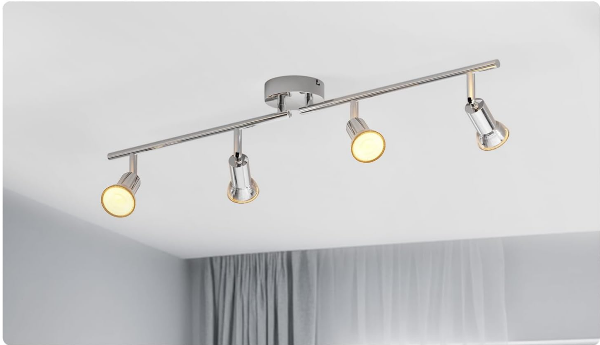
Figure 4: GU10 Bulb Compatibility. The fixture is designed to work with standard GU10 base bulbs (maximum 40W).