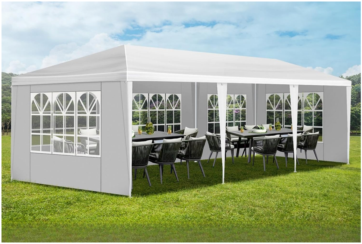
Figure 1: Fully assembled LINKHOO 10x30 FT Outdoor Canopy Party Tent with five removable sidewalls, set up on a grassy lawn.