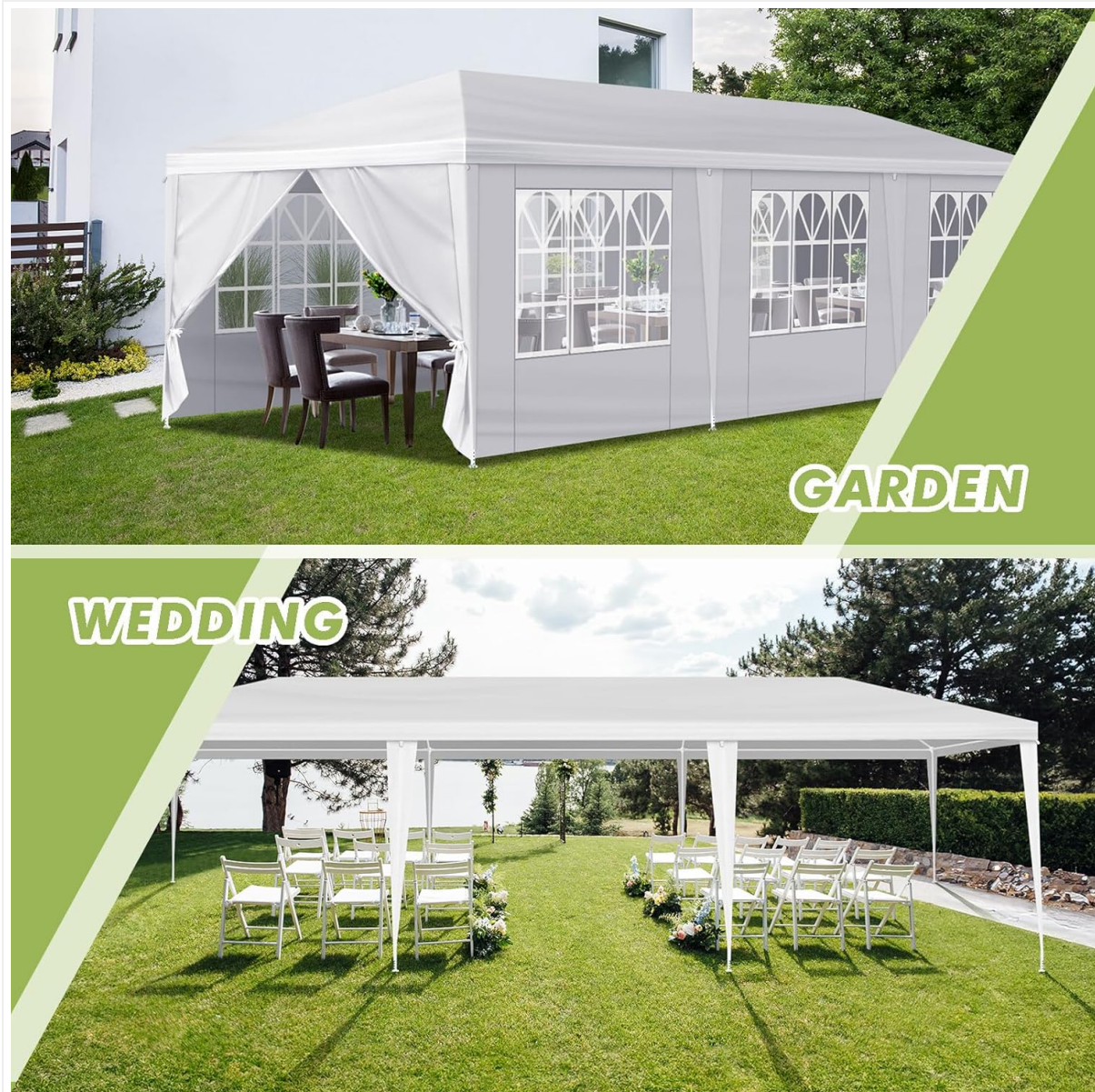
Figure 5: The tent is suitable for various events, including garden parties and weddings.

The tent is designed for versatility in various outdoor conditions. The removable sidewalls can be adjusted to control sunlight exposure and airflow. For optimal shading, keep all sidewalls attached. For increased ventilation, remove some or all sidewalls.