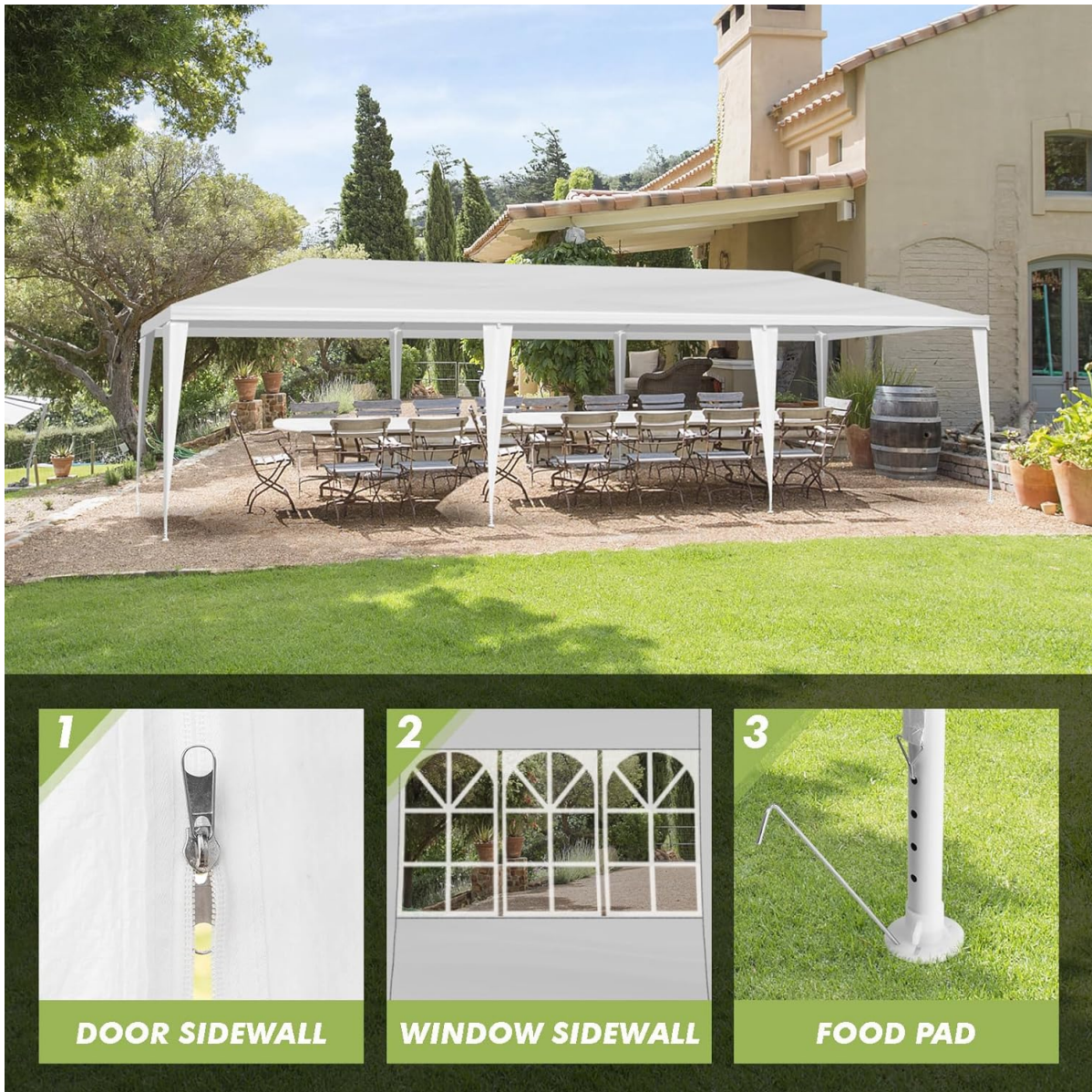
Figure 4: Close-up images of tent components: a zippered door sidewall, a window sidewall, and a foot pad for the tent poles.