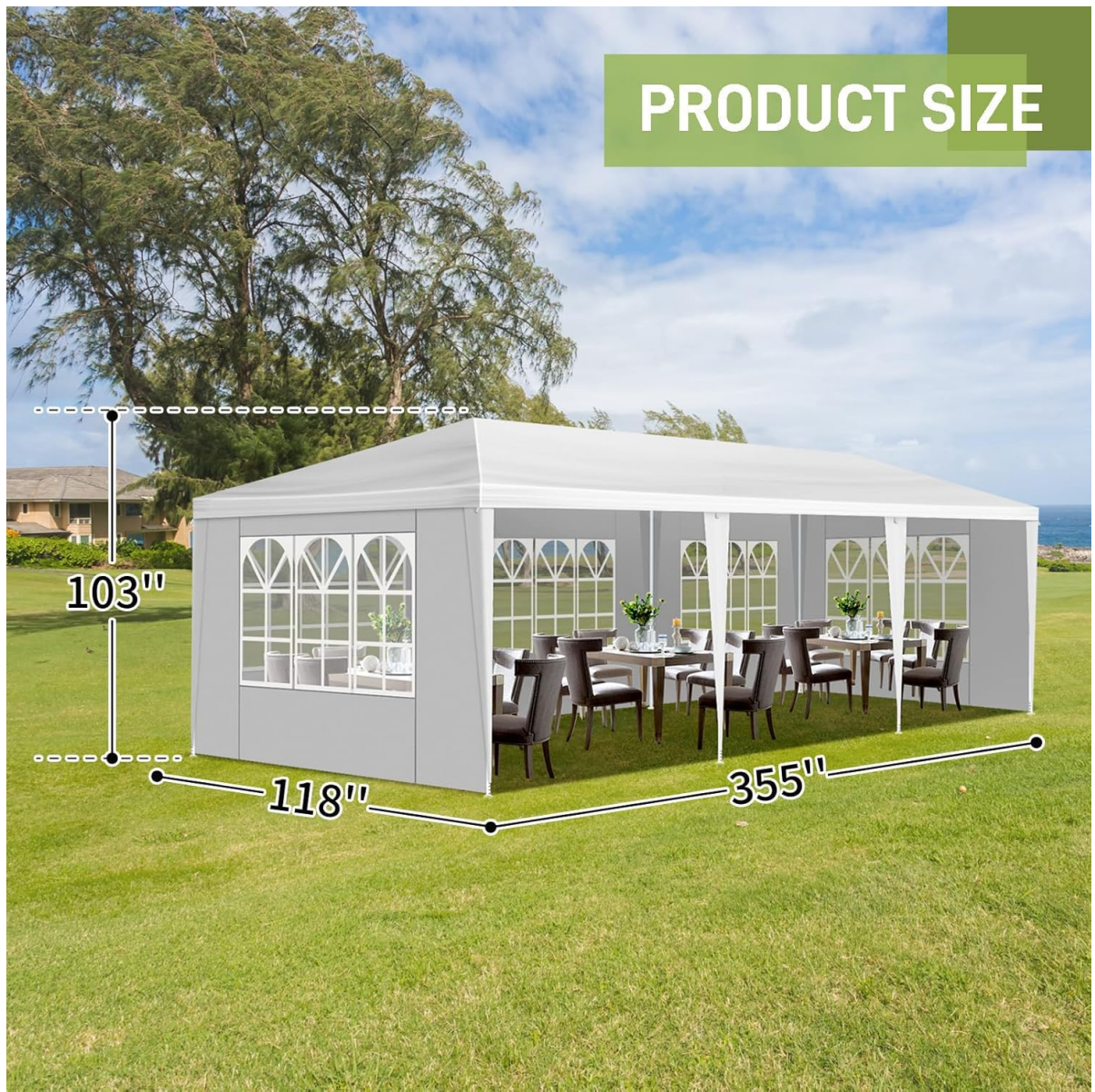
Figure 2: Diagram illustrating the dimensions of the 10x30 FT canopy tent, showing a length of 355 inches, width of 118 inches, and height of 103 inches.