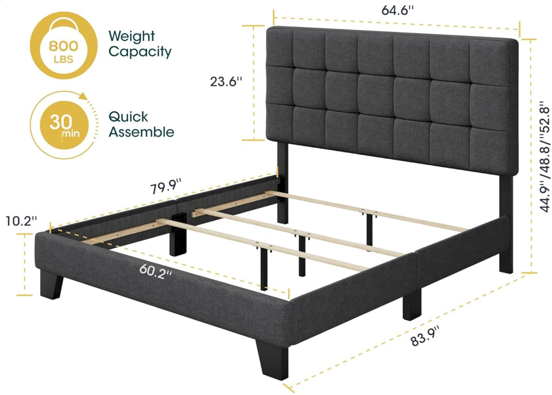
Image 7.1: Detailed dimensions, weight capacity, and estimated assembly time for the Queen Size bed frame.

L x W x H: 83.9" x 64.6" x 44.9"/48.8"/52.8"