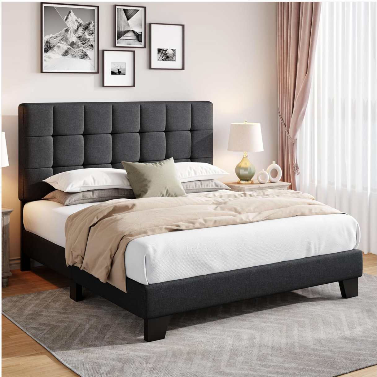
Image 2.1: Overview of the assembled WEEWAY Queen Size Upholstered Platform Bed in dark grey, featuring a square-stitched headboard.