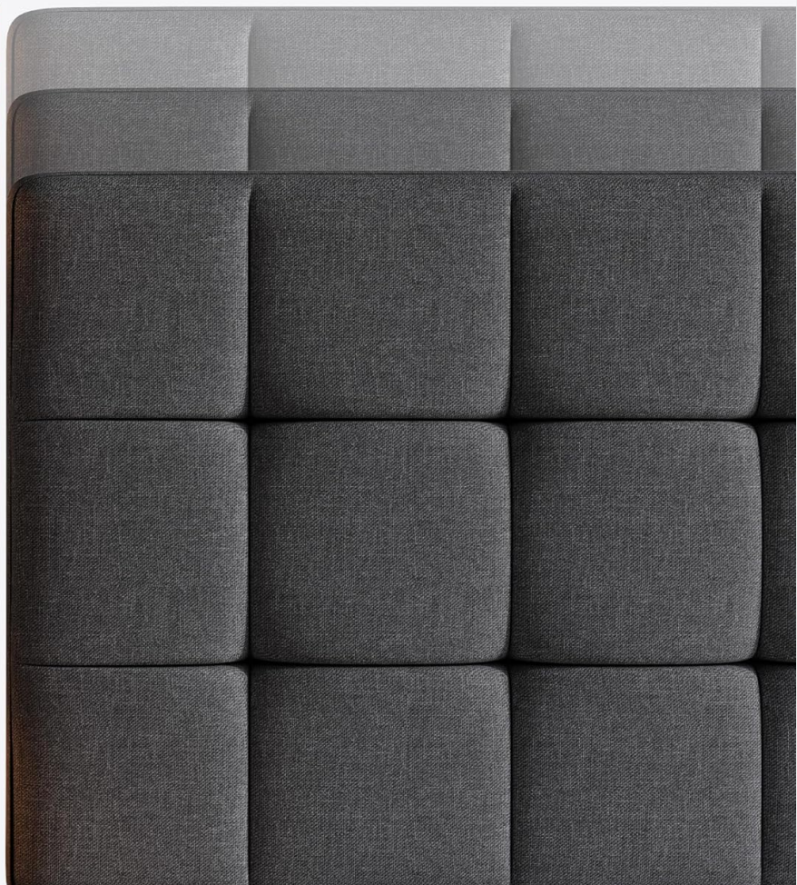
Image 3.2: The headboard offers three adjustable height levels (44.9", 48.8", 52.8") to accommodate various mattress and box spring combinations.