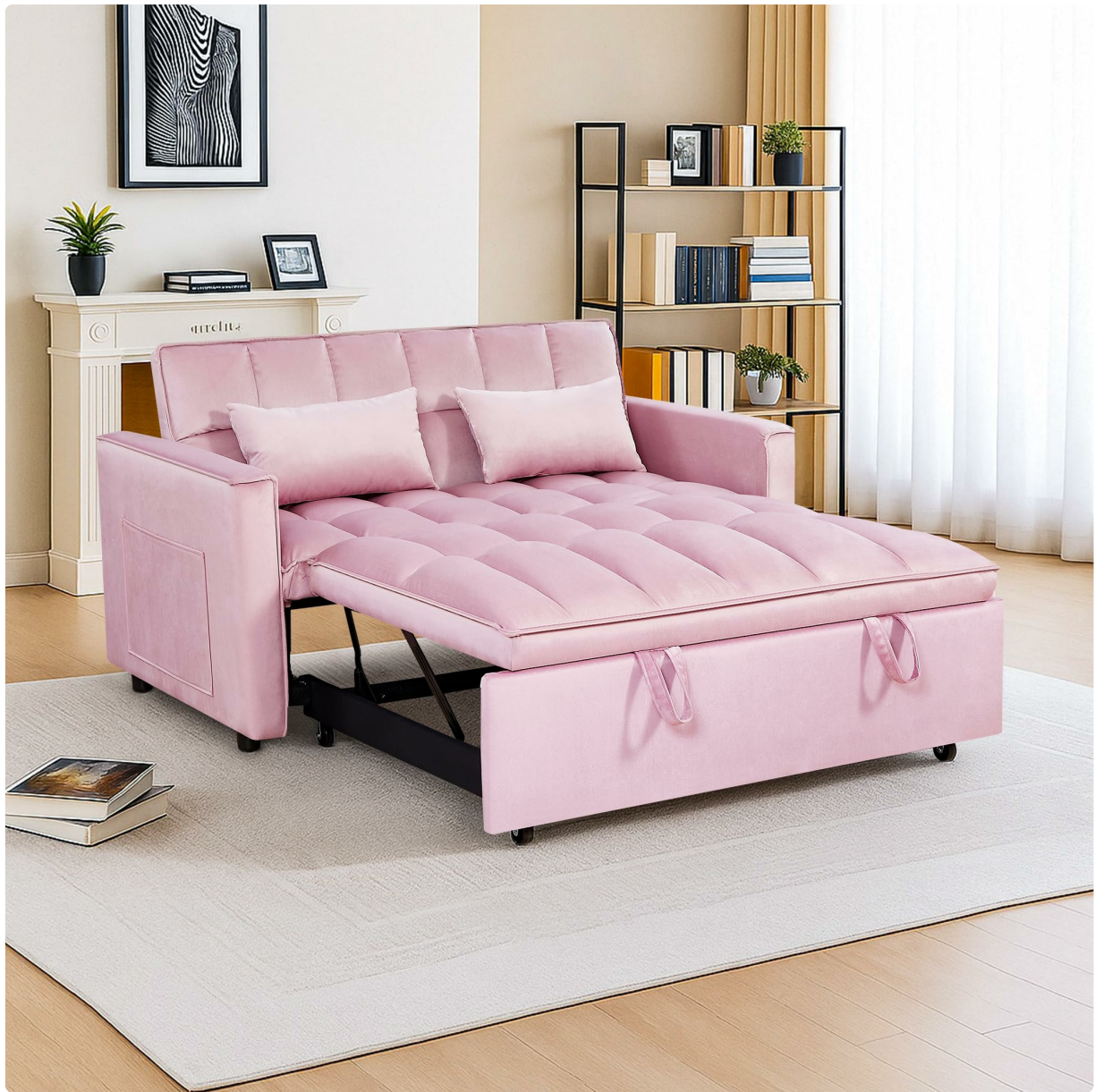
Image: The Resenkos 54-inch Velvet Convertible Sleeper Sofa Bed in its standard sofa configuration, showcasing its design and color.