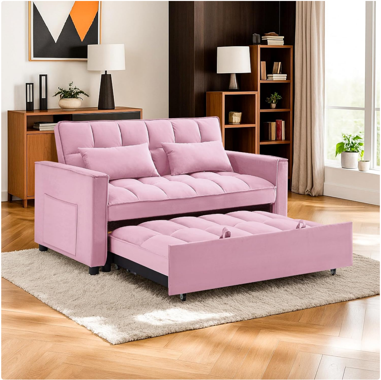
Image: The Resenkos sofa in the process of being converted from a sofa to a chaise lounge, showing the pull-out mechanism.