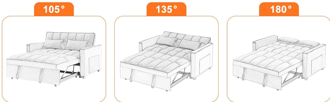
Image: The Resenkos sofa fully converted into a sleeper bed, demonstrating its functionality for overnight guests.