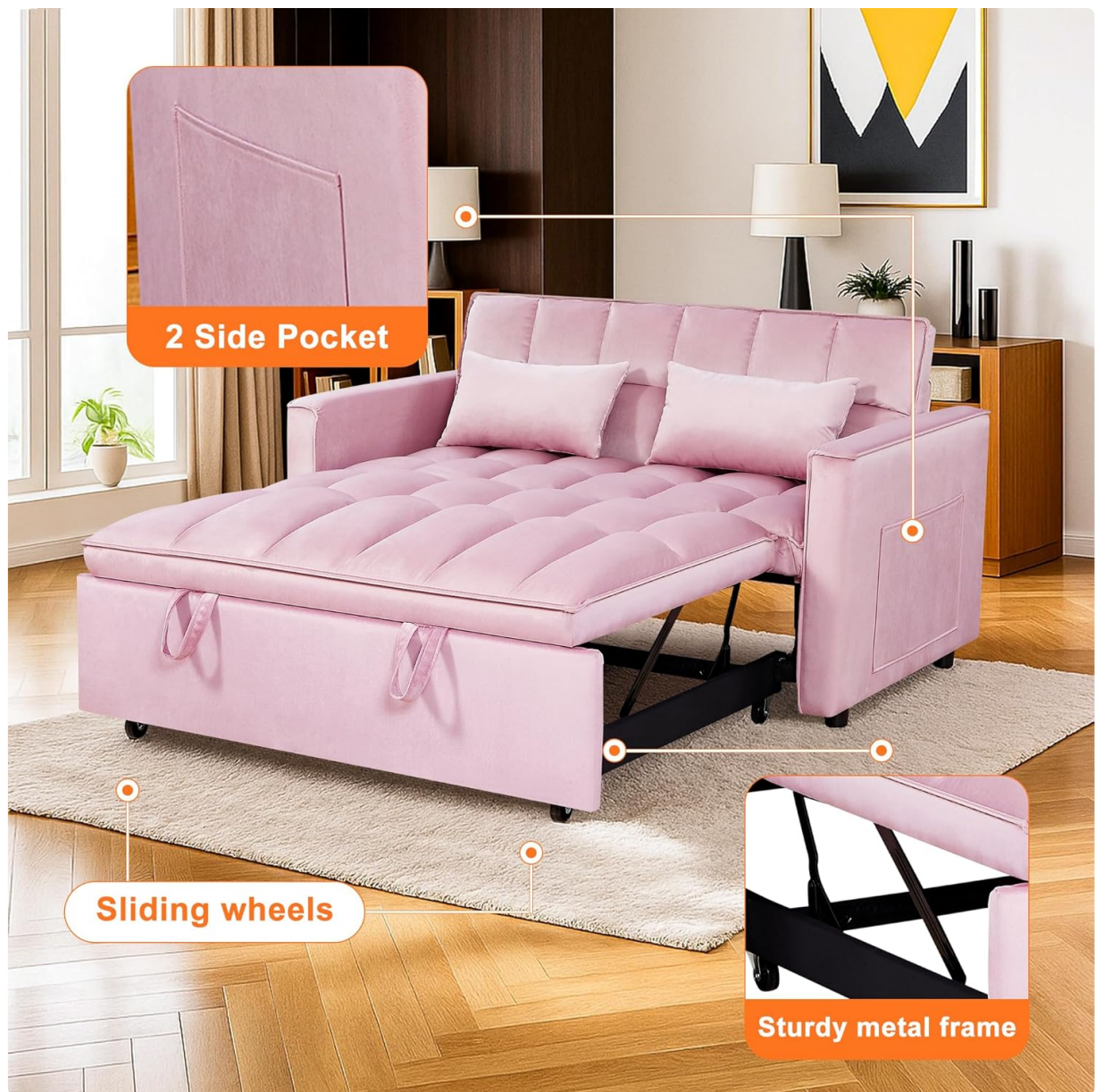
Image: Close-up view of the Resenkos sofa highlighting the practical side storage pockets and the sliding wheels for easy movement.