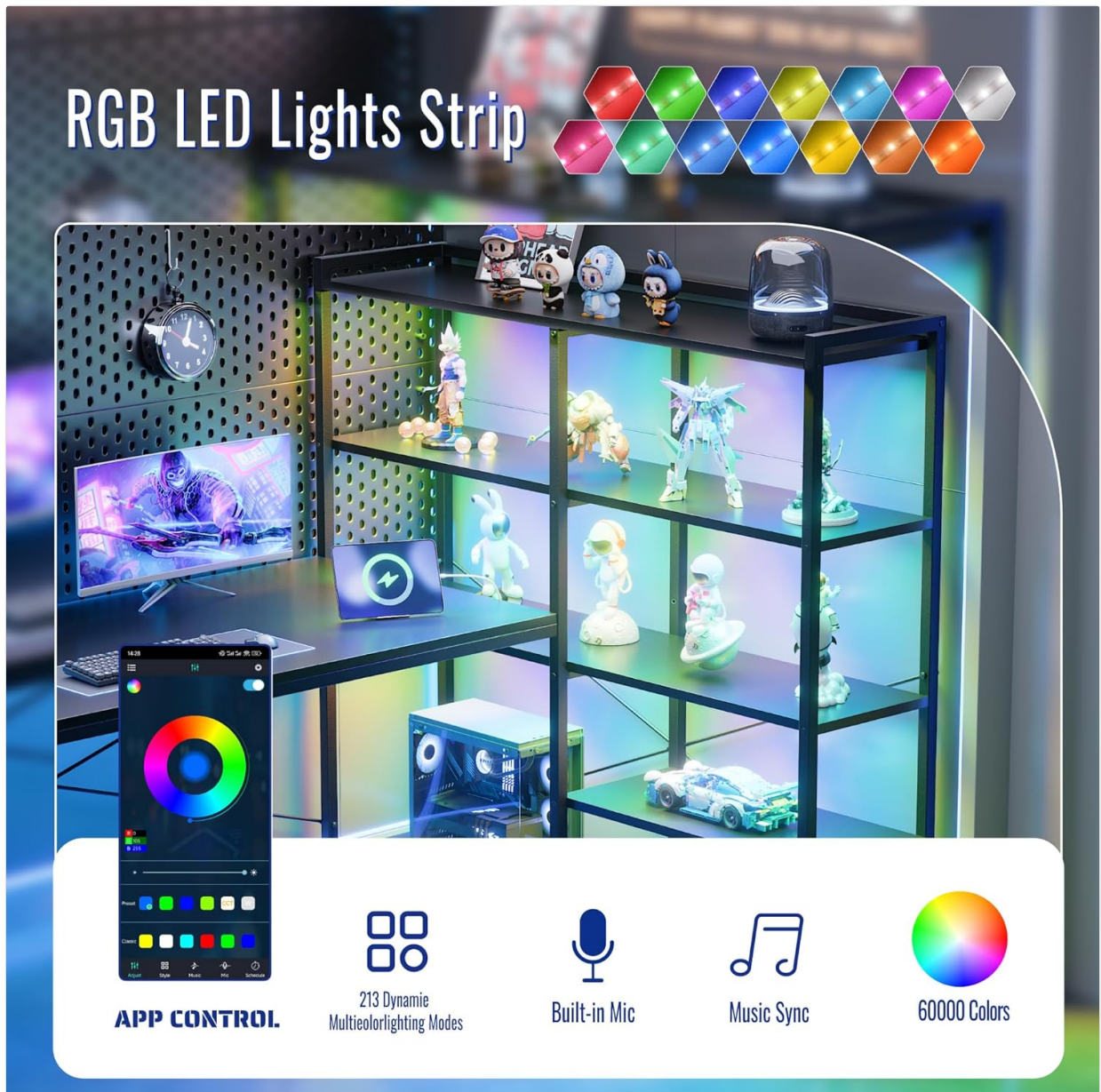
Image: A black L-shaped desk setup with shelves featuring RGB LED lighting, demonstrating the smartphone app control for various lighting modes and colors.