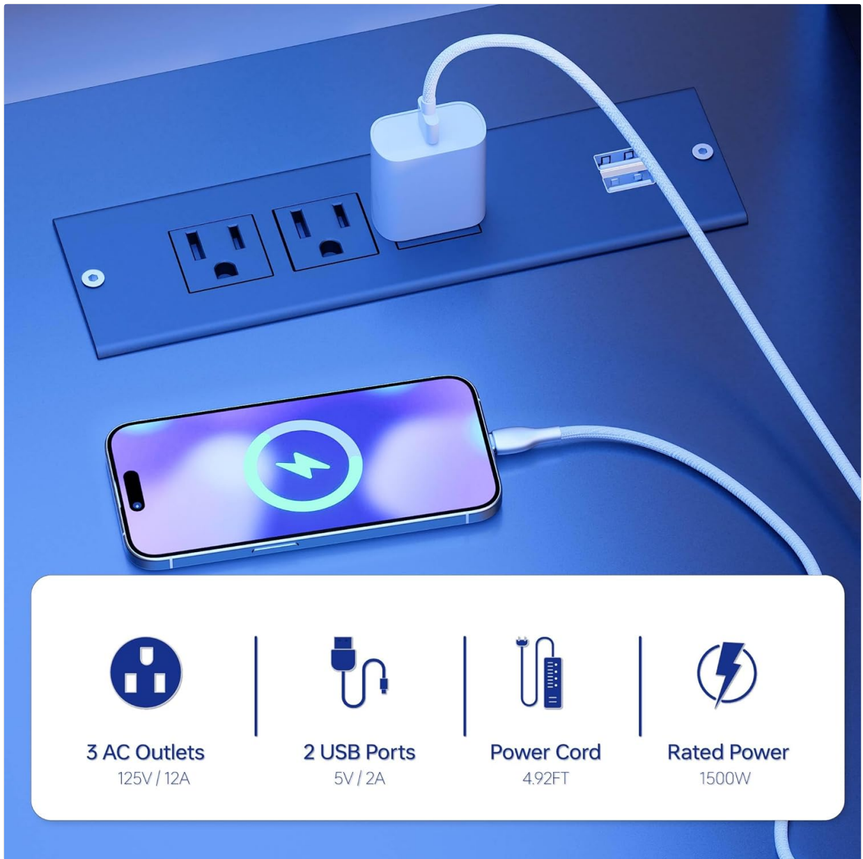
Image: A detailed view of the integrated power strip, featuring three AC outlets and two USB ports, with a smartphone connected for charging.