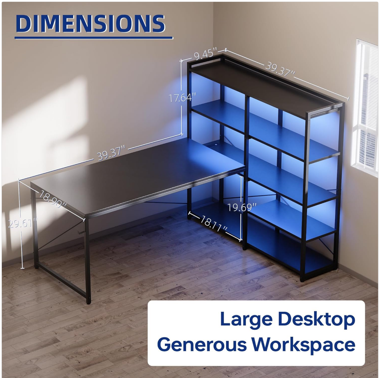
Image: A detailed diagram illustrating the overall dimensions of the Pamray L-shaped computer desk, including the main desktop and the integrated 5-tier shelving unit.