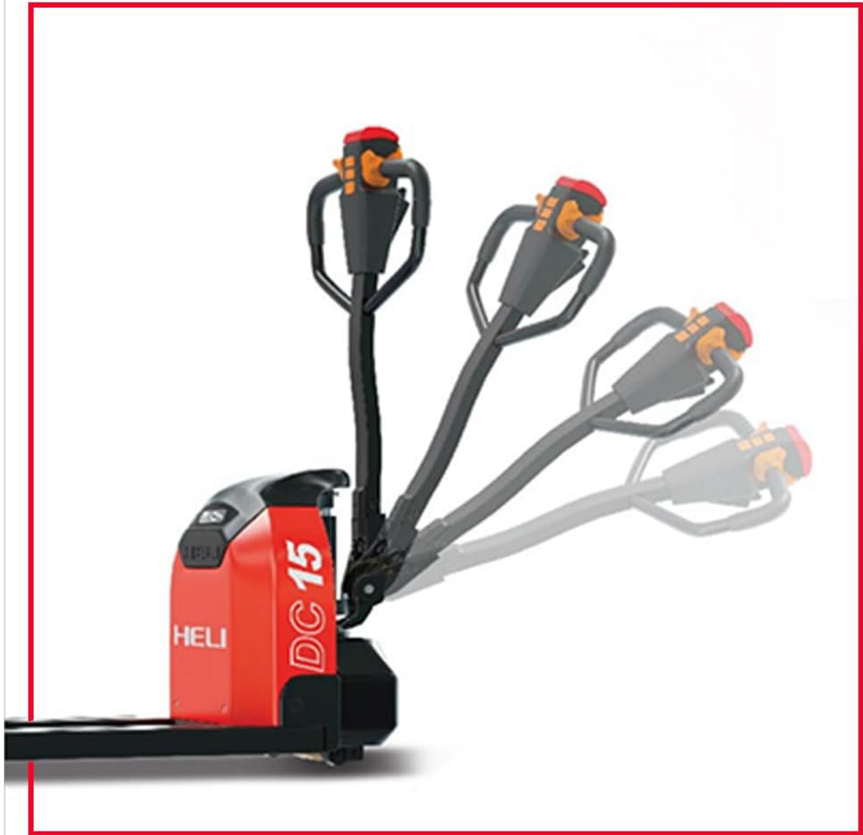
Figure 5: Dynamic view of the pallet jack's handle movement. This image illustrates the range of motion of the control handle, indicating its flexibility for steering and maneuvering in various directions.