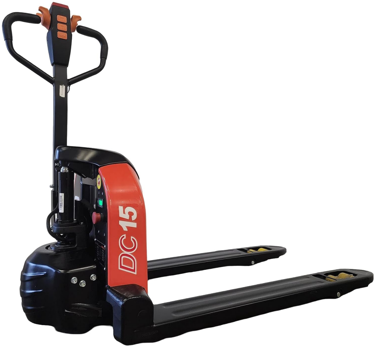
Figure 1: HELI Electric Pallet Jack CBD15B-LiH. This image shows the overall design of the electric pallet jack, featuring its red and black body, control handle, and forks.