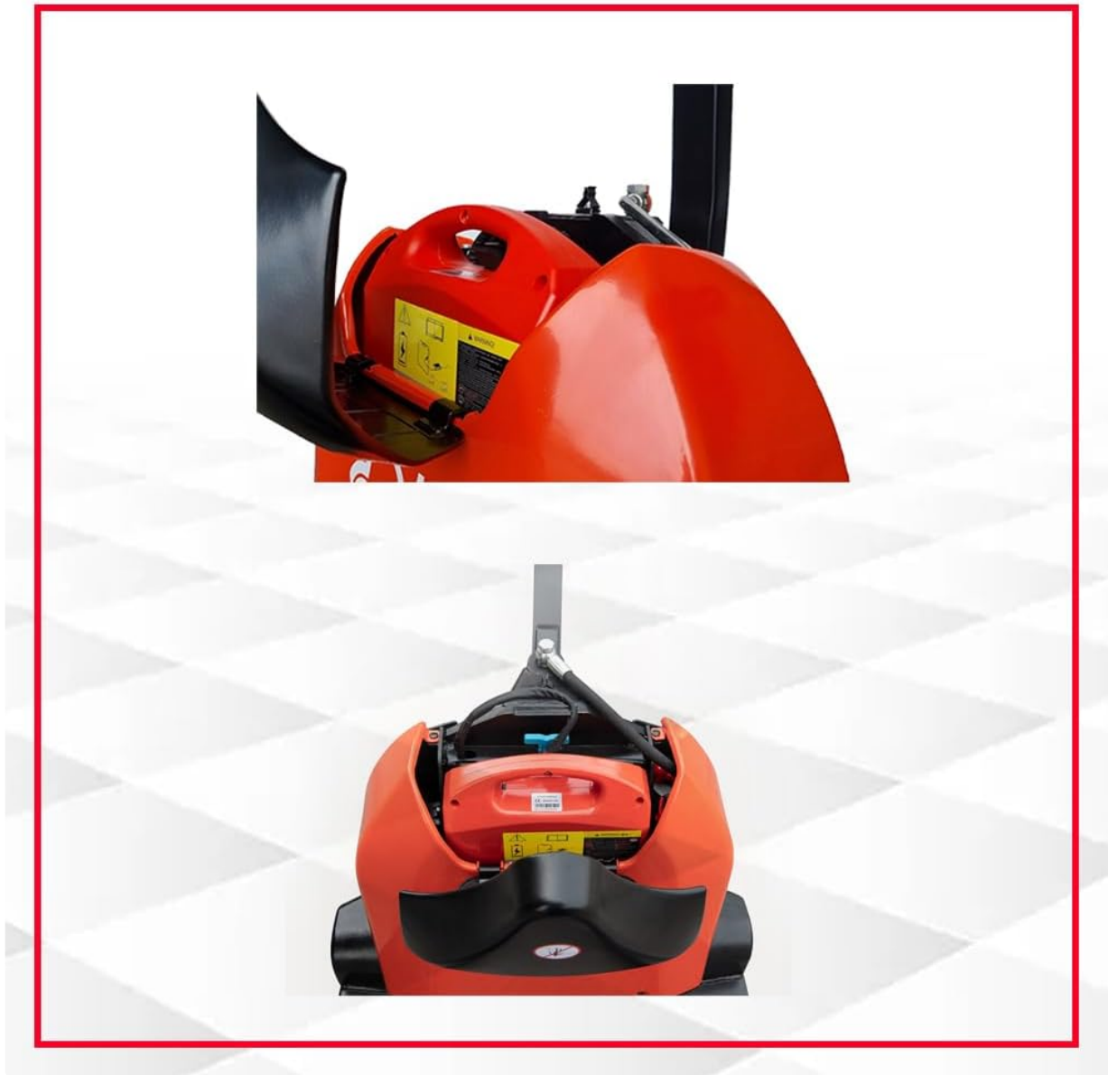
Figure 4: View of the lithium battery compartment. This image shows the top cover opened, revealing the removable lithium battery pack, emphasizing its portability and ease of access.