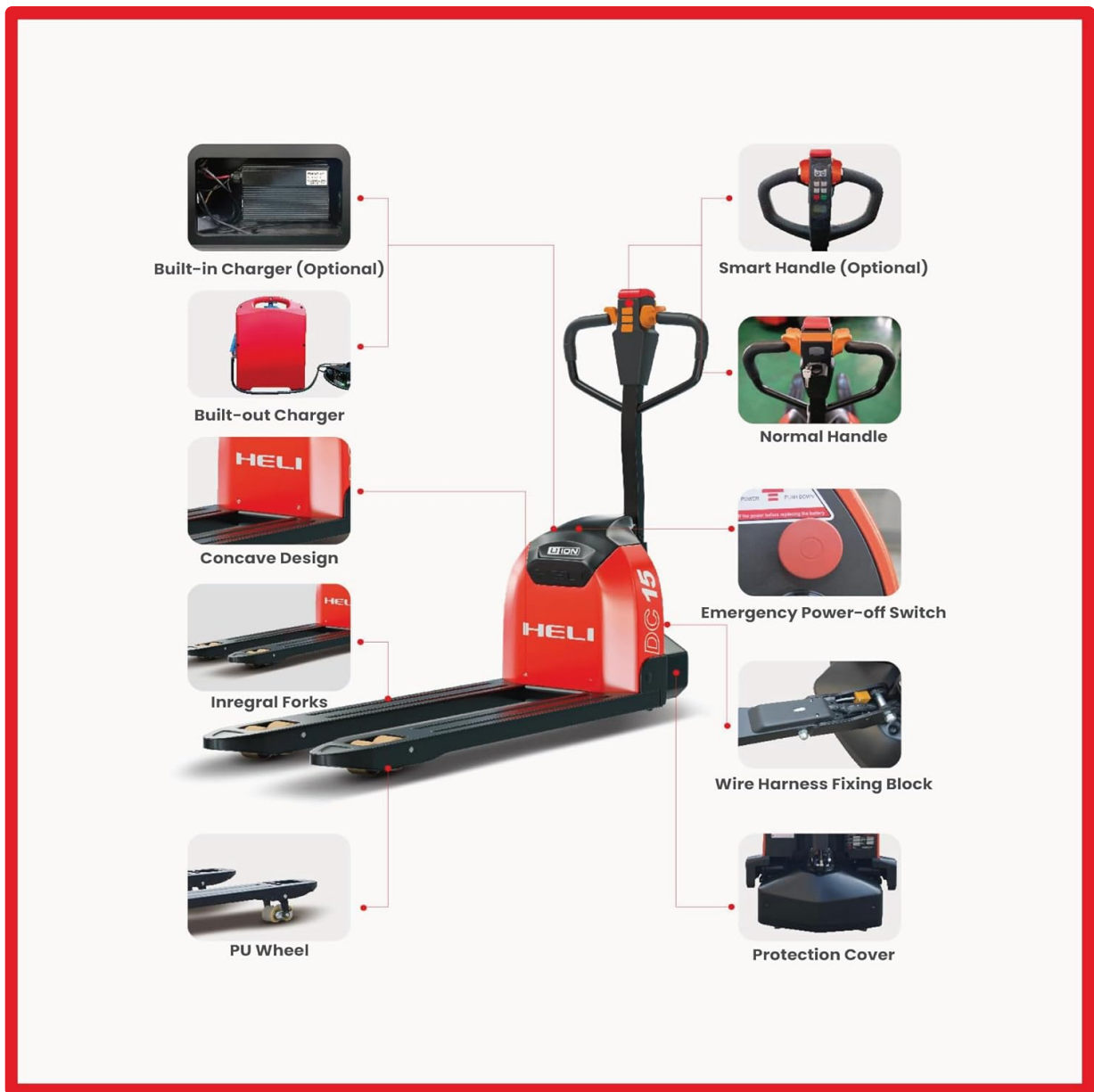
Figure 3: Diagram illustrating key components of the electric pallet jack. This image shows various parts such as the built-in charger (optional), smart handle (optional), normal handle, emergency power-off switch, concave design, integral forks, PU wheel, and protection cover.