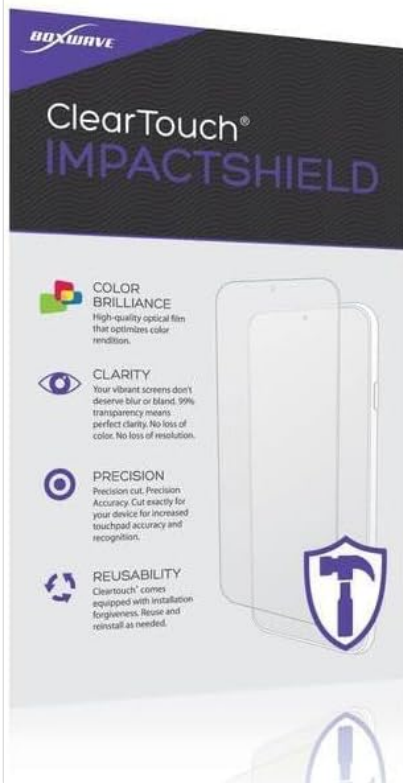
Image: The BoxWave ClearTouch ImpactShield screen protector, showing the packaging and the protector itself.