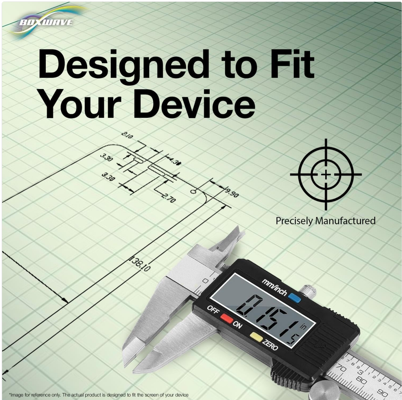
Image: A diagram illustrating the precise manufacturing of the screen protector to fit the device, emphasizing accurate dimensions and cutouts.