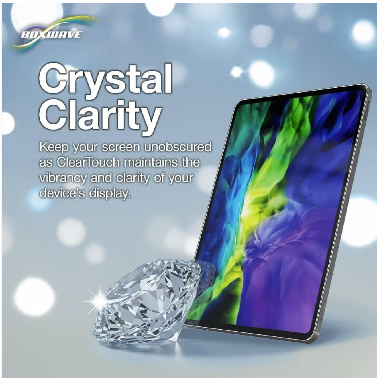
Image: A visual representation of the screen protector's crystal clarity, with a diamond reflecting light on a vibrant screen.