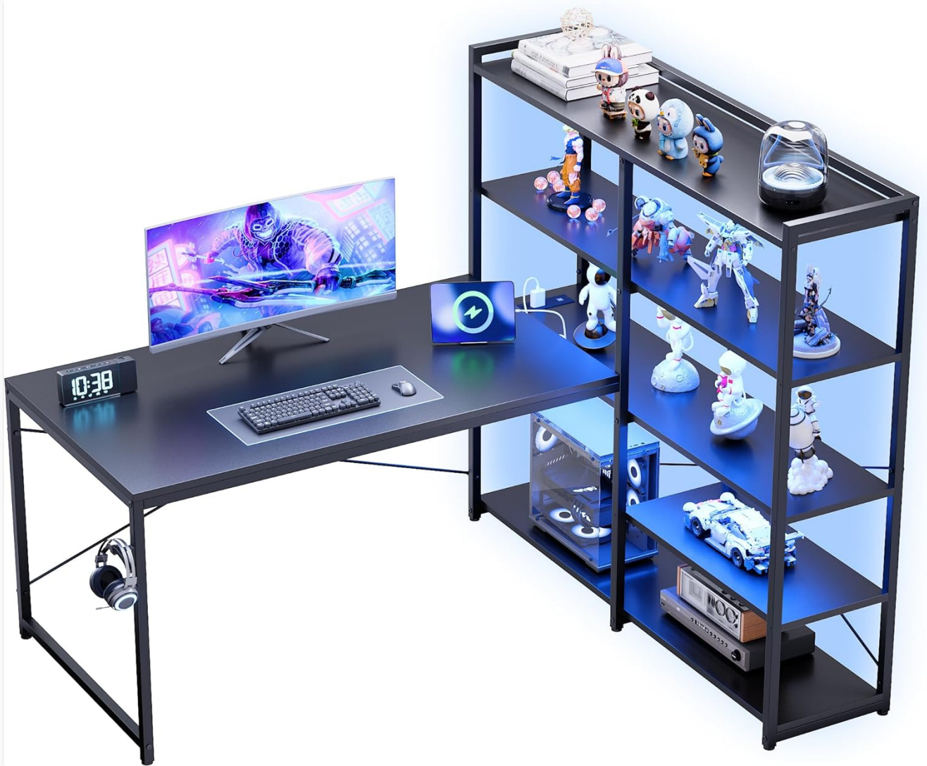
Image: The assembled desk frame showing the X-shaped back braces for enhanced stability.