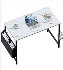
Image: Water droplets on the desk surface, illustrating its resistance to minor liquid spills.