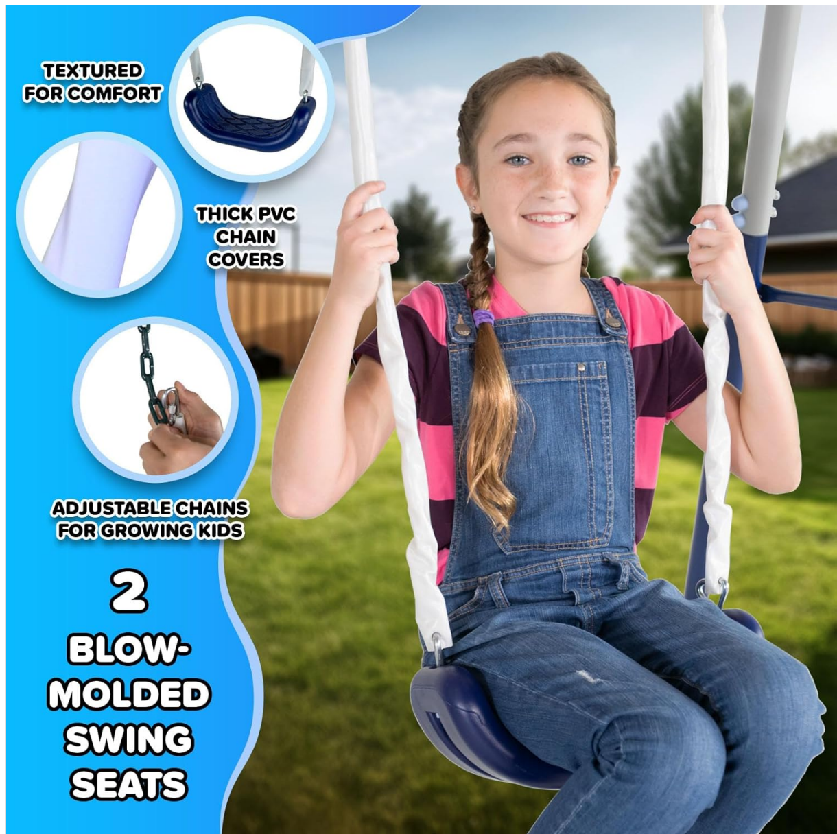
Image: A child enjoying a swing, with close-ups illustrating the comfortable textured seat, protective PVC chain covers, and adjustable chain mechanism.