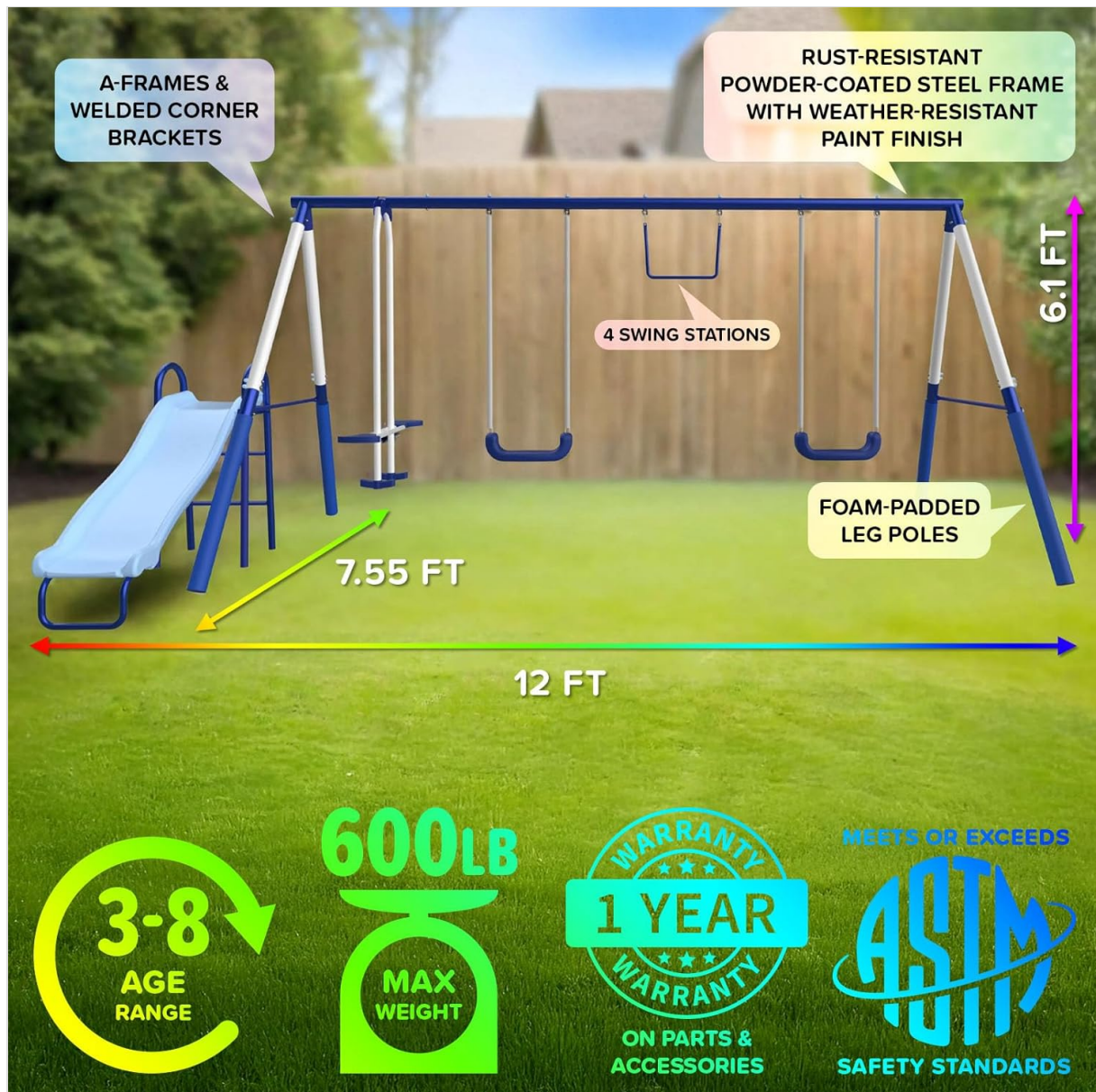
Image: Illustration of the swing set's A-frame structure, highlighting its rust-resistant and powder-coated finish for enhanced durability.

The swing set is crafted from 2-inch heavy-duty weather-resistant steel tubes with welded joints and an A-Frame design for strength and stability. The frame is powder-coated for durability.