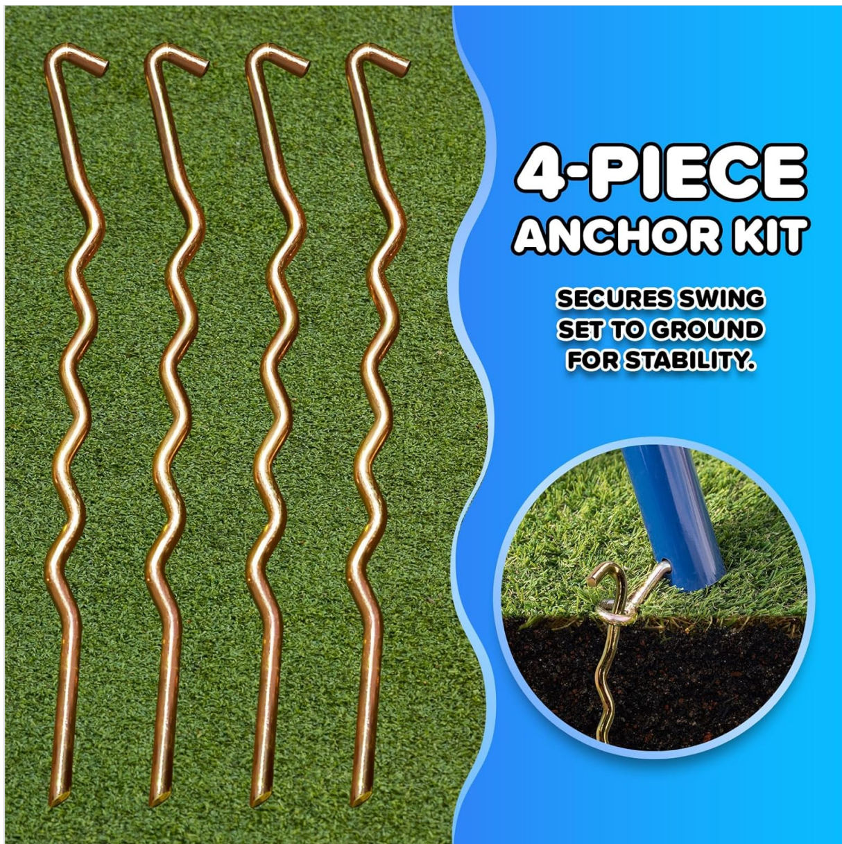
Image: The 4-piece anchor kit, consisting of wavy metal stakes, designed to secure the swing set firmly to the ground.