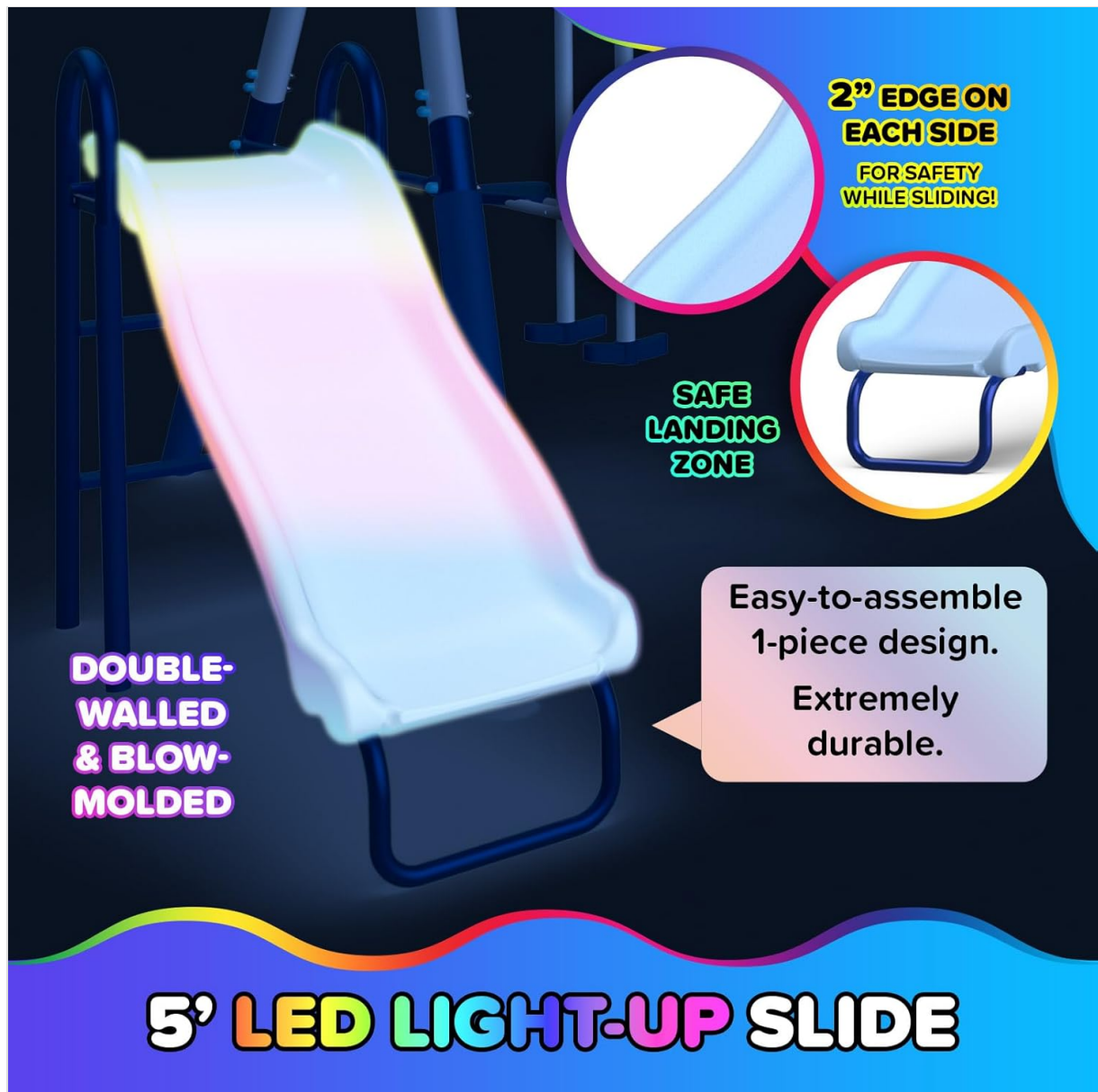
Image: Detailed view of the 5-foot LED light-up slide, emphasizing its robust double-walled, blow-molded construction and safe landing area.