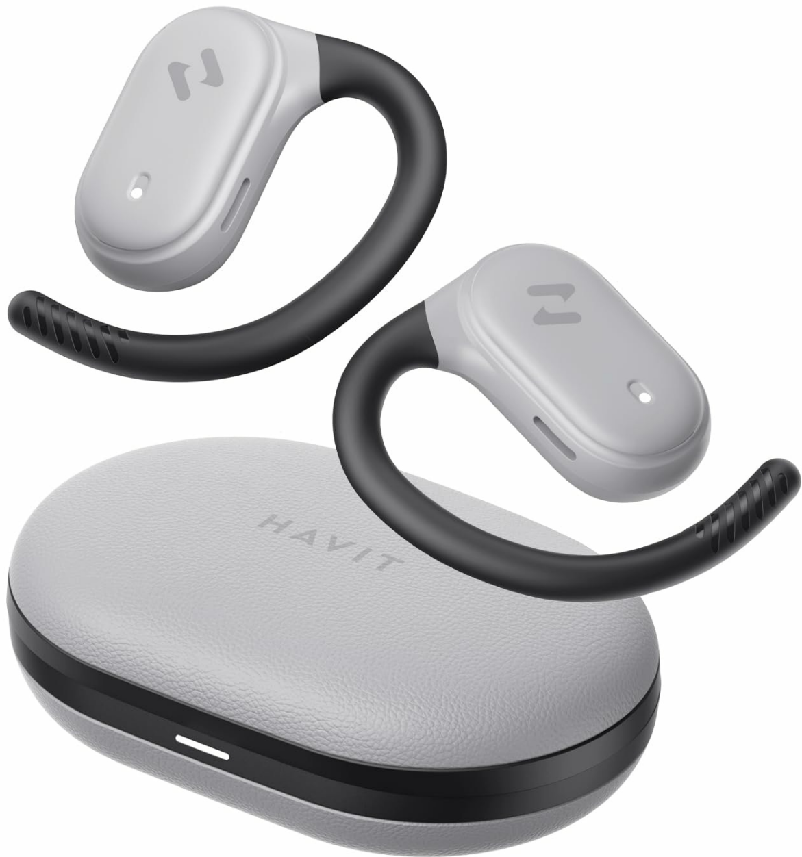
Image: havit OWS915 Open Ear Headphones and their charging case, showcasing the product's design.