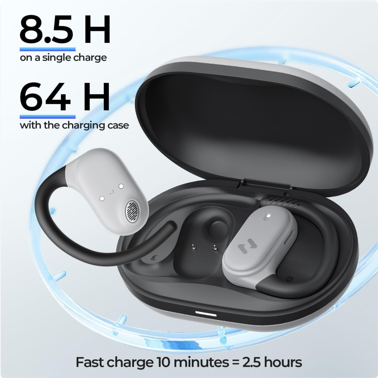
Image: The havit OWS915 headphones in their charging case, highlighting the 8.5 hours of playtime per charge and 64 hours total with the case.