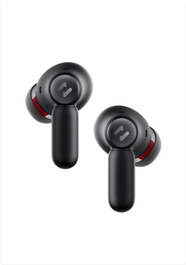
Image: A visual guide detailing the various touch control functions on the havit OWS915 earbuds.