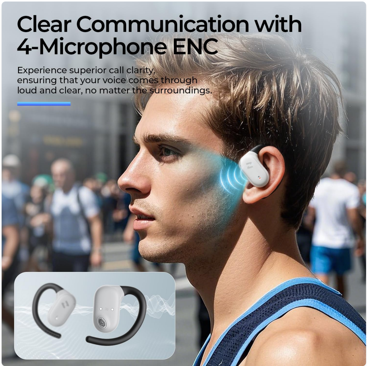
Image: A visual representation of the directional audio technology, showing sound waves directed towards the ear with minimal leakage.

Experience superior call clarity, ensuring that your voice comes through loud and clear, no matter the surroundings.