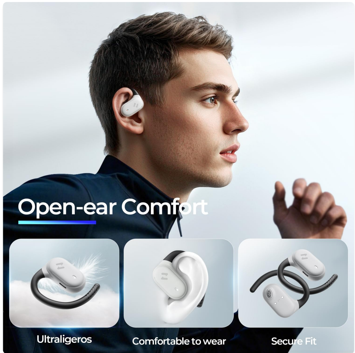
Image: A person wearing the havit OWS915 headphones, illustrating the comfortable and secure open-ear design.