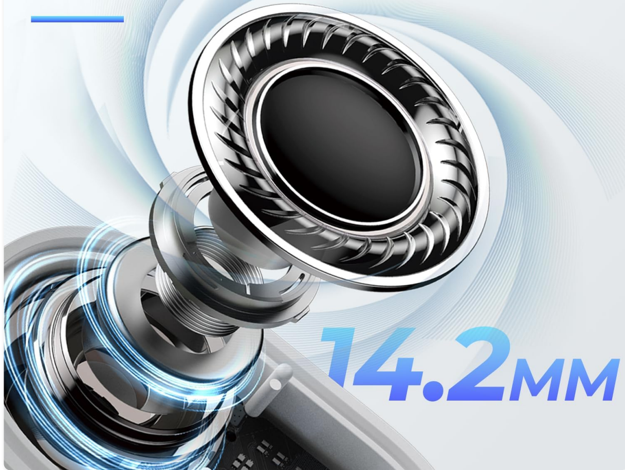
Image: An illustration of the 14.2mm dynamic drivers, highlighting their role in delivering powerful bass.