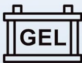
Gel USA Battery