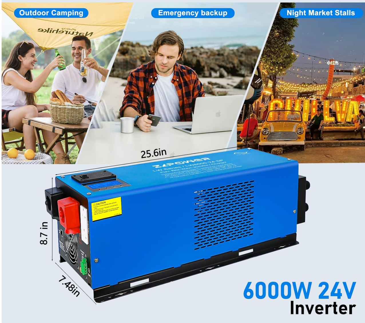
Figure 2: Product dimensions of the ZLPOWER LW 6000W-24V Inverter.