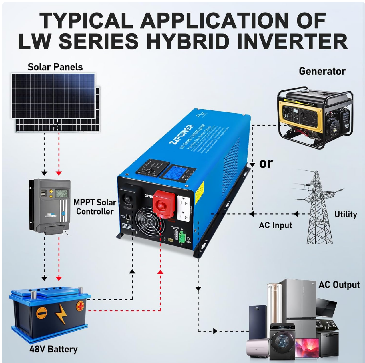
Figure 3: Diagram illustrating a typical application setup, including battery connection.

The ZLPOWER LW 6000W-24V Inverter Charger requires a 24V DC battery system. Ensure you use appropriate gauge cables for the power rating. Connect the positive (red) cable to the inverter's positive terminal and the battery's positive terminal. Connect the negative (black) cable to the inverter's negative terminal and the battery's negative terminal. Always ensure correct polarity to prevent damage to the inverter and batteries.