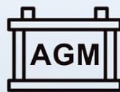
AGM 1 Battery