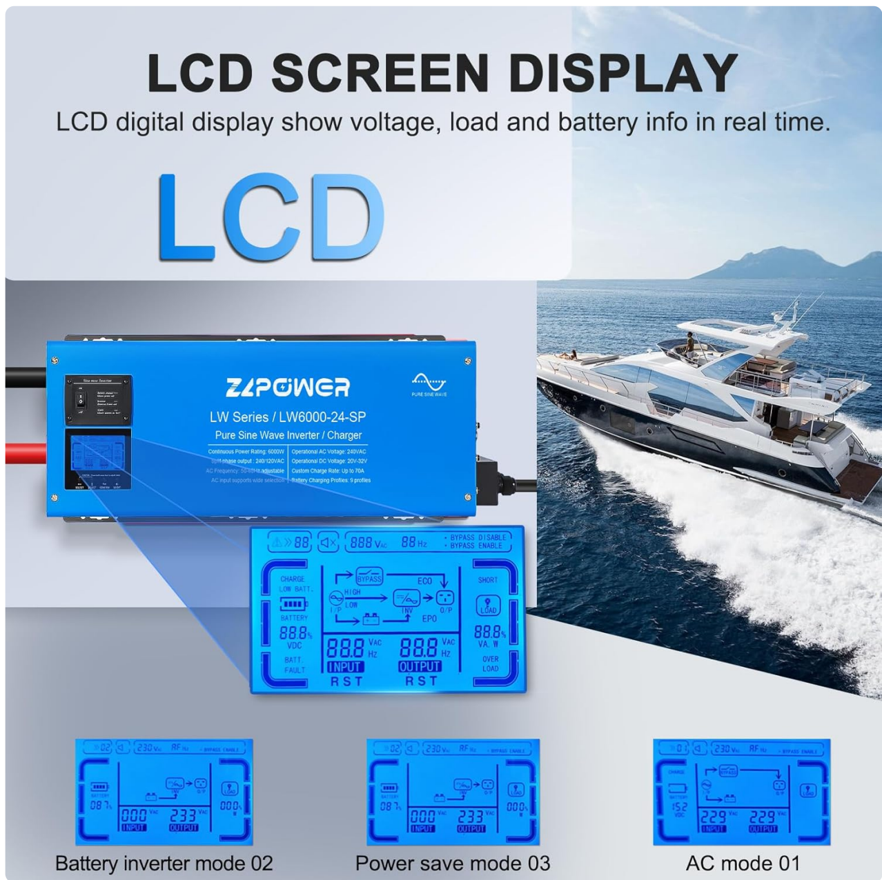
Figure 4: Detailed view of the LCD screen display and control buttons.

The inverter features an LCD display that shows real-time information about voltage, load, and battery status. Use the navigation buttons (ESC, Up, Down, Enter/Menu) to navigate through settings and monitor parameters.