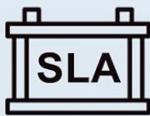
Sealed Lead Acid Battery