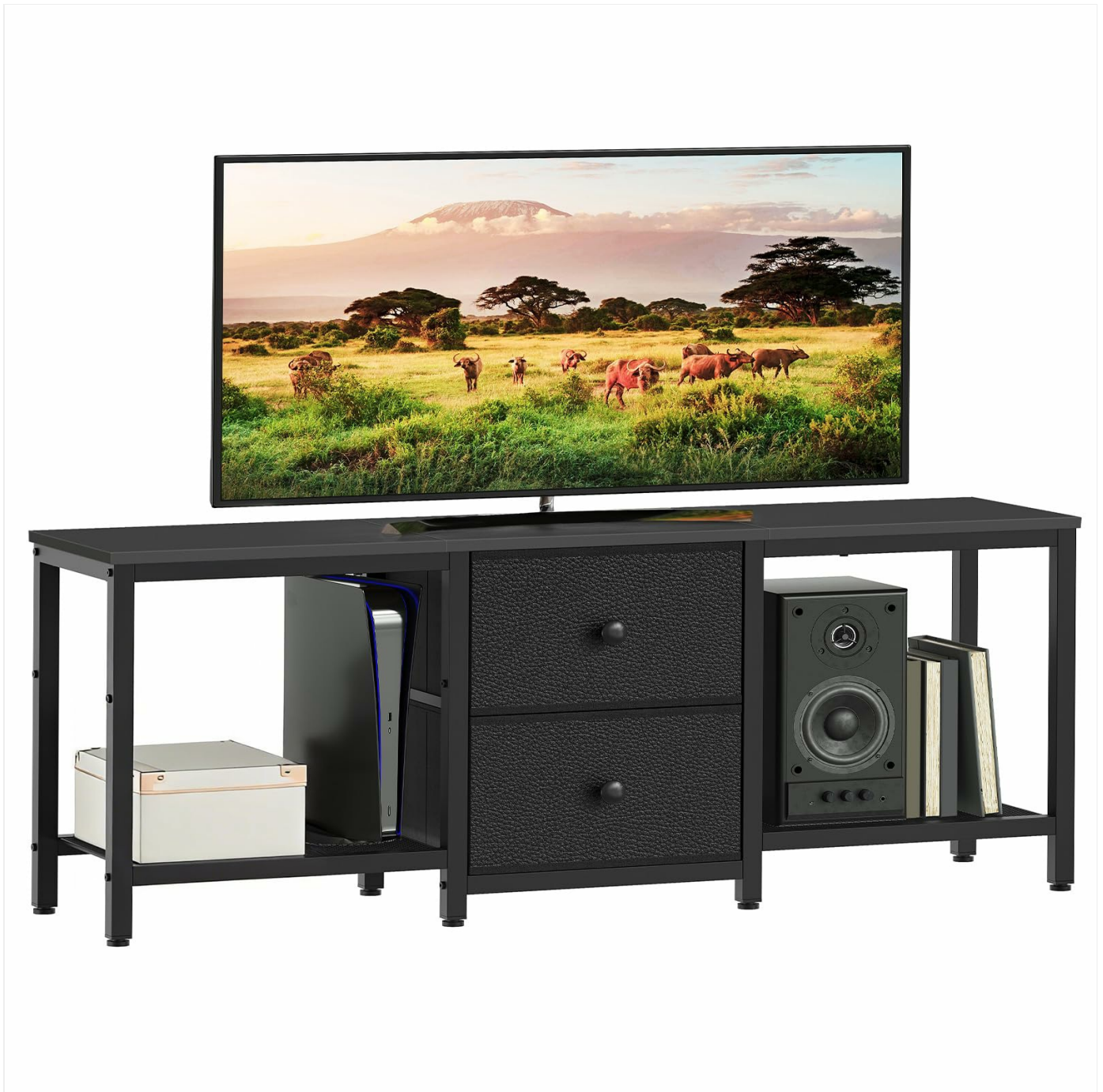
Image: Fully assembled YATINEY TV Stand Model DS02BB in a living room, showcasing its design and storage capabilities.