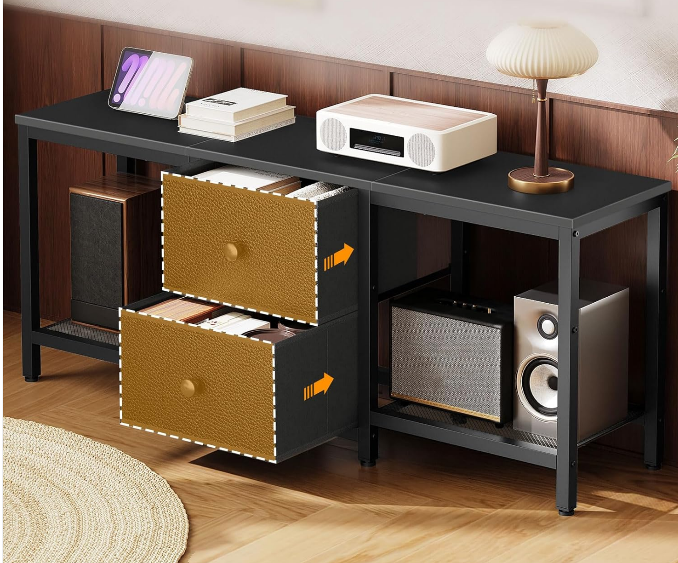
Image: Detailed view of the dual fabric drawers, illustrating their capacity for storing various items.

Provide room for magazines, remotes and more.