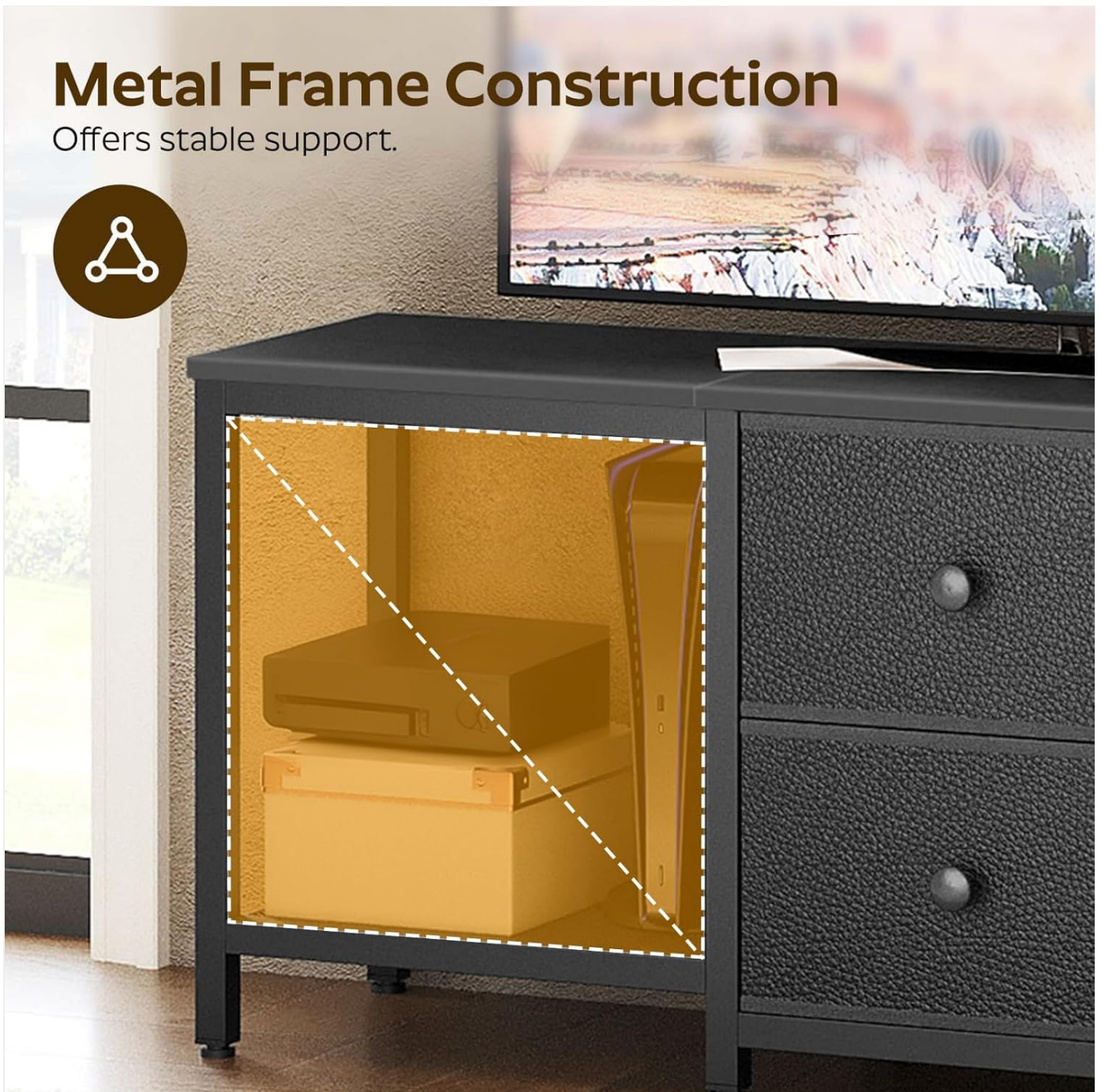
Image: Detail of the metal frame construction, highlighting the stable support structure for media devices.