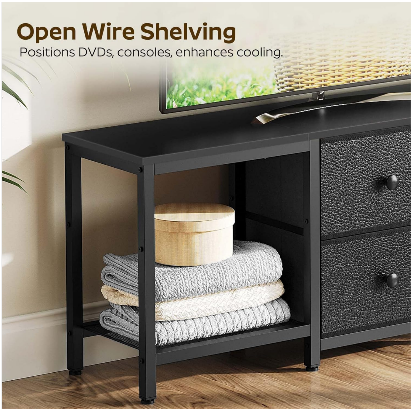
Image: The open wire shelving section, demonstrating its use for storing folded blankets and other items, also suitable for media devices.

Positions DVDs, consoles, enhances cooling.