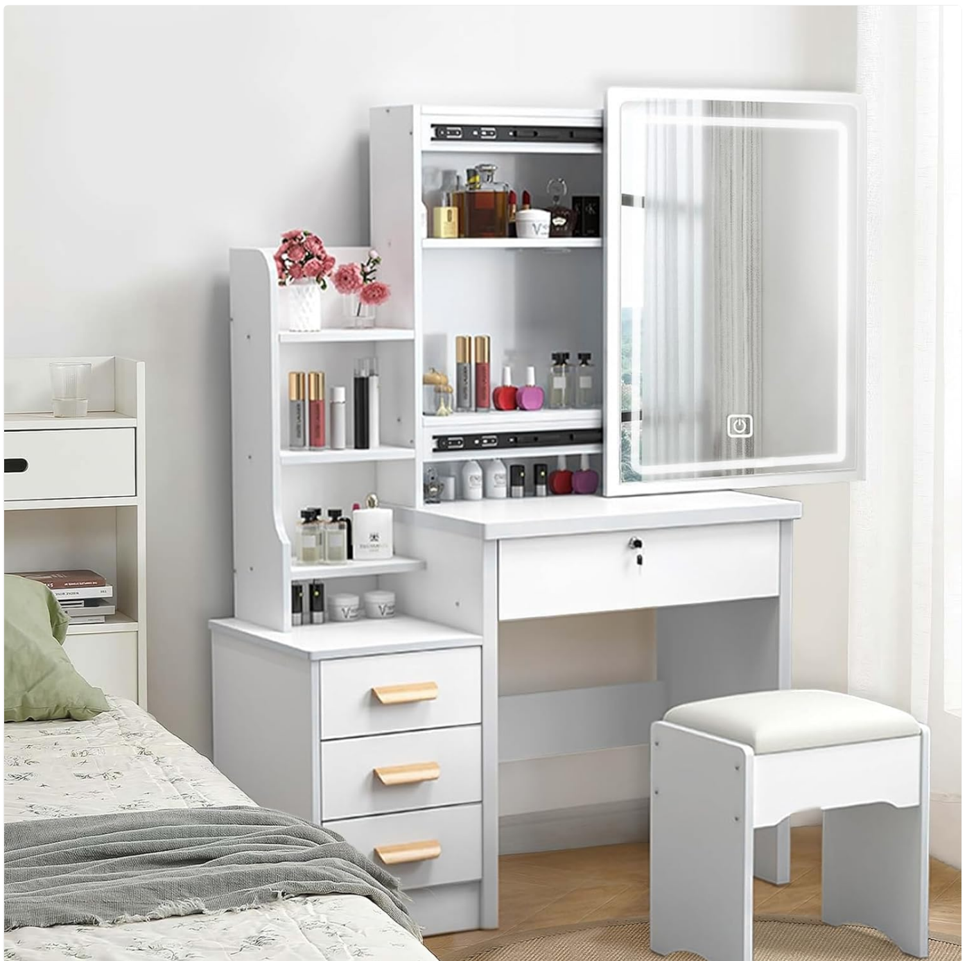
Figure 1: Complete WIIS' IDEA Vanity Dressing Table setup.