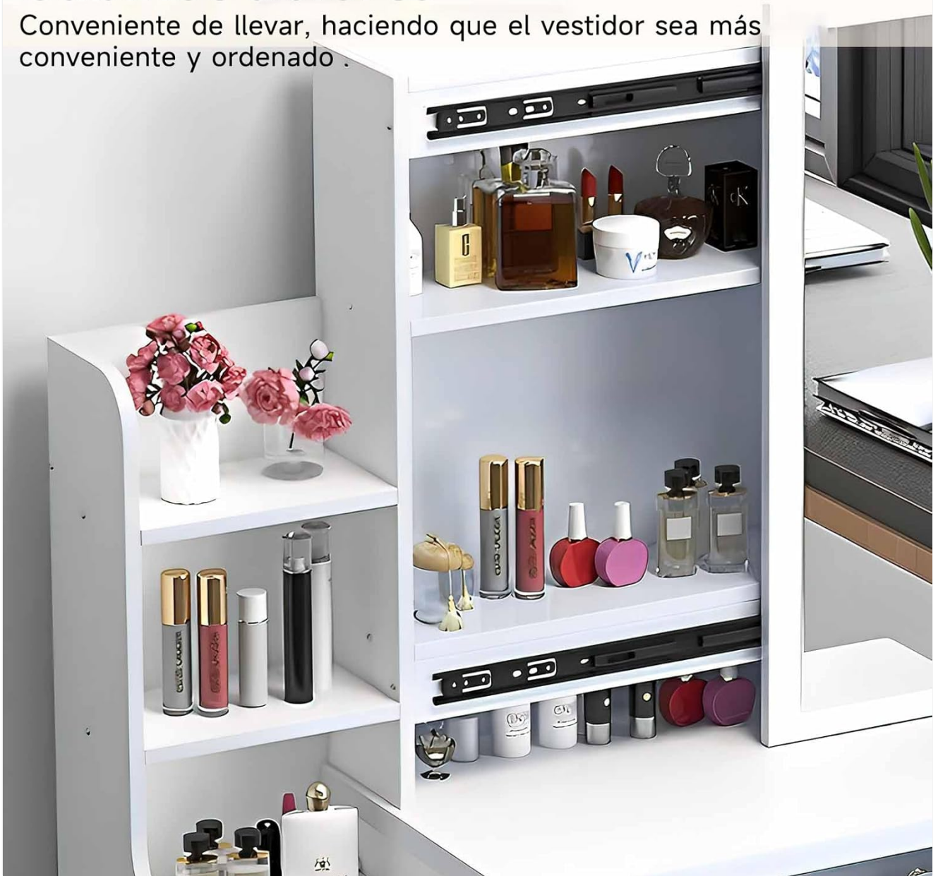
Figure 3: View of the open storage shelves and cabinet.

Conveniente de llevar, haciendo que el vestidor sea más conveniente y ordenado.