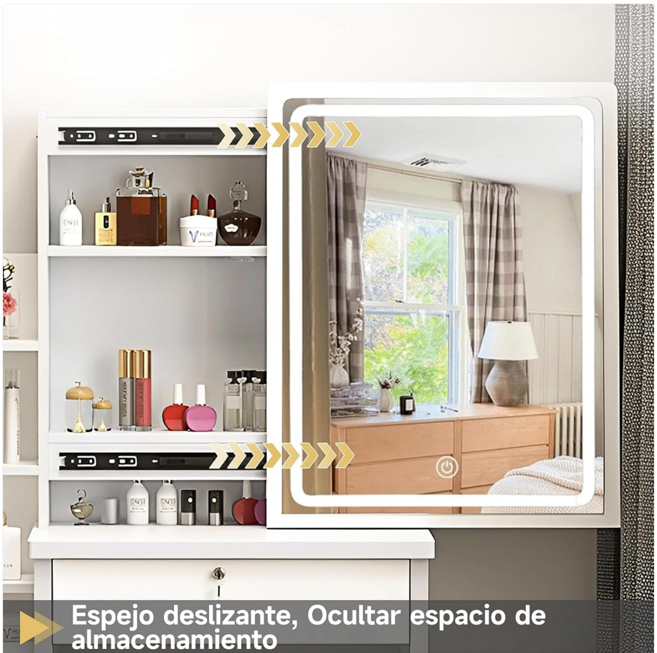
Figure 4: The sliding mirror mechanism, showing hidden storage behind.