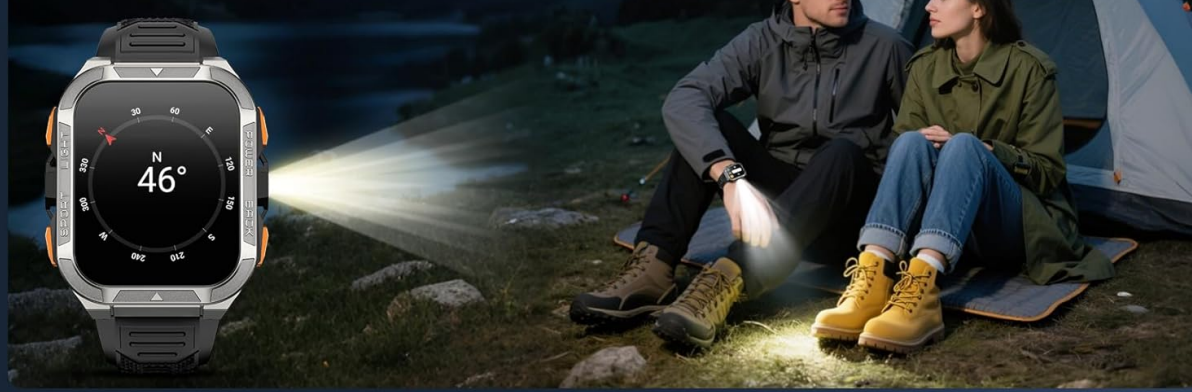
Image: The Blackview W80pro Smartwatch, showcasing its sleek design and vibrant display.

Vous oriente dans la bonne direction tout le temps.