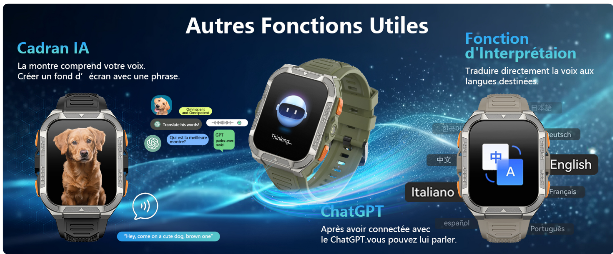
Image: The Blackview W80pro Smartwatch displaying a variety of customizable watch faces, including options to use personal photos and AI-generated designs.