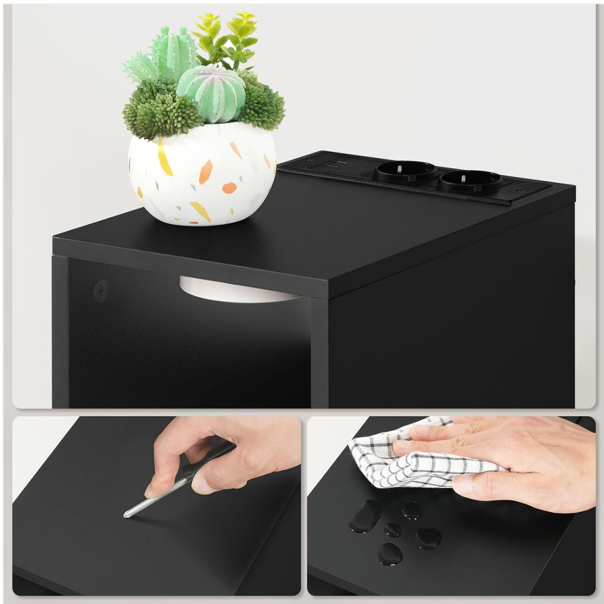
Image: A detailed view of the charging station on the MAHANCRISE ETBK25E01 End Table, featuring two standard power outlets and two USB ports for convenient device charging.