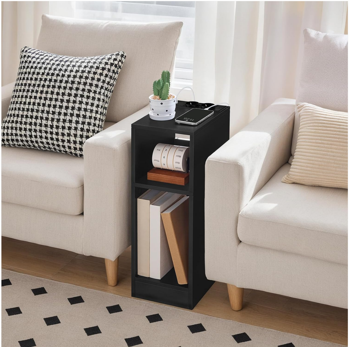
Image: The MAHANCRISE ETBK25E01 End Table positioned between two armchairs in a living room, showcasing its compact design and integrated charging capabilities with a smartphone on top.