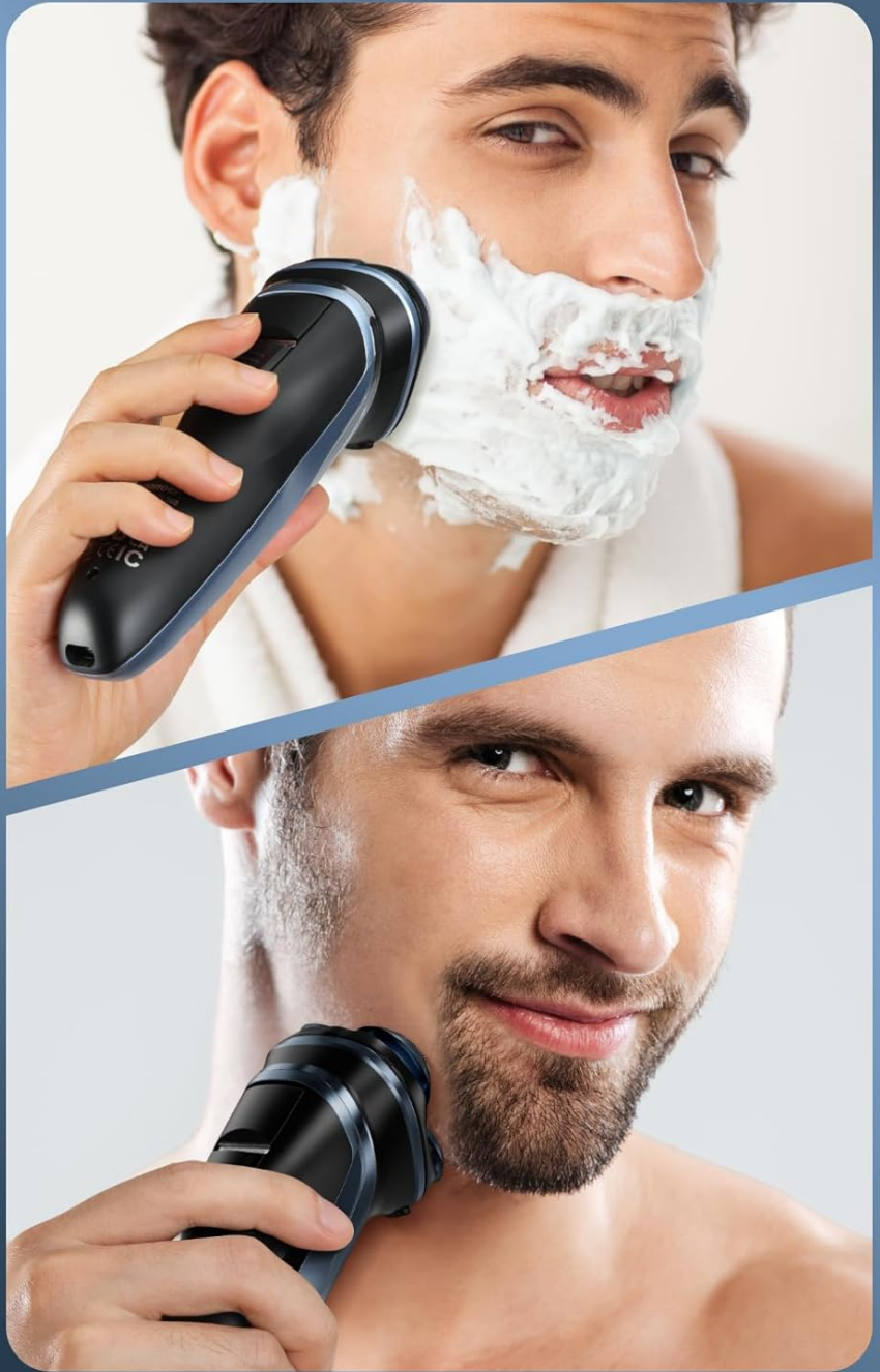
Image: Demonstrates the versatility of the GDKLXL electric razor for both wet shaving with foam and dry shaving.