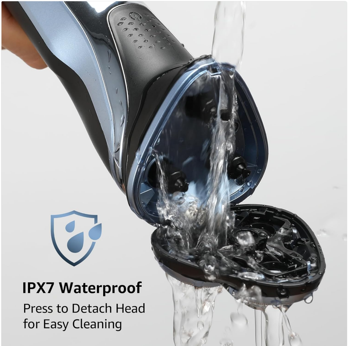
Image: The electric razor being cleaned under running water, highlighting its IPX7 waterproof design and detachable head for easy maintenance.