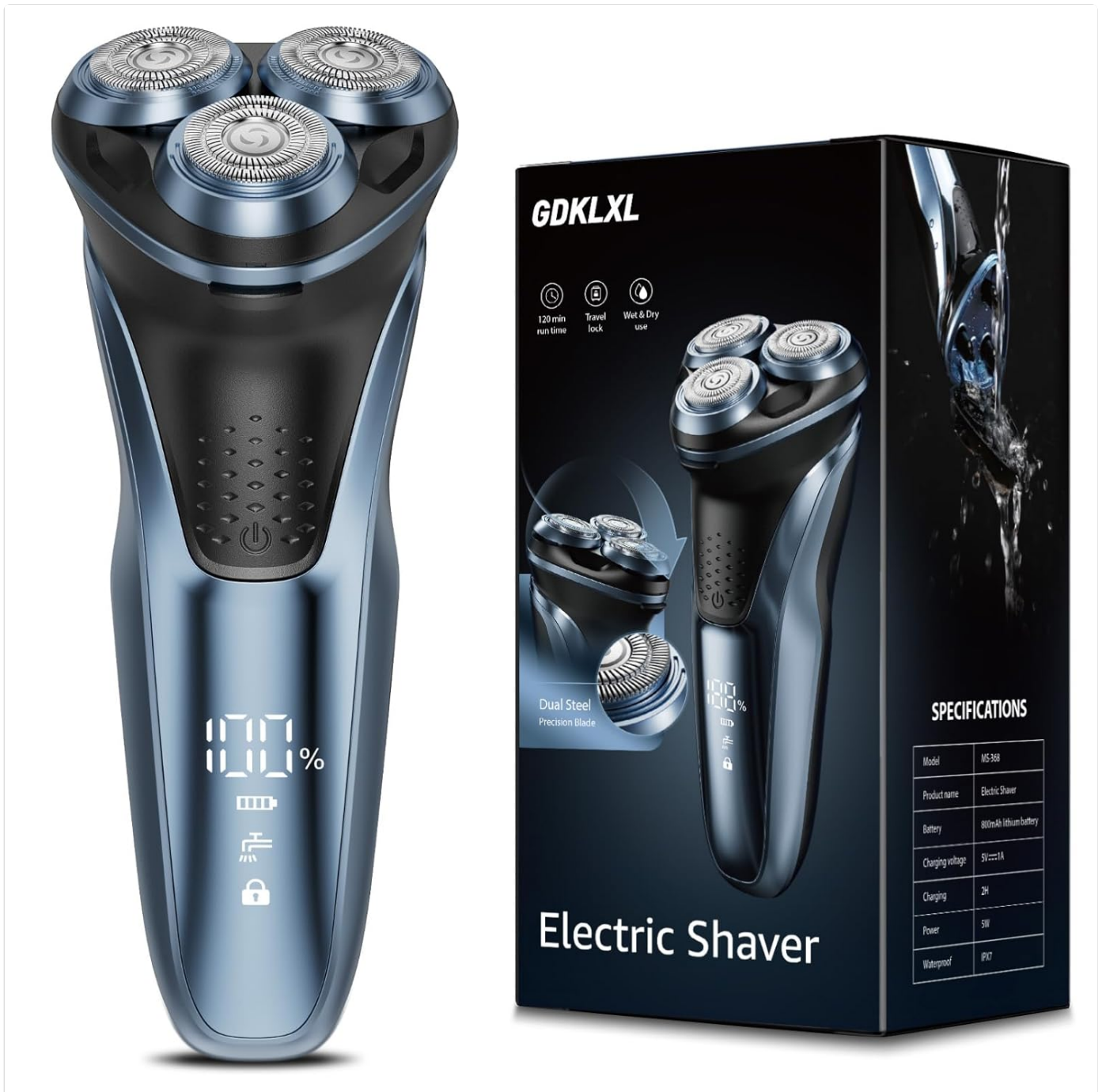
Image: The GDKLXL Rechargeable Electric Razor, showcasing its sleek design and accompanying retail packaging.