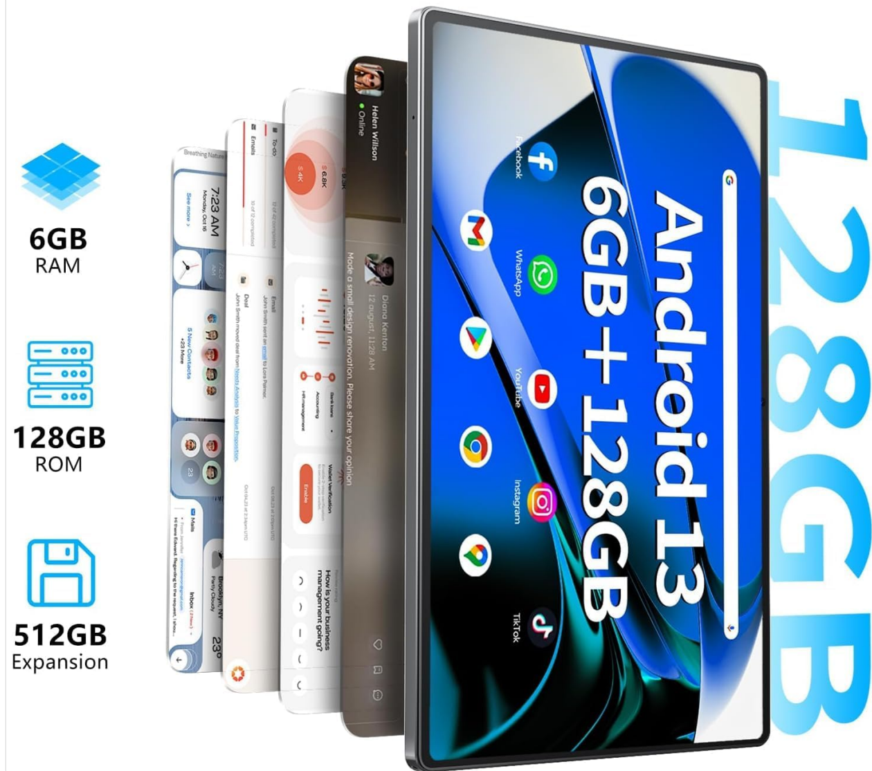
Image: Visual representation of the tablet's memory specifications, highlighting 6GB RAM, 128GB ROM, and support for up to 512GB external storage expansion.