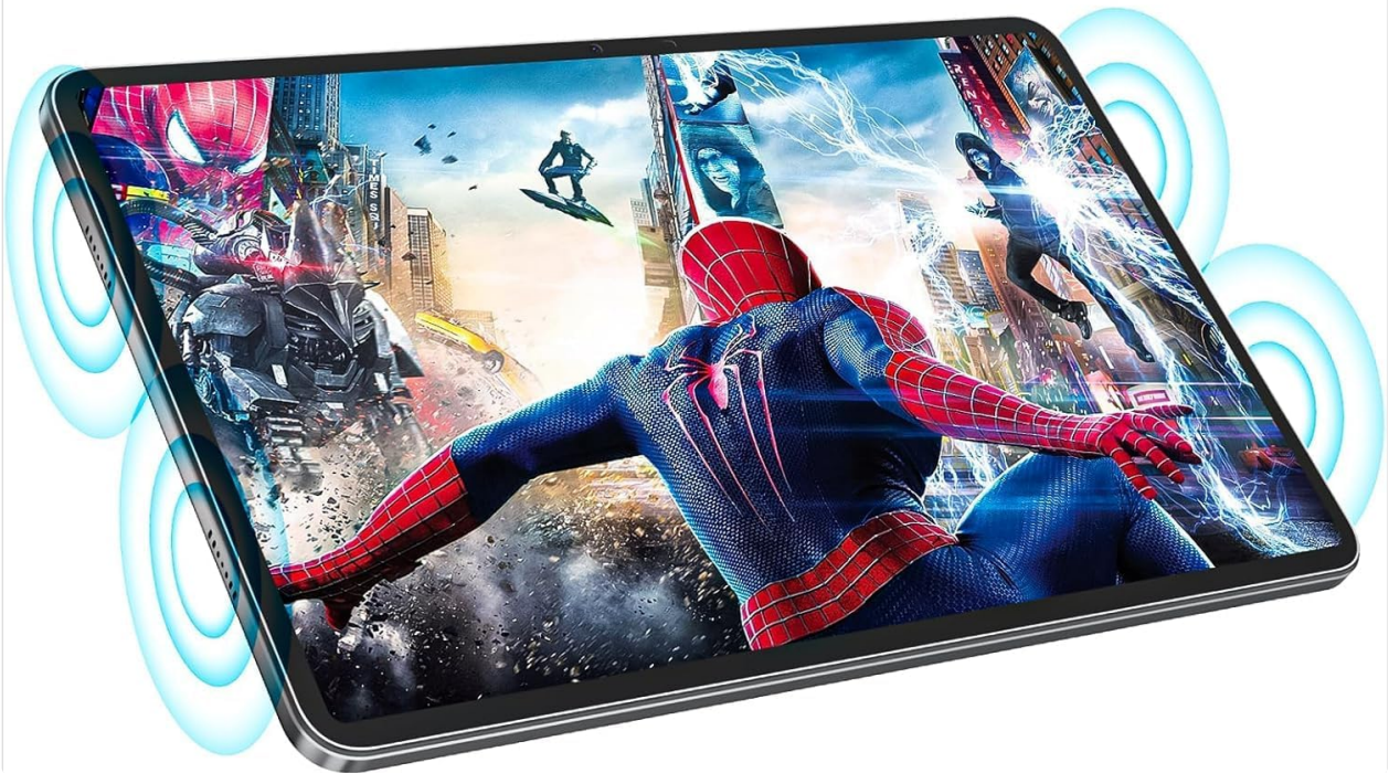
Image: The SGIN-T12 tablet illustrating its four-speaker stereo system for an immersive audio experience.

Four speakers Clear and loud sound quality