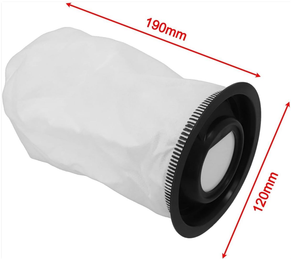
Image: A single microfiber dust bag, showing approximate dimensions of 190mm length and 120mm diameter at the collar.