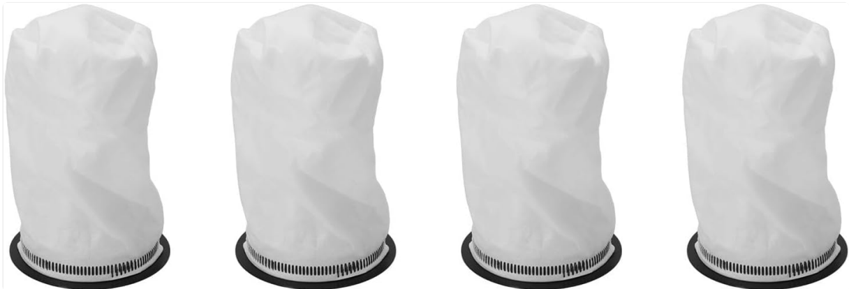
Image: Four microfiber dust bags, ready for use.

These microfiber dust bags are designed for use with Henry, Quick, and Numatic NQ100, Hen100, HET100 vacuum cleaners. Each bag features a three-layer filtration system to effectively capture 99.9% of dirt, pet dander, and other particles, contributing to improved indoor air quality. The innovative self-locking auto-seal collar prevents dust from escaping during disposal, ensuring a cleaner and safer environment. The design offers ample cleaning capacity while saving storage space and maintaining effective motor performance for your vacuum cleaner.