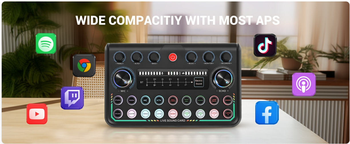
Image: The Audio Interface Mixer demonstrating compatibility with popular streaming platforms and devices like laptops, phones, and tablets.