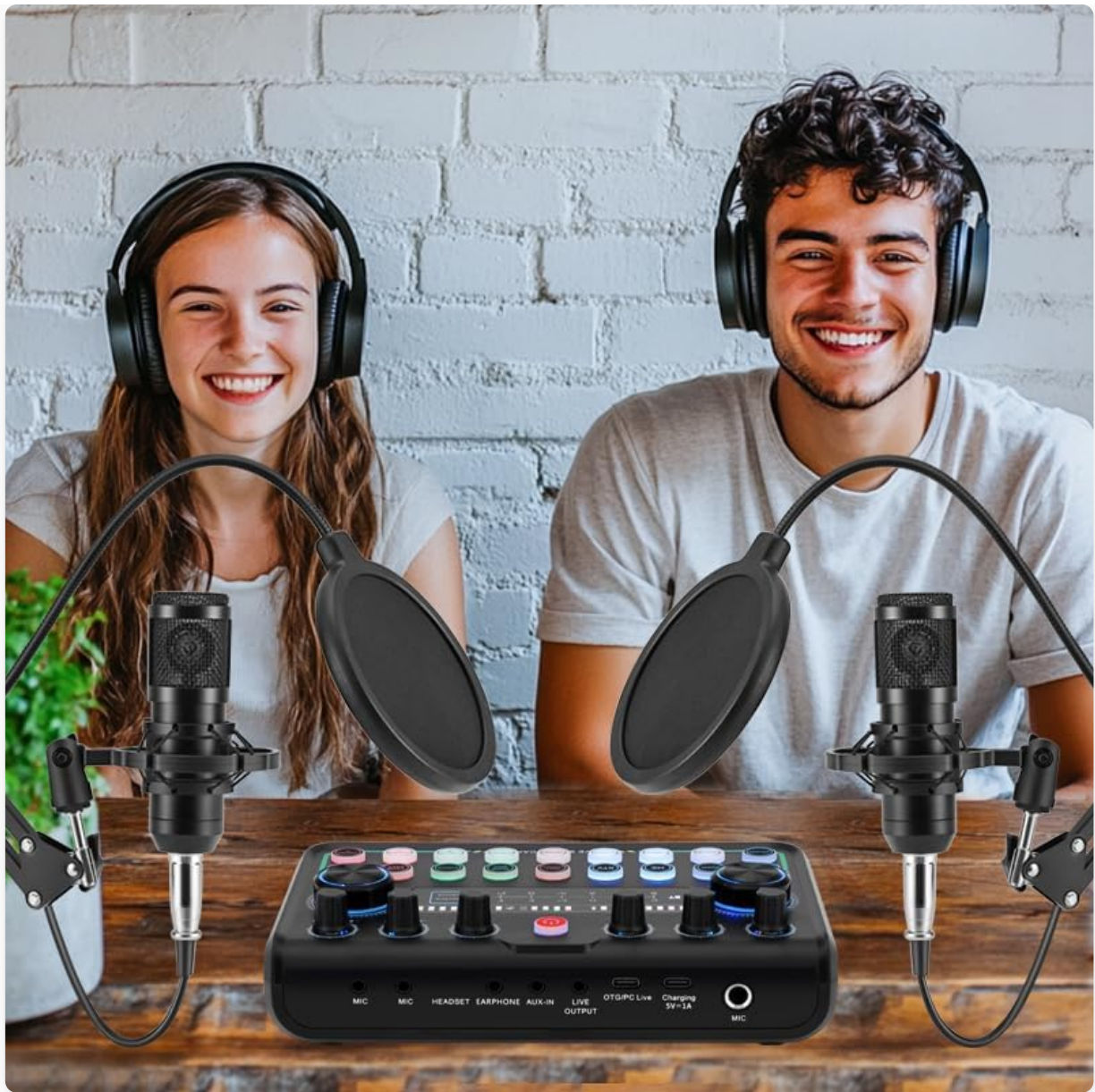
Image: The Zncles Podcast Equipment Bundle in use by two individuals, showcasing the mixer, microphones, and headphones for a dual-user setup.