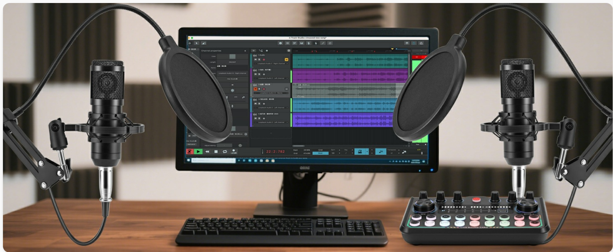
Image: A complete podcast setup featuring two microphones on boom arms, a central audio mixer, and headphones, ready for a dual-host broadcast.