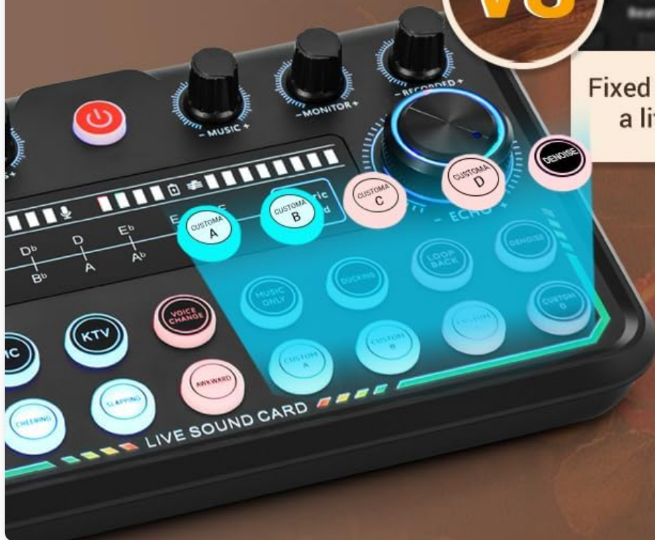
Image: Close-up of the Audio Interface Mixer highlighting the custom sound effects and denoise features.