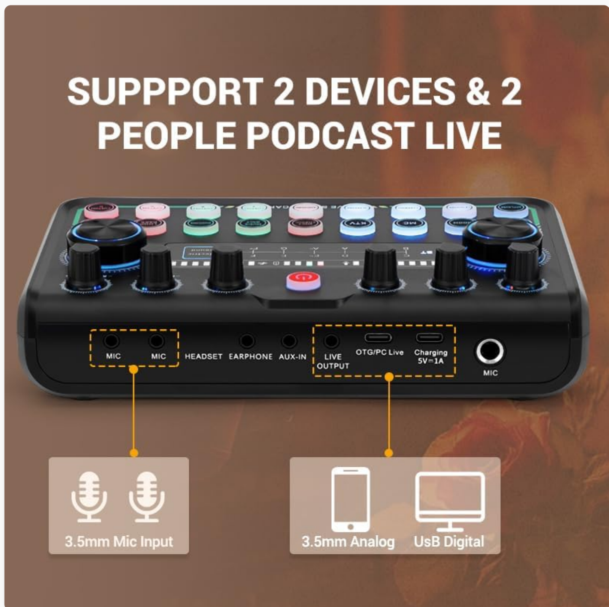
Image: Detailed view of the Audio Interface Mixer's ports, including microphone inputs, headset, monitor, accompaniment, live output, OTG/PC, and charging ports.