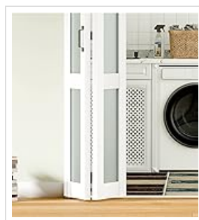
Figure 3: Key material features including MDF, waterproof properties, tempered glass, and load-bearing stability.

Assemble the door panels according to the included illustrated instructions. The MDF panels provide a solid core, and the tempered glass offers durability and light diffusion.