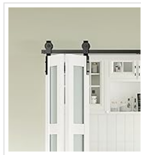
Figure 2: Overall dimensions and fitting requirements for the pocket door.

Accurately measure the rough opening of your door frame to ensure proper fit. Refer to the dimensions table below for guidance.