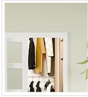
Figure 4: Details of the pocket door frame construction, emphasizing stability and material composition.