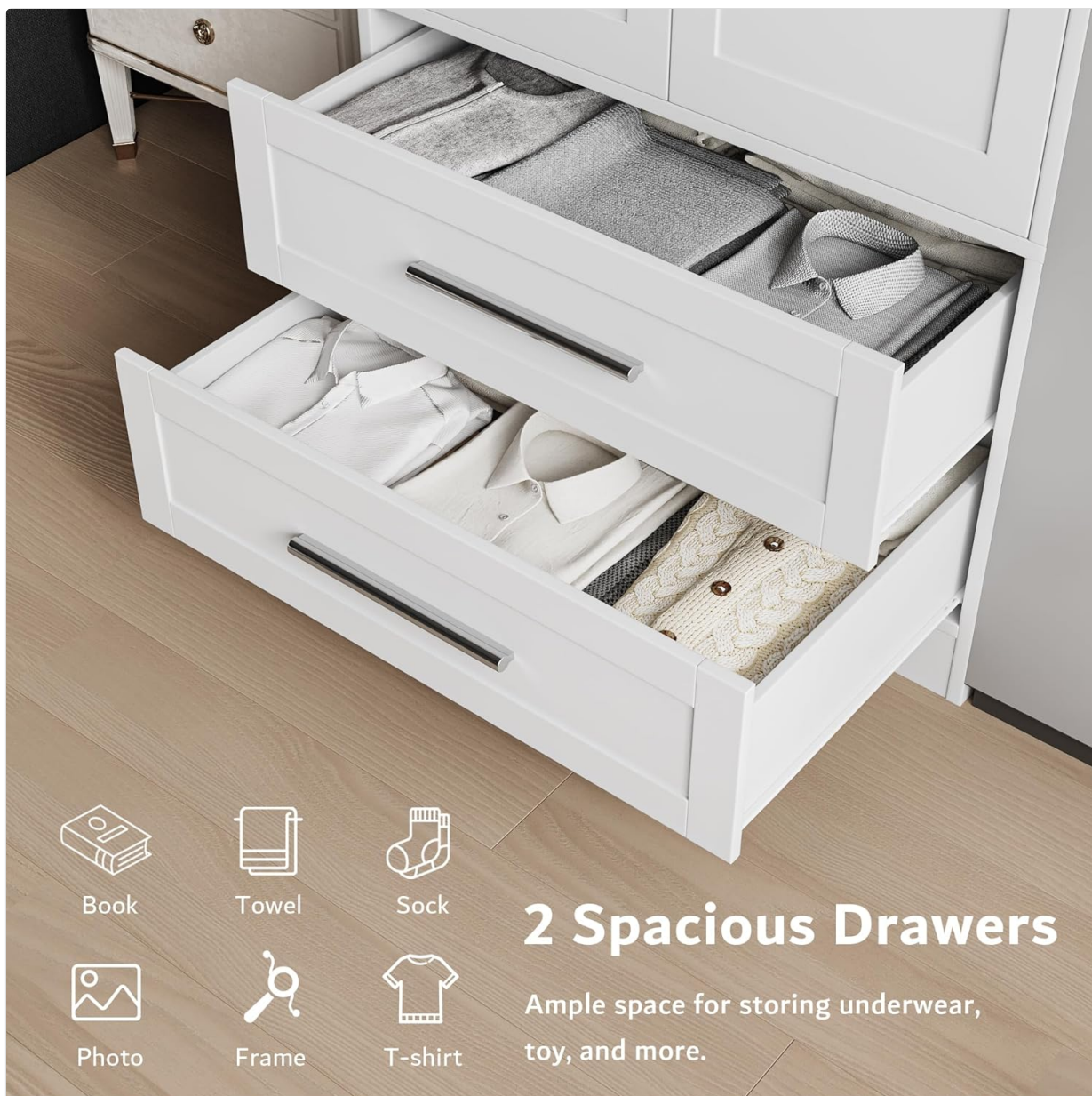
Image: Detailed view of the two spacious drawers, illustrating their capacity for folded garments and various small items. The drawers are designed for smooth gliding on metal tracks.

The white armoire is suitable for various settings including bedrooms, laundry rooms, cloakrooms, entryways, and offices, providing versatile storage solutions.