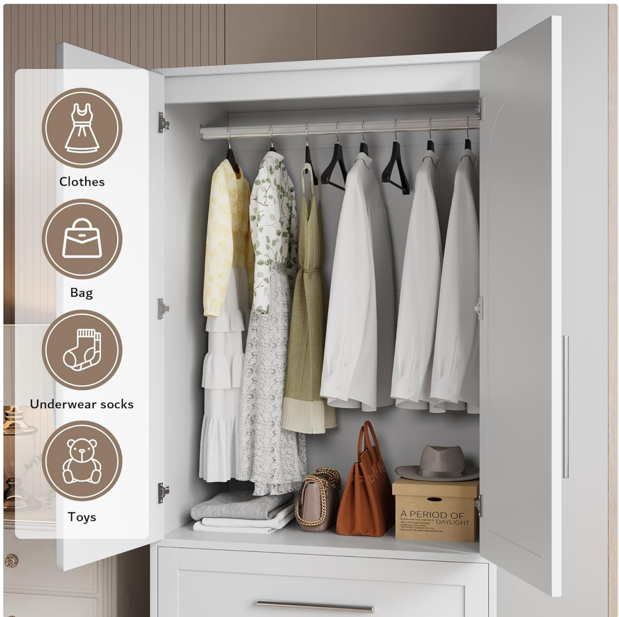
Image: Interior view of the armoire demonstrating its storage capabilities. The top section features a hanging rod for clothes, while the lower section includes shelves and drawers suitable for bags, socks, toys, and other personal items.