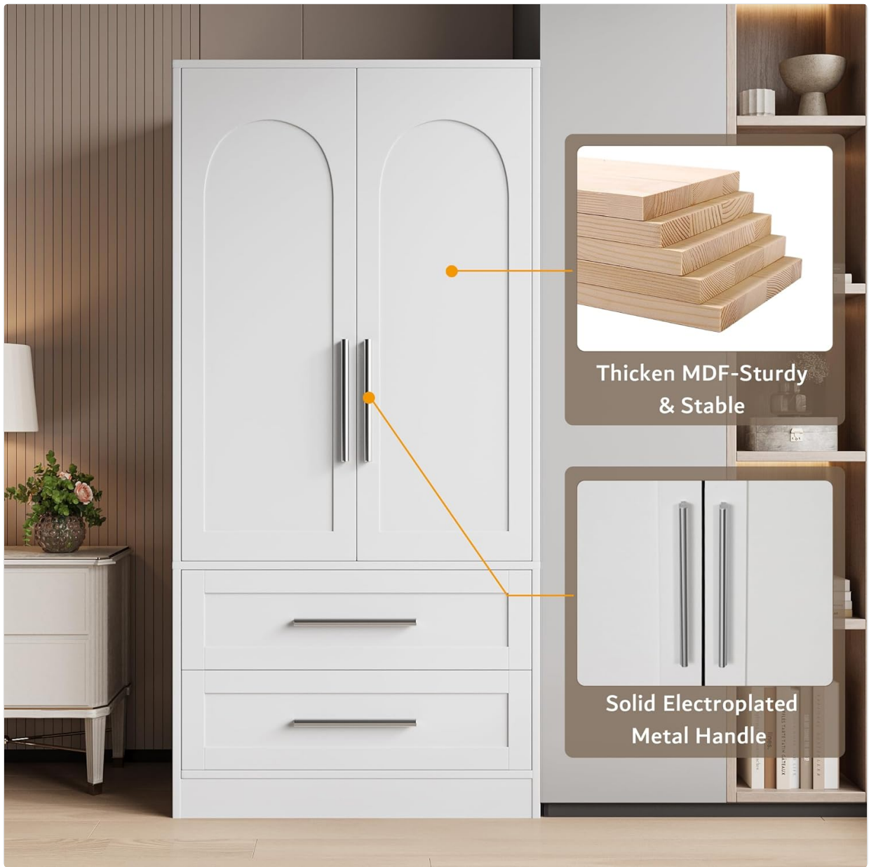
Image: Front view of the armoire, emphasizing its robust construction from thickened MDF for stability and the elegant, durable solid electroplated metal handles.