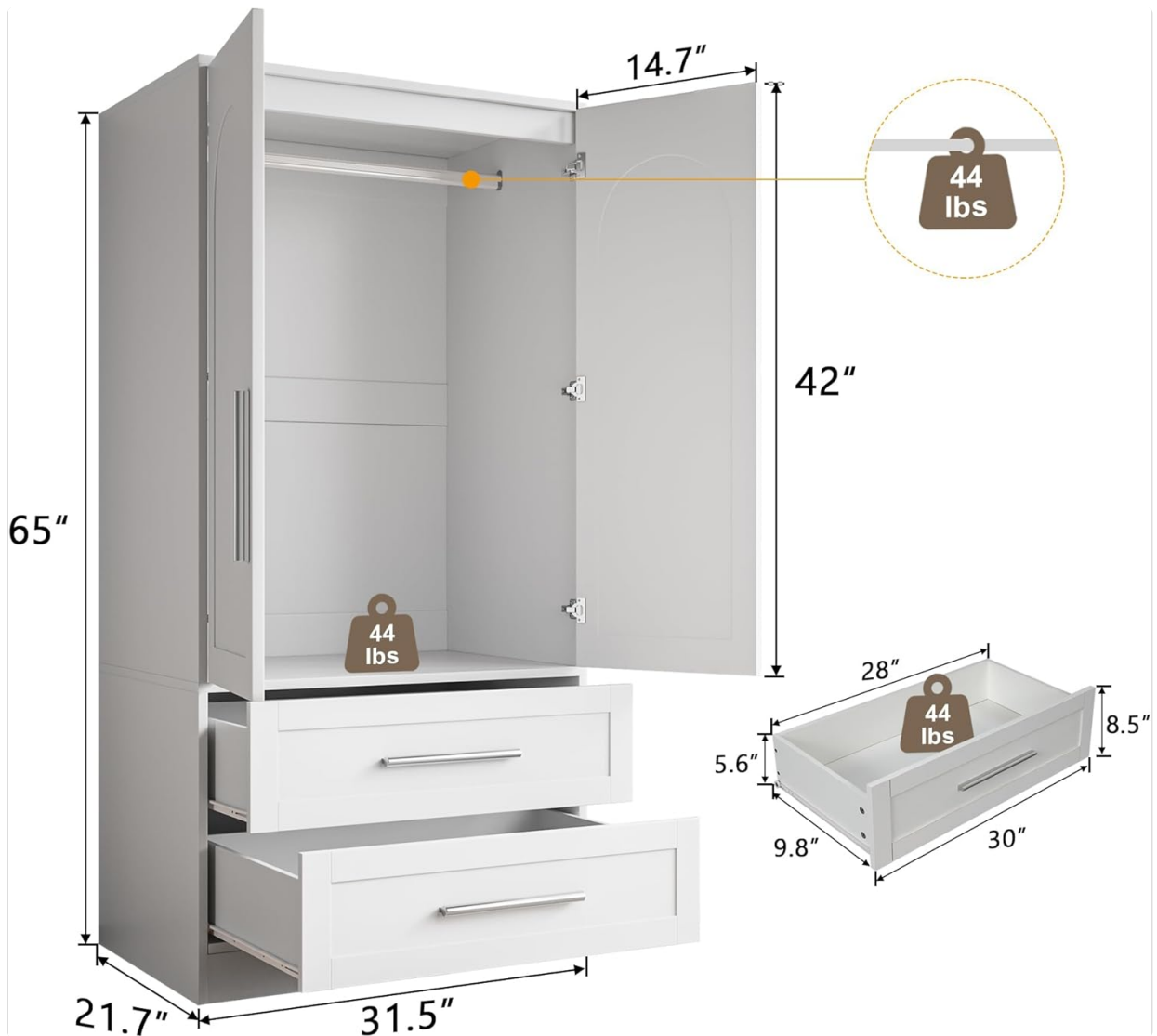
Image: Dimensions and weight capacities of the iPormis Armoire Wardrobe Closet. The overall dimensions are 65 inches high, 31.5 inches wide, and 21.7 inches deep. The internal shelf is 14.7 inches deep, and each drawer measures 28 inches wide, 9.8 inches deep, and 8.5 inches high. The hanging rod and each drawer can support up to 44 pounds.

Video: An overview of the iPormis Armoire Wardrobe Closet with 2 Drawers, showcasing its features and design. This video provides a visual guide to the product's appearance and functionality.