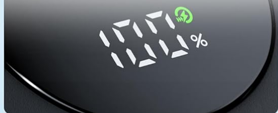
Image: The RORRY Portable Charger's digital display indicating a full charge.