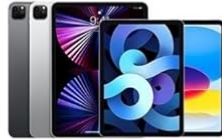
iPad Pro/Air/Mini Series iPad /9.7"/10.5"/10.9"