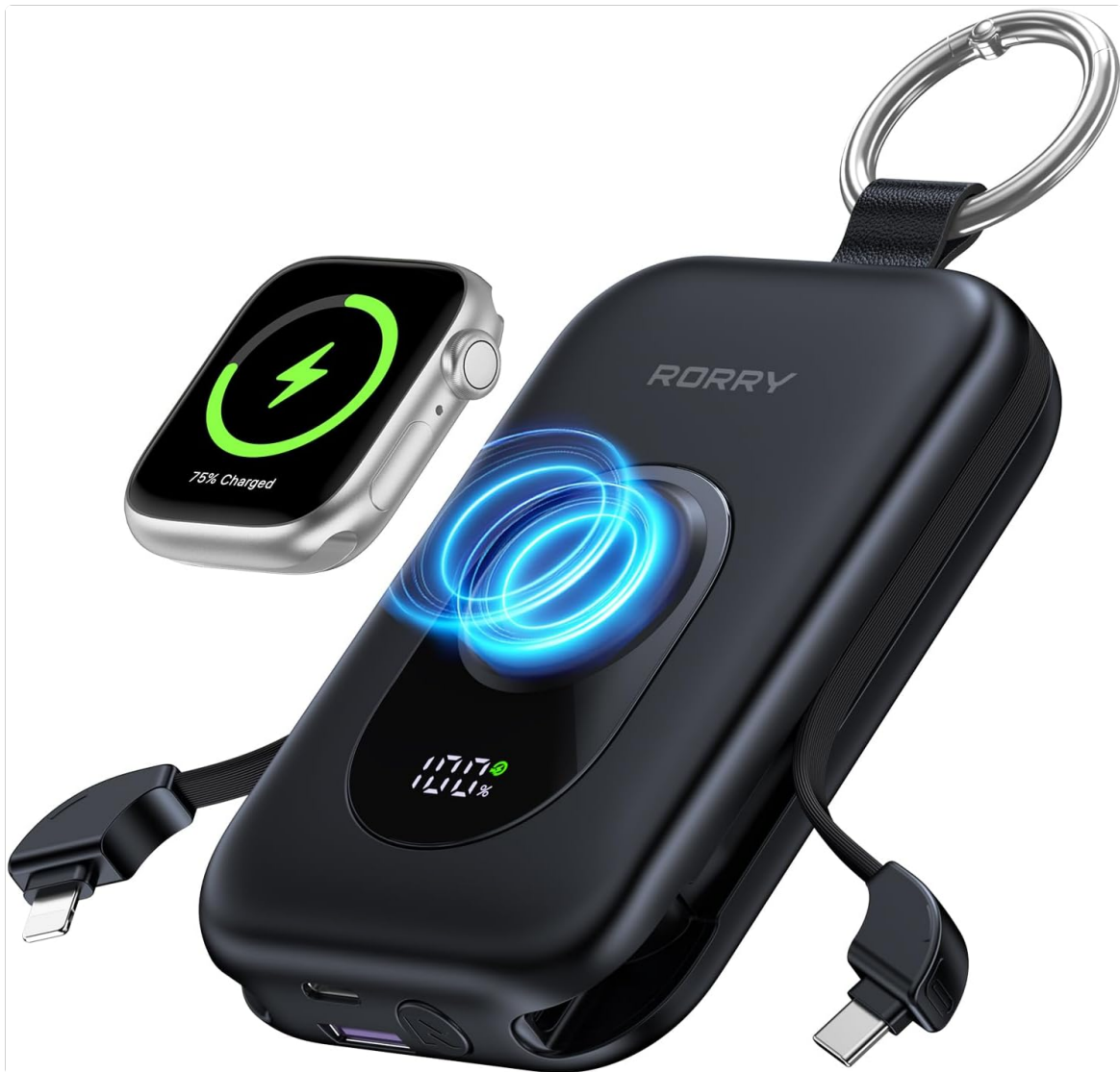
Image: RORRY 20000mAh Portable Charger, showcasing its compact design with built-in cables and Apple Watch charging pad.