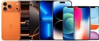
iPhone 17/16/15/14/13/12 SE/XS Plus Series