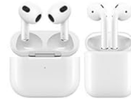
Apple AirPods Pro 3/2/1 AirPods...