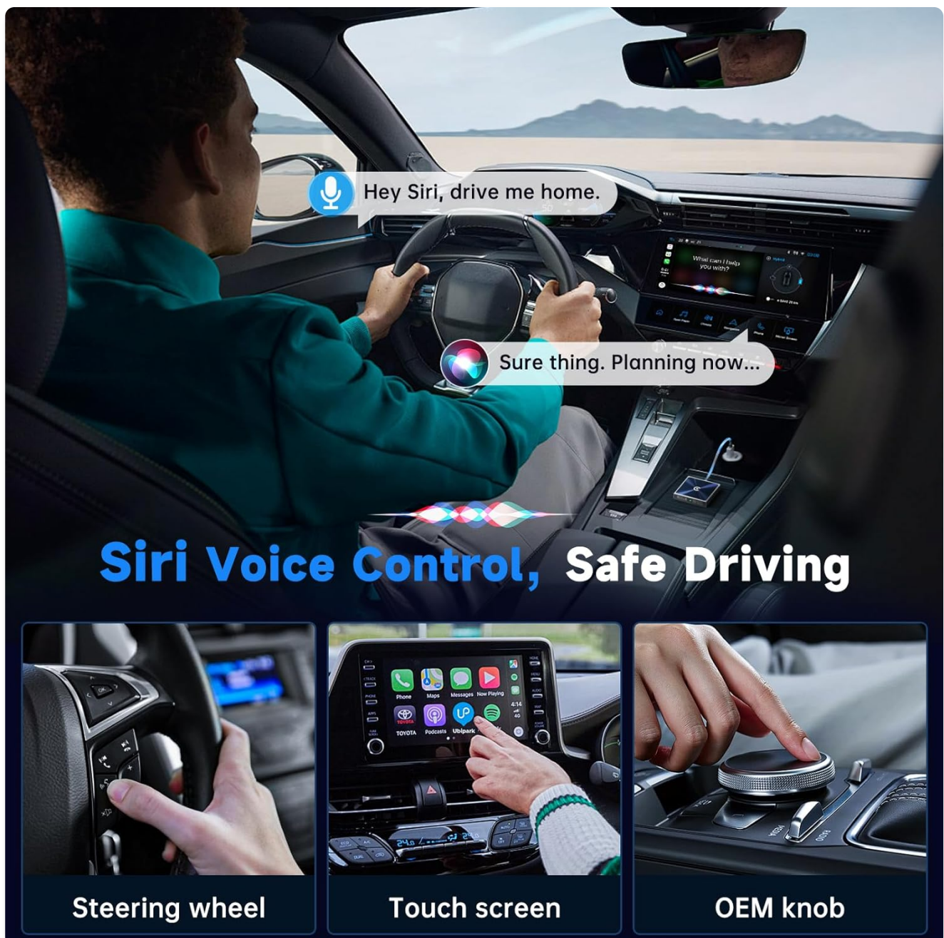
Figure 3.1: Compatibility Overview

Ensure your vehicle has a built-in wired CarPlay system. This adapter is designed exclusively for cars with existing wired CarPlay functionality and is compatible with iPhone 6 and newer models running iOS 10 or above. It is not compatible with Android Auto.