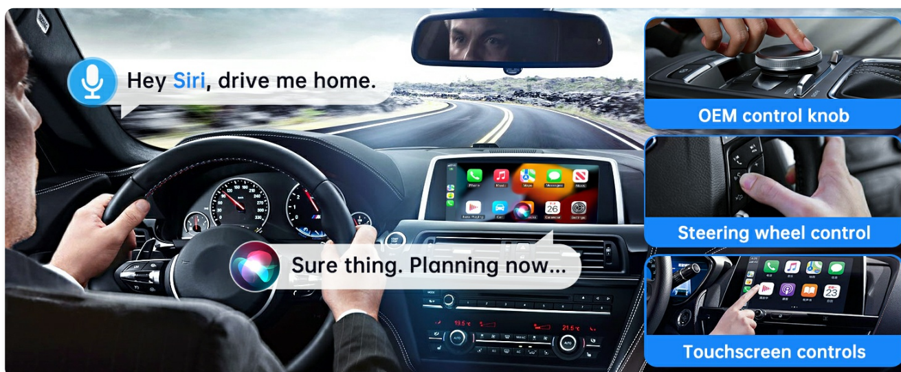
Figure 5.1: Adapter in Car Console