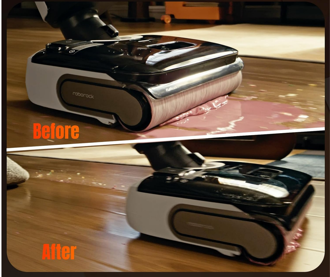
Image: A visual demonstration of the roborock F25 RT's cleaning efficacy, illustrating a floor before and after a liquid mess has been cleaned.