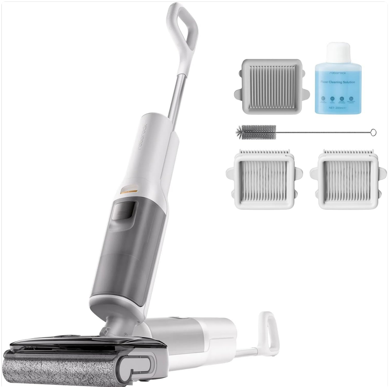
Image: The roborock F25 RT wet dry vacuum cleaner shown with its included washable filters and floor cleaning solution.