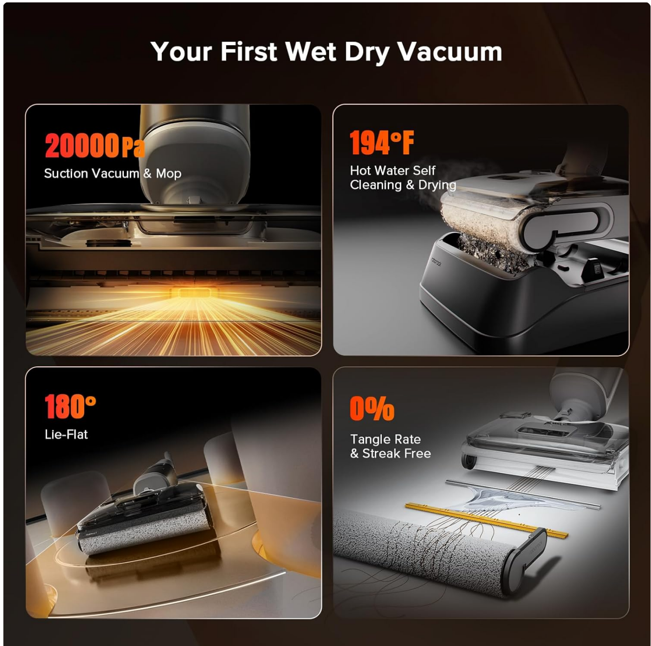
Image: An illustration highlighting the core functionalities of the roborock F25 RT, including its powerful suction, hot water cleaning, and flexible design.

Press the power button to turn on the roborock F25 RT. The device will typically start in a default cleaning mode. Use the mode selection button to switch between different cleaning modes, such as standard wet vacuuming, dry vacuuming, or specific spot cleaning functions, if available.