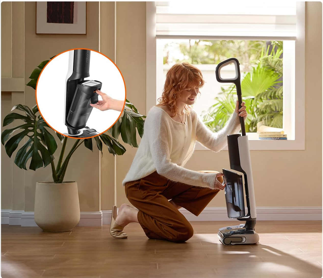
Image: A user demonstrating the easy installation of the battery pack into the roborock F25 RT vacuum cleaner.