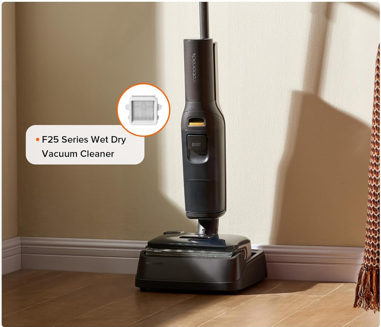
Image: The roborock F25 RT vacuum cleaner with an overlay indicating its compatibility with the F25 series filter, emphasizing seamless integration.