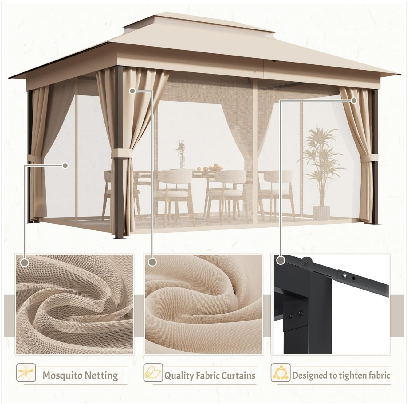
Image: Detailed view showcasing the fine mesh of the mosquito netting, the texture of the quality fabric curtains, and the design mechanism for tightening the fabric to the frame.