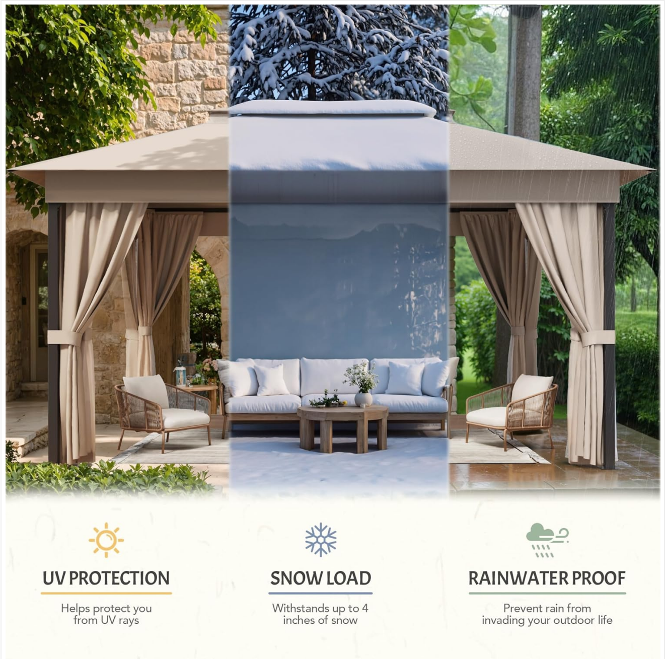
Image: Visual representation of the gazebo's capabilities, including UV protection from sun rays, resistance to snow loads up to 4 inches, and its waterproof design to prevent rainwater accumulation.