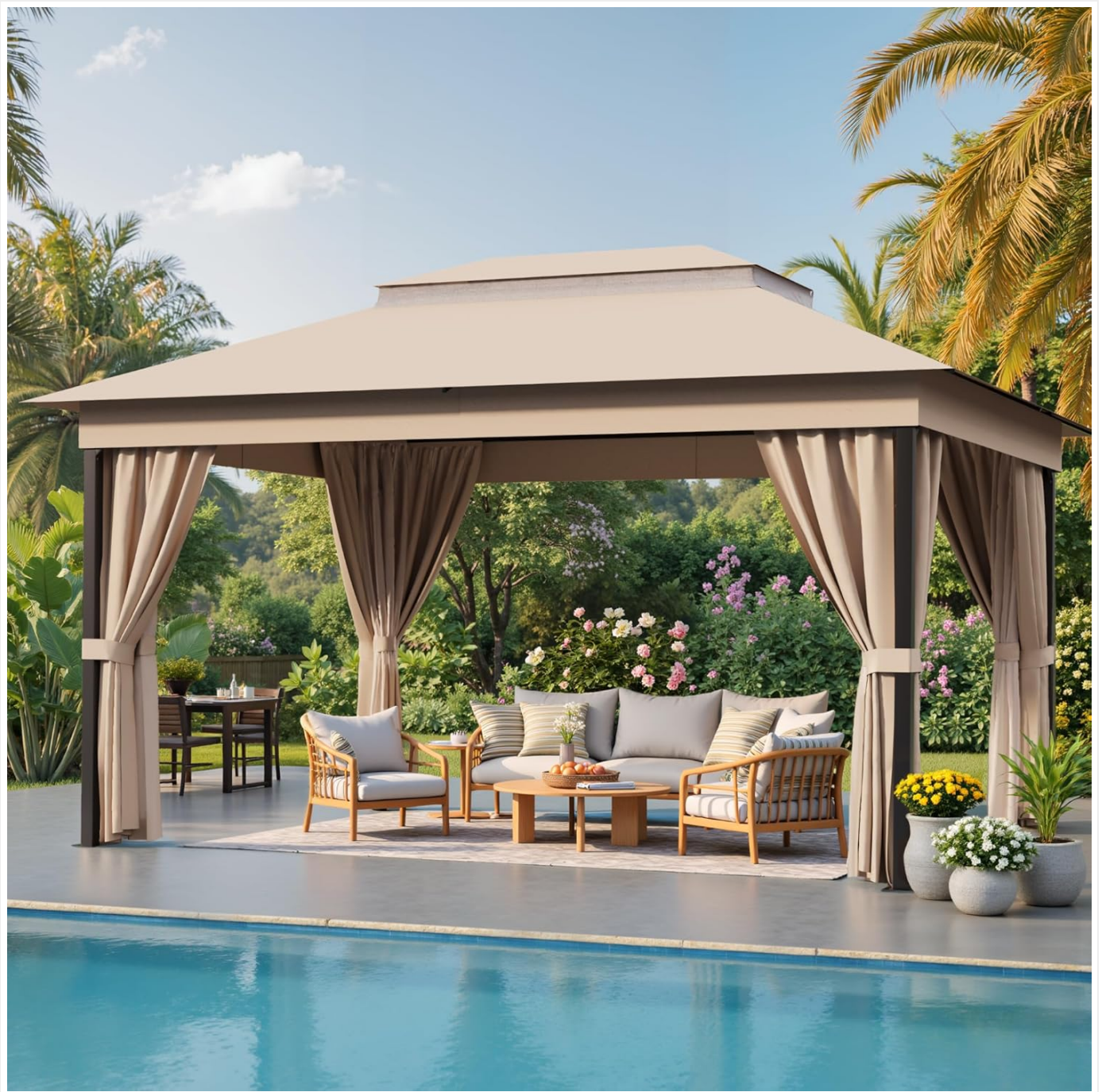
Image: The Devoko 10'x 13' Heavy Duty Metal Frame Canopy Gazebo providing shaded space next to a swimming pool, furnished with outdoor seating.