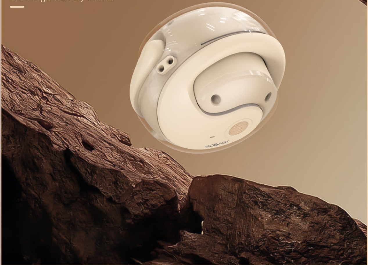
Image: Highlighting the earphones' capabilities for efficient communication anytime, anywhere.

Strong speakers and high-power amplifiers, the long can not doubt the listening enjoyment True high-fidelity sound