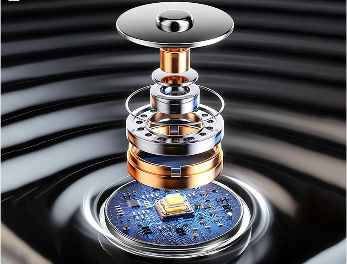
Image: Illustrating the low-latency feature for an immersive audio experience.

Large-size monoblocs are carefully tuned to minimize distortion and sharpness. Better resolution, let you enjoy the charm of music