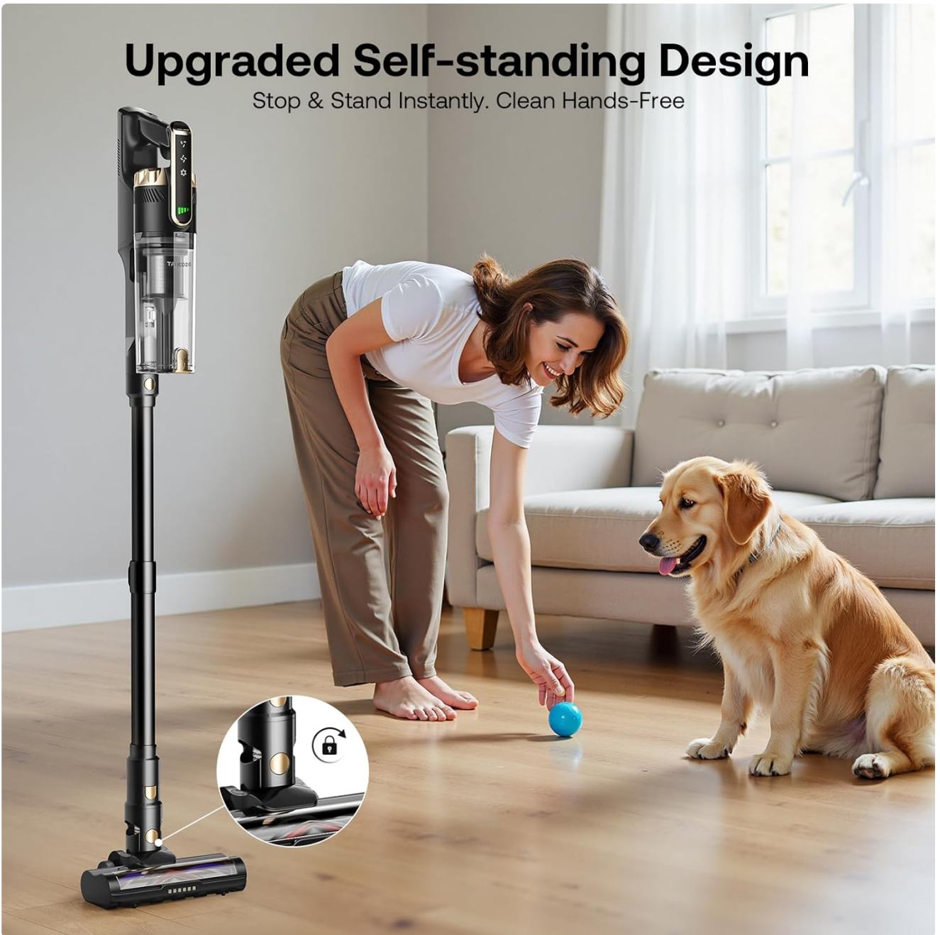
Image: The Truozie T550 Cordless Vacuum Cleaner standing upright on its own, demonstrating its self-standing feature.

Stop & Stand Instantly. Clean Hands-Free