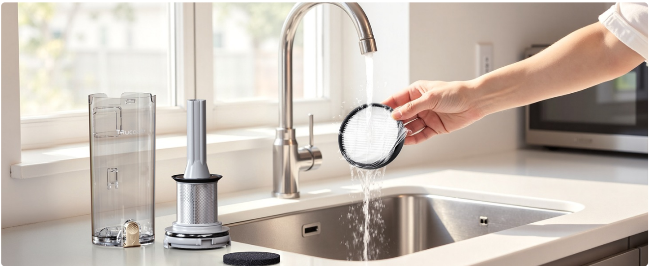
Image: Visual instructions demonstrating how to clean the HEPA filter by rinsing it under running water.

To maintain optimal performance, clean the HEPA filter every 2-3 weeks. Replace the HEPA filter every 3 months. Two HEPA filters are included with your purchase.