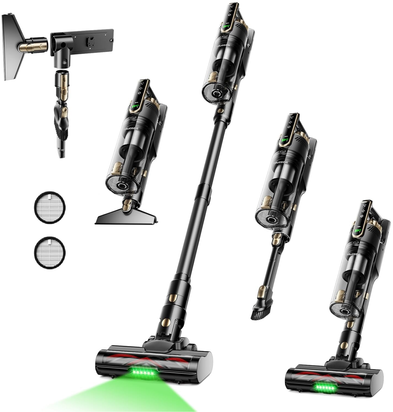
Image: All components included with the Trucozie T550 Cordless Vacuum Cleaner.

Description: This image displays all the parts of the Trucozie T550 Cordless Vacuum Cleaner, including the main unit, various attachments, battery, charger, and filters, neatly arranged on a surface.