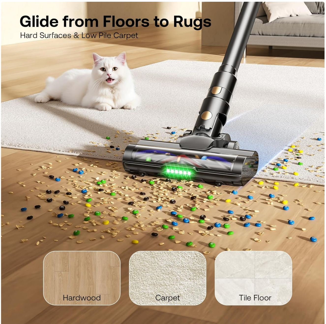
Image: The Truozie T550 vacuum cleaning various floor types including hardwood, carpet, and tile, demonstrating its versatility.