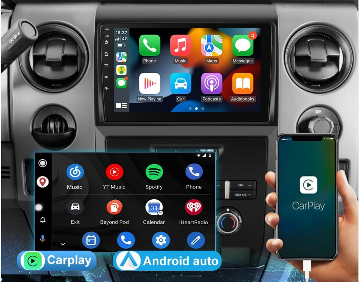
Figure 5.1: Wireless CarPlay and Android Auto Functionality.

This image demonstrates the dual compatibility of the AWESAFE car stereo with both Apple CarPlay and Android Auto. The main screen shows the CarPlay interface, while a smaller inset image illustrates the Android Auto interface, emphasizing the wired/wireless connectivity options for smartphones.