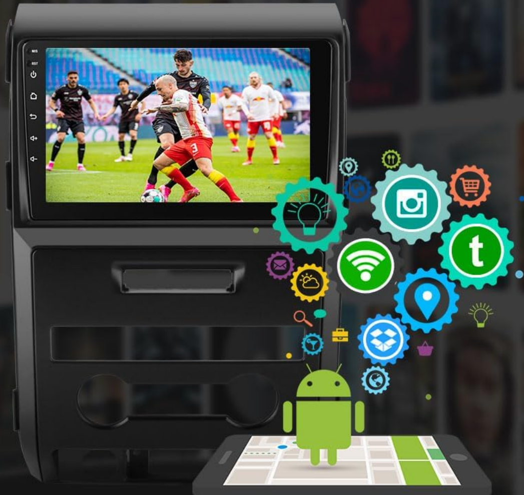
Figure 5.3: Wi-Fi Connectivity and App Support.

Support Hotspot. You can download massive APPS from the APP store for free as you like.