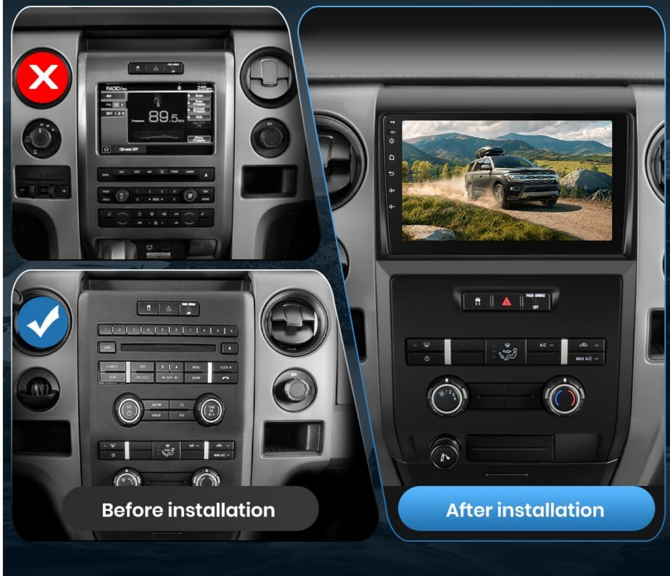
Figure 3.1: Before and After Installation Comparison.

This image provides a visual comparison of the Ford F150 dashboard. The 'Before installation' panel shows the original factory radio, while the 'After installation' panel displays the AWESAFE 9-inch Android Car Stereo perfectly fitted into the dashboard, highlighting the significant aesthetic and functional upgrade.