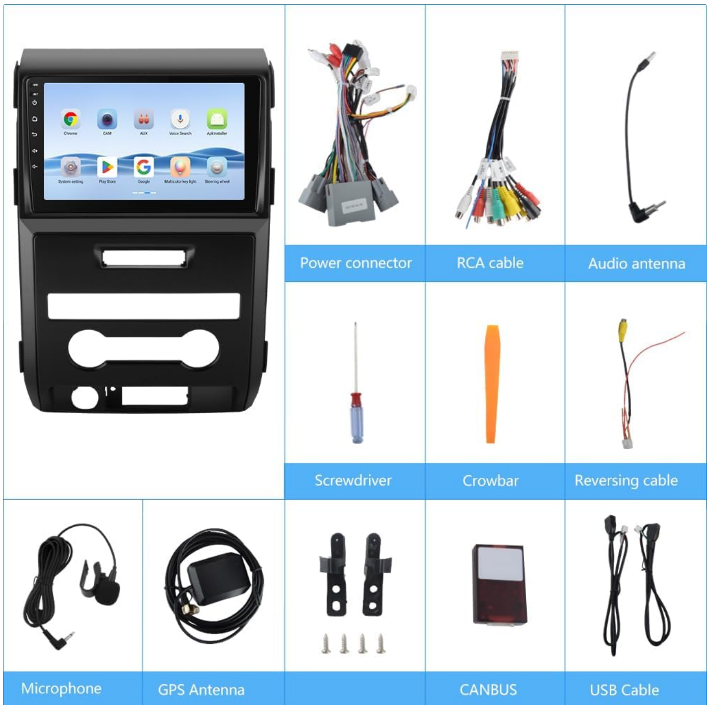
Figure 1.2: Included Components and Accessories.

This diagram illustrates all the components and accessories that come with the AWESAFE car stereo. It includes the main head unit, various cables such as the power connector, RCA cable, reversing cable, and USB cable, along with essential tools like a screwdriver and crowbar, and accessories like the audio antenna, microphone, GPS antenna, and CANBUS module.