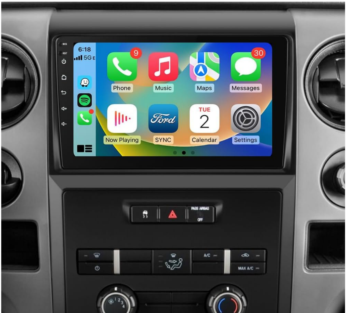
Figure 1.1: AWESAFE Android Car Stereo with CarPlay interface in a Ford F150 dashboard.

This image shows the AWESAFE 9-inch Android Car Stereo seamlessly integrated into the dashboard of a Ford F150. The screen displays the Apple CarPlay interface, featuring large, easy-to-read icons for essential applications such as Phone, Music, Maps, and Messages, indicating its modern connectivity features.