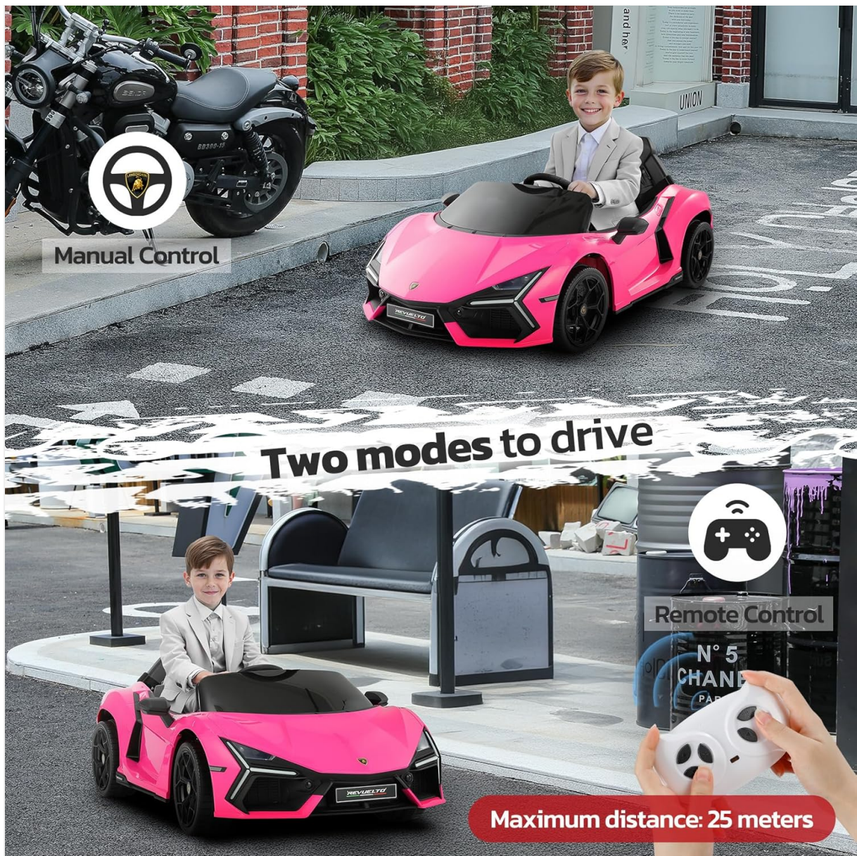
Image: The ride-on car can be operated manually by the child or via remote control by an adult.