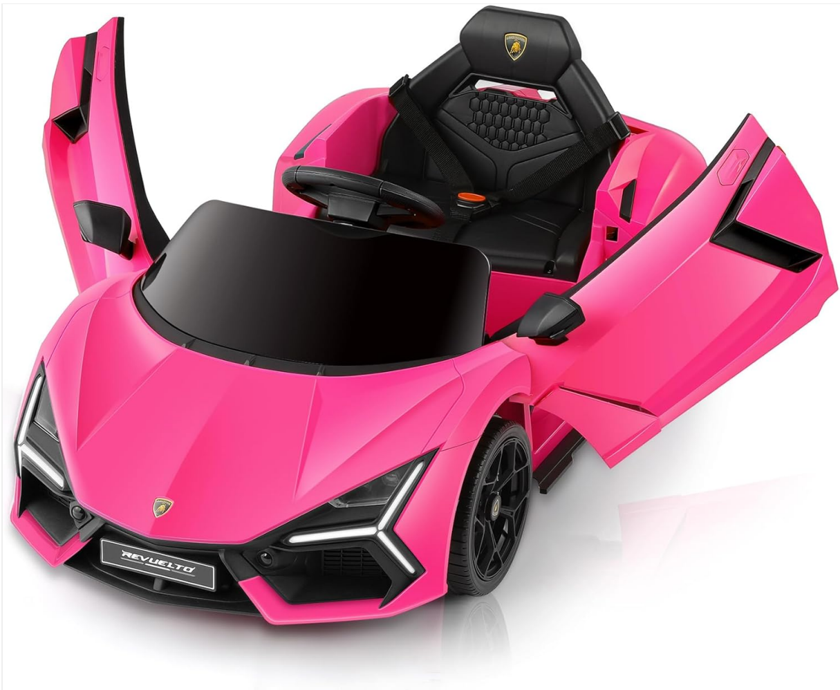
Image: The ELEMARA Licensed Lamborghini QLS-8603 12V Ride-On Car in hot pink, showcasing its open scissor doors and sleek design.