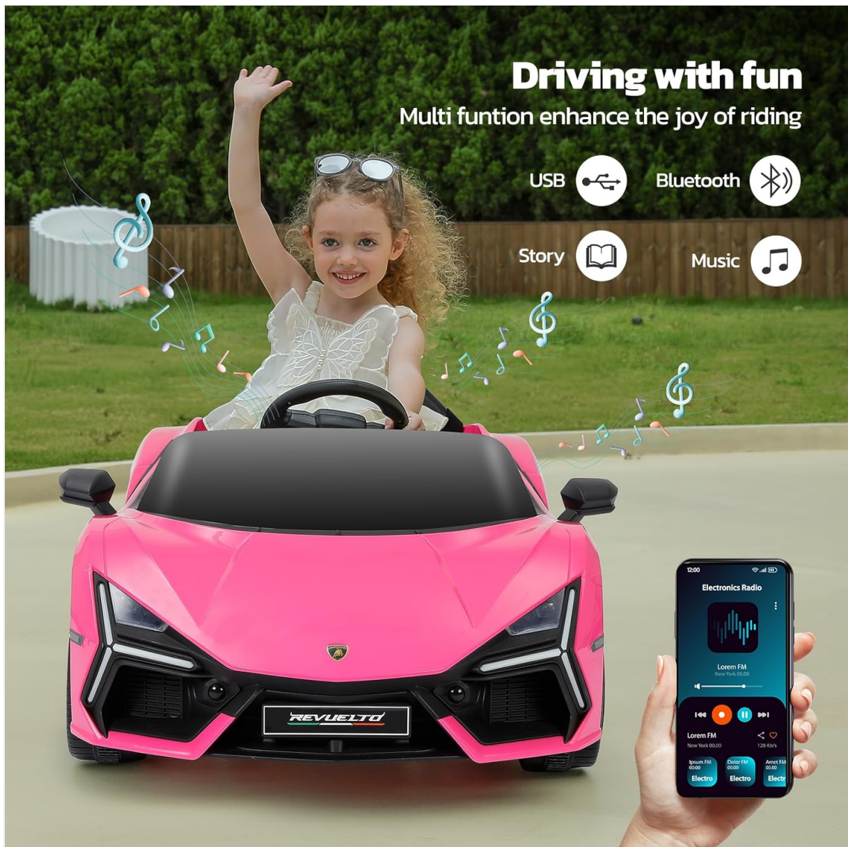
Image: The ride-on car features Bluetooth music mode, allowing children to enjoy their favorite tunes while driving.