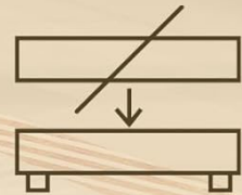
Image: Visual guide recommending a 6-inch thick mattress for the upper bed and an 8-inch thick mattress for the bottom bed. It also states that mattresses are not included.