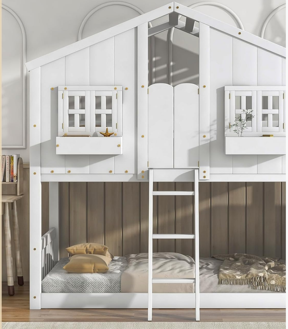
Image: Close-up views highlighting the functional window, the door feature on the upper bunk, and the 14-piece slat support system.