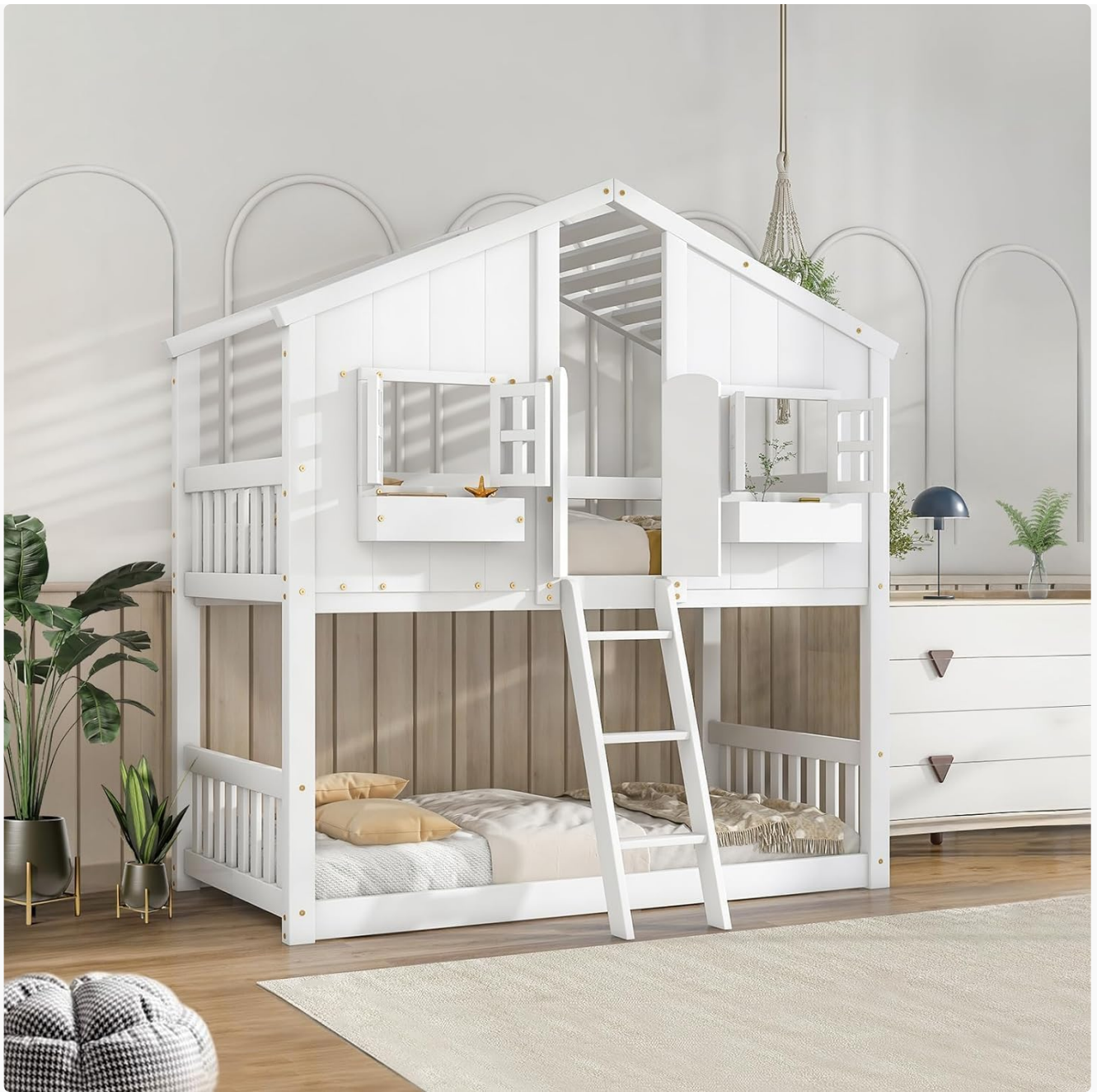
Image: The Rovibek House Bunk Bed Twin Over Twin, featuring a house-shaped frame, ladder, and window storage, set up in a brightly lit room.