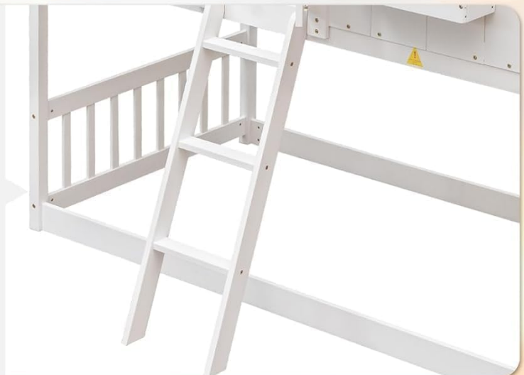
Image: Illustration of the safety features, including the 16-inch high guardrail on the upper bunk and the sturdy 3-step flat ladder for safe access.