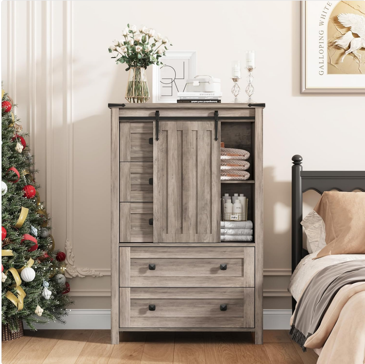
Image 3.1: The dresser positioned in a bedroom, showcasing its aesthetic integration.