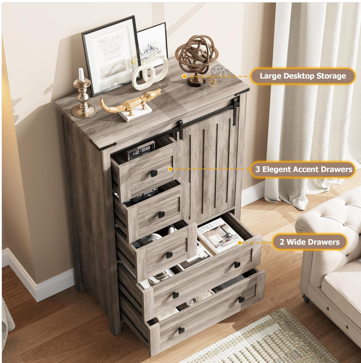
Image 4.1: The dresser with all five drawers partially open, demonstrating the storage capacity and drawer configuration.