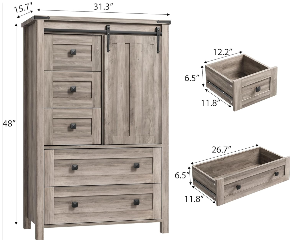
Image 2.2: Diagram illustrating the overall dimensions of the dresser (15.7"D x 31.3"W x 48"H) and individual drawer dimensions.