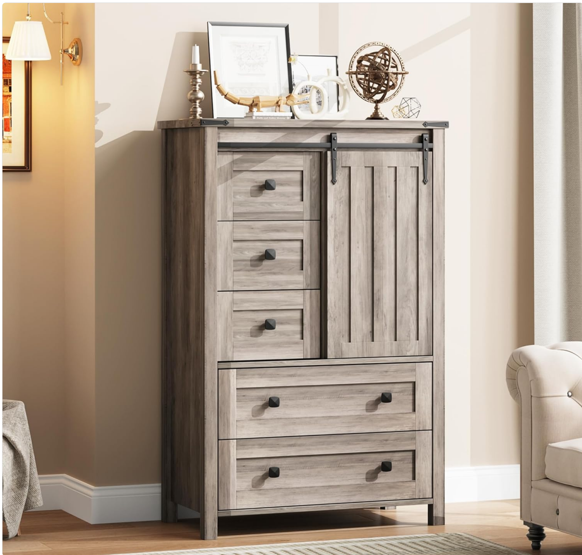
Image 2.1: Front view of the assembled IDEALHOUSE Farmhouse 5-Drawer Dresser in grey finish, featuring five drawers and a sliding barn door.