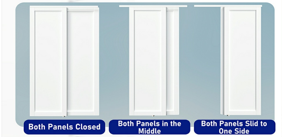
Figure 5: Flexible Opening and Closing. This diagram illustrates the various positions the sliding doors can take, offering versatile access to your closet space.