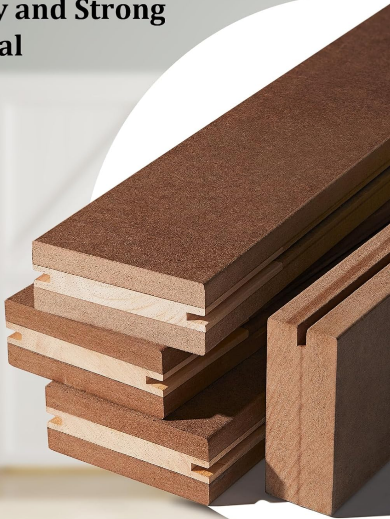
Figure 6: MDF Material Properties. This image highlights the durable MDF construction with a white PVC surface, emphasizing its scratch resistance and ease of cleaning.