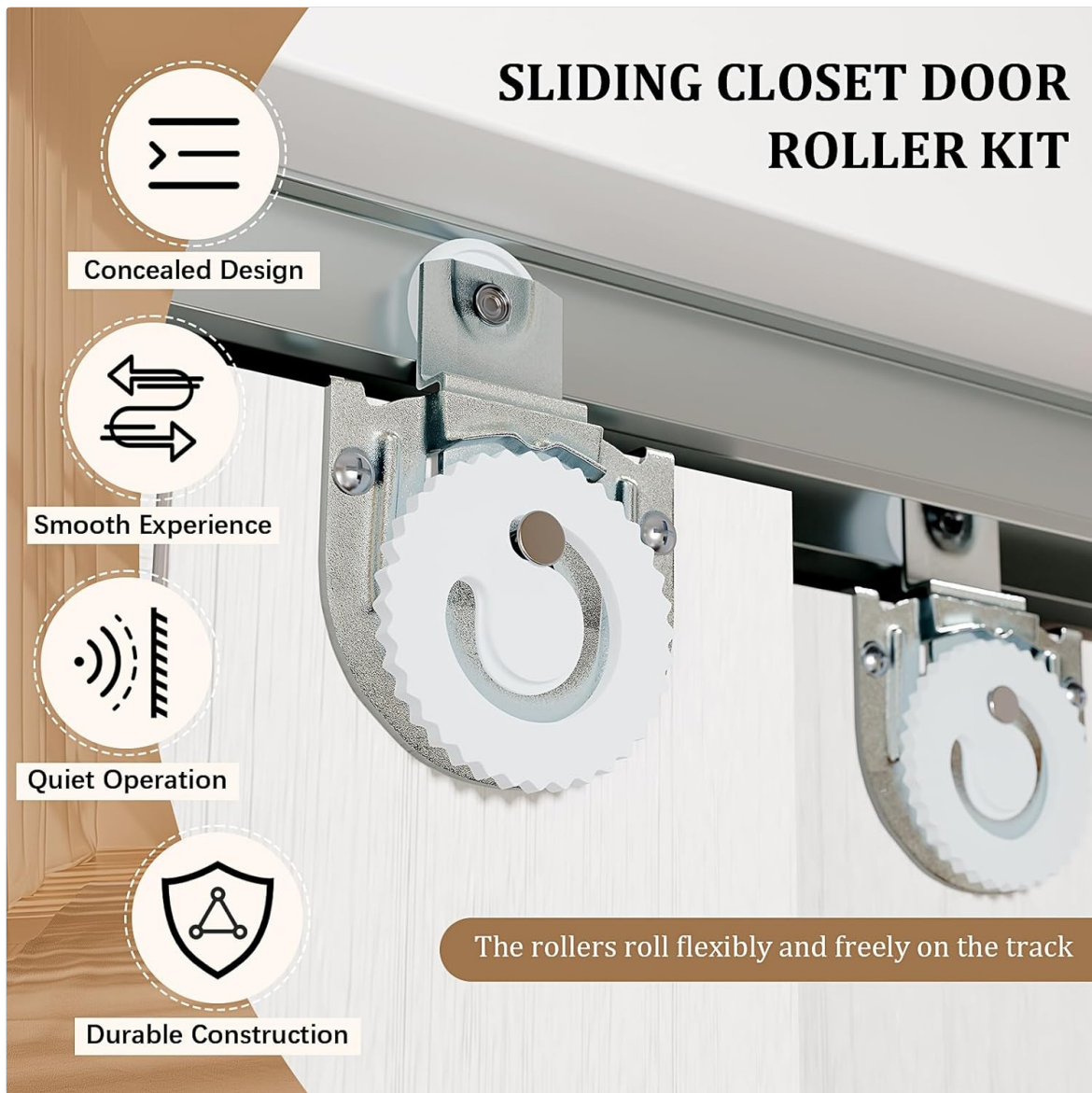
Figure 2: Sliding Closet Door Roller Kit. This image shows the roller assembly, emphasizing its concealed design for a smooth and quiet operation.