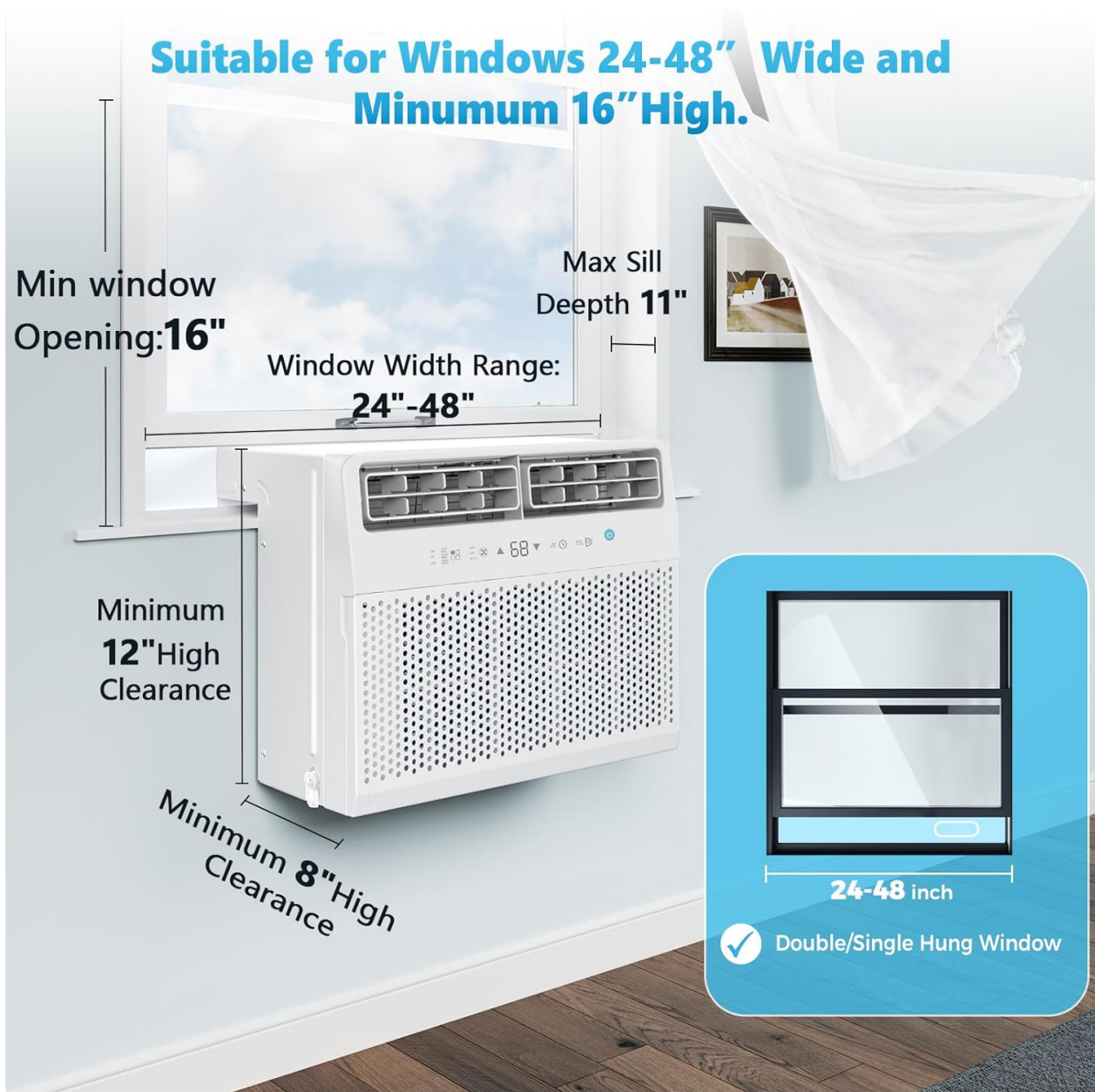
Figure 4.1: Refer to these dimensions for proper window fit and clearance.