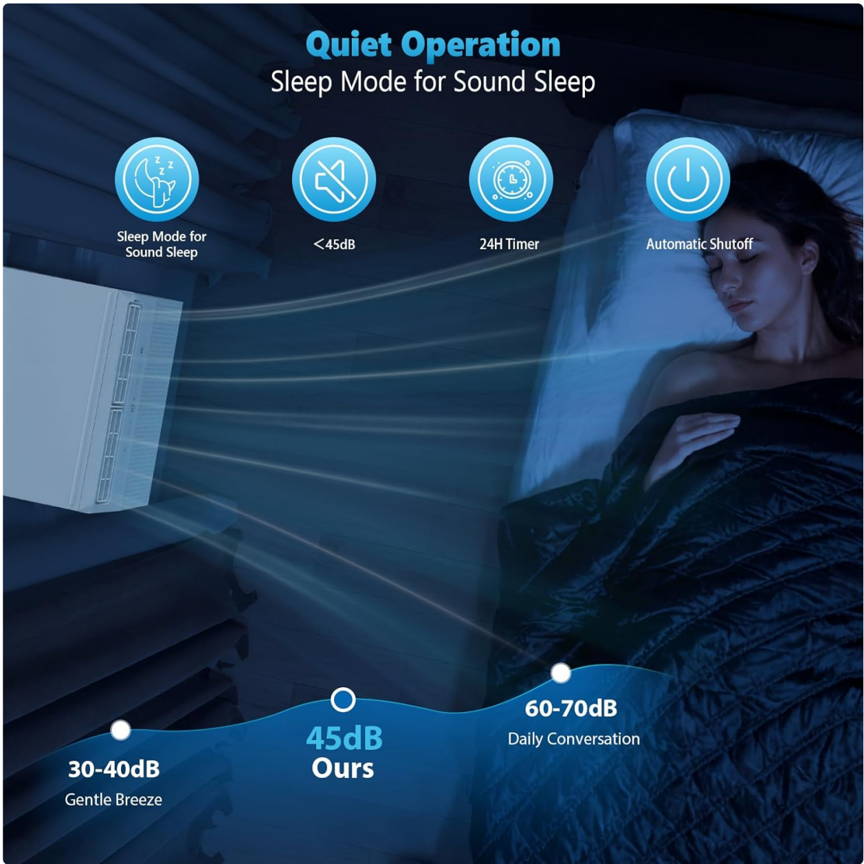
Figure 1.2: The unit features quiet operation, including a dedicated Sleep Mode for undisturbed rest.