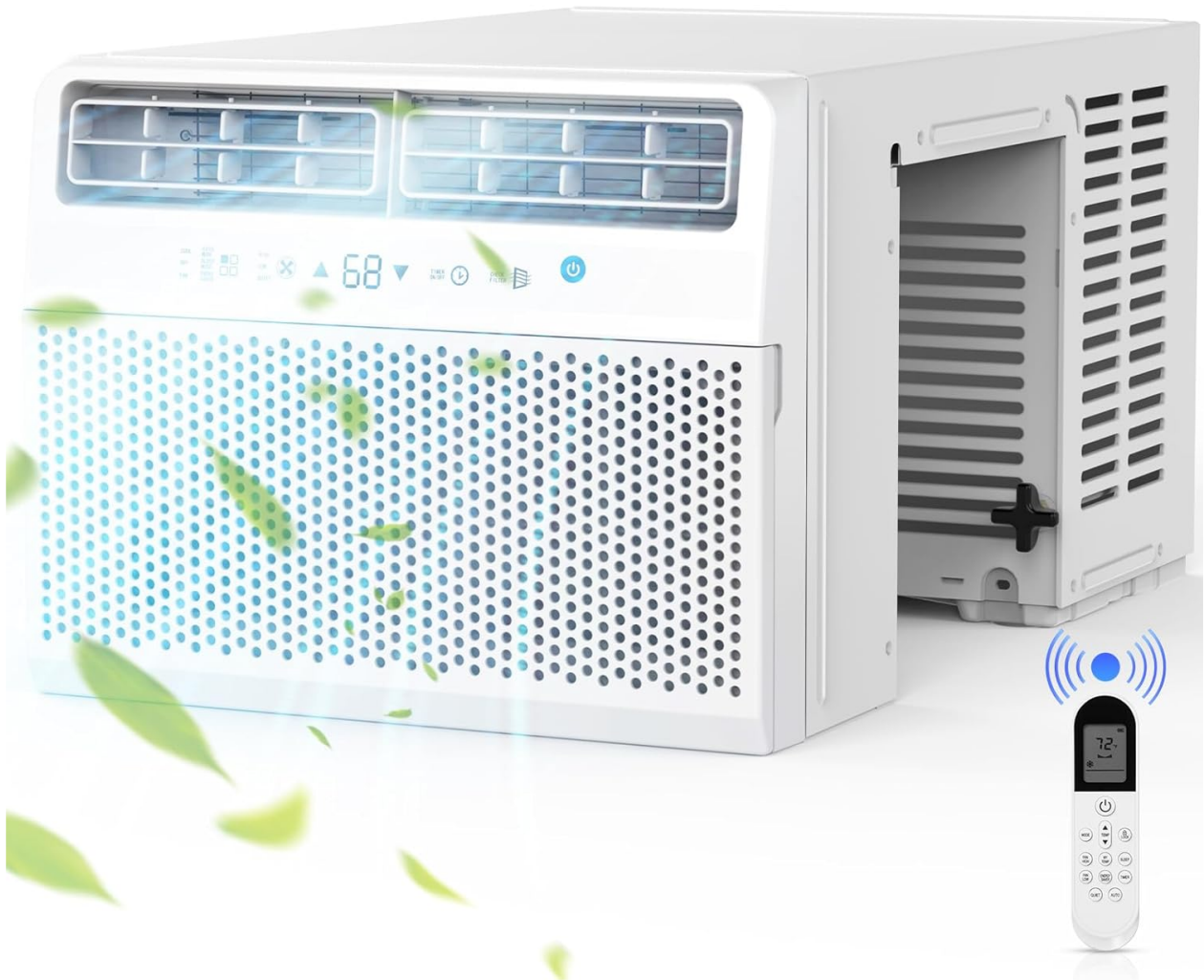
Figure 1.1: Electactic A5418W-12K Window Air Conditioner with included remote control.