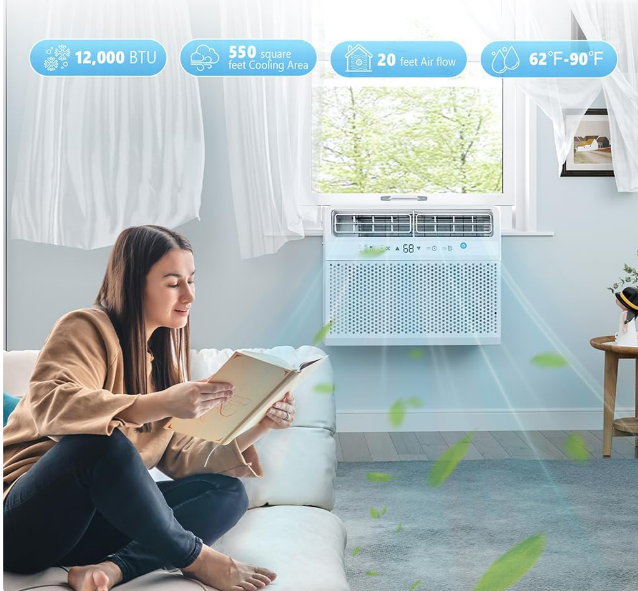
Figure 1.3: This air conditioner provides 12,000 BTU cooling power for up to 550 sq. ft. with 20 feet of airflow, maintaining temperatures between 62°F and 90°F.