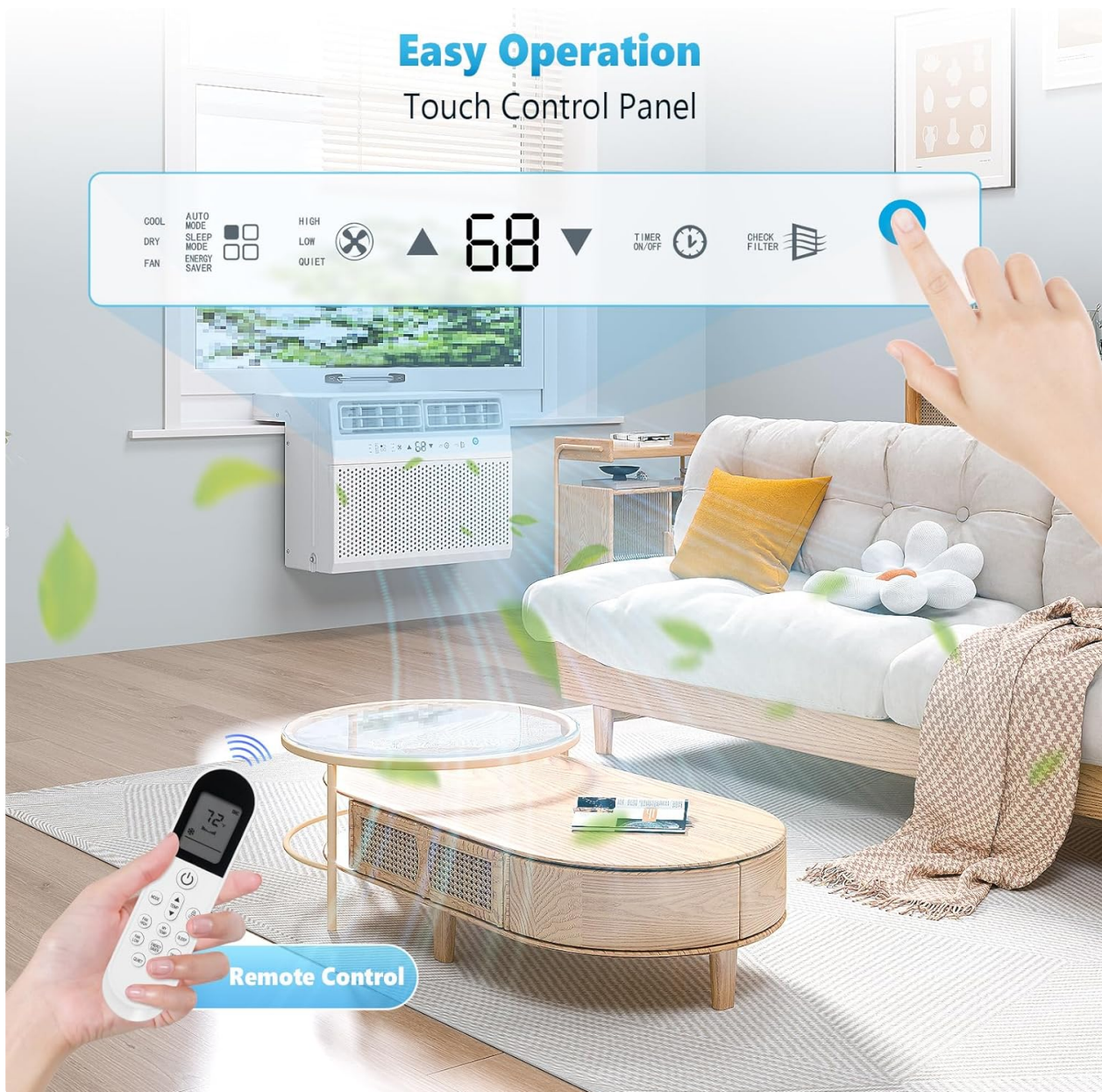
Figure 5.1: The unit features a touch control panel and comes with a remote for easy operation.