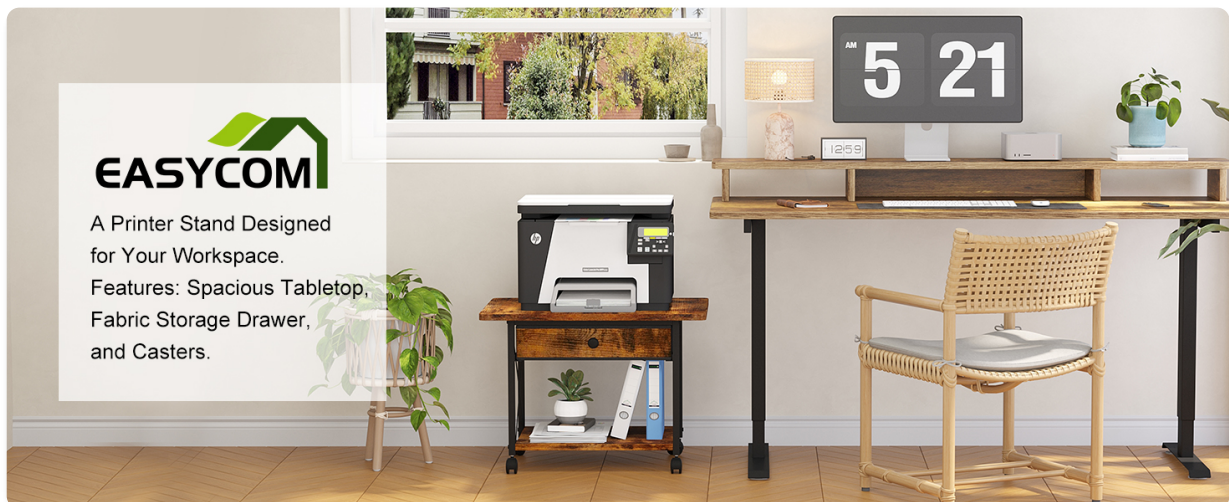
Image 2: The stand fits neatly under a desk, optimizing workspace.