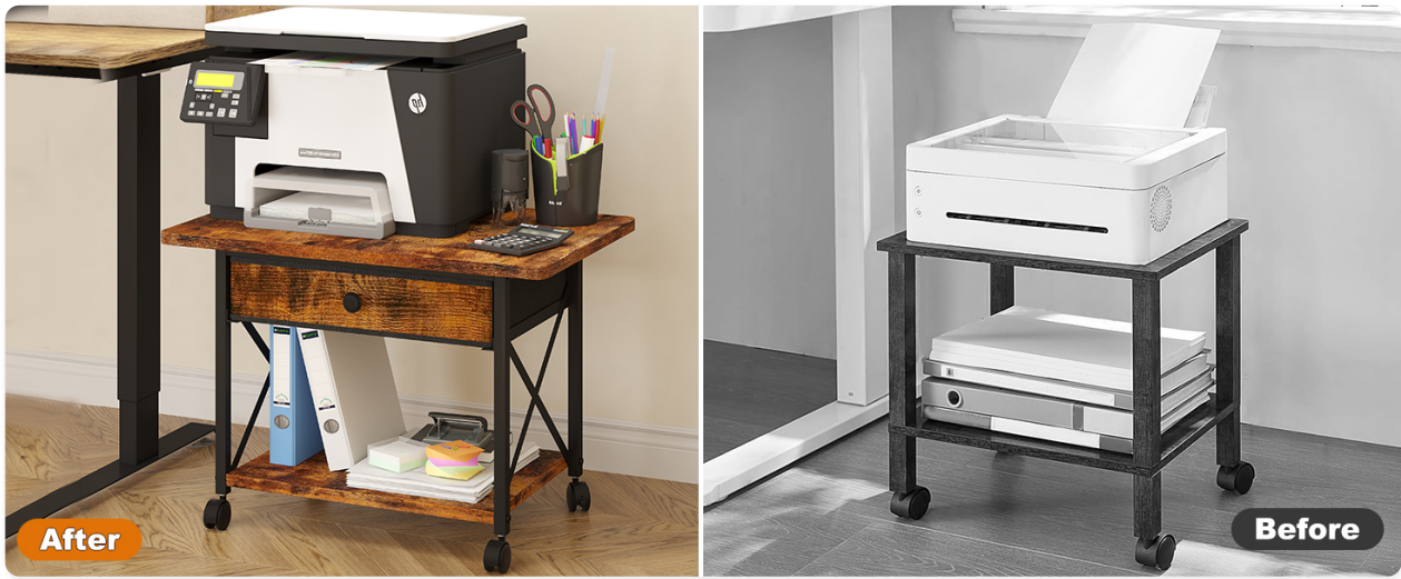
Image 6: The stand's versatile design allows it to fit into multiple rooms and serve various purposes.