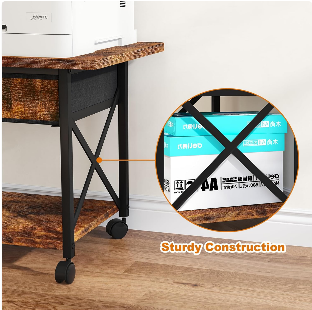
Image 5: The X-frame design enhances the stand's stability and durability.