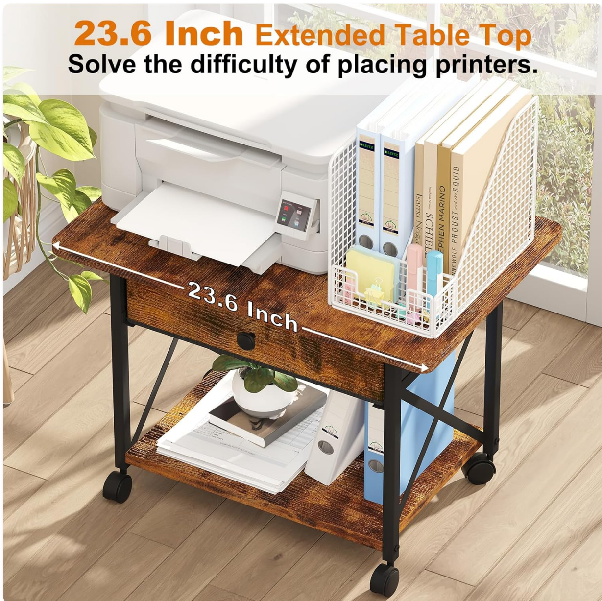
Image 1: The spacious tabletop comfortably holds a printer, with additional storage below.