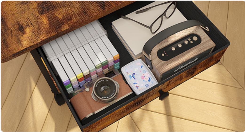
Image 3: The fabric drawer offers discreet storage for various items.