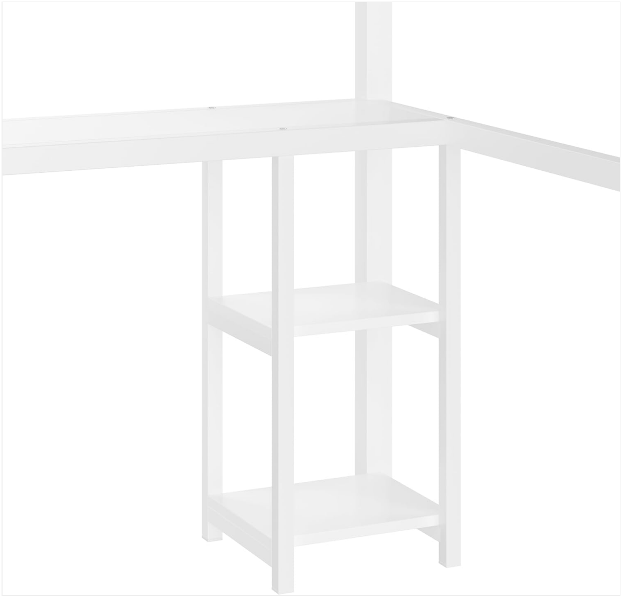
Image 5: Detailed view of the desk area with its integrated lower shelves. These shelves are suitable for storing smaller items, books, or electronic devices, complementing the main desk surface.