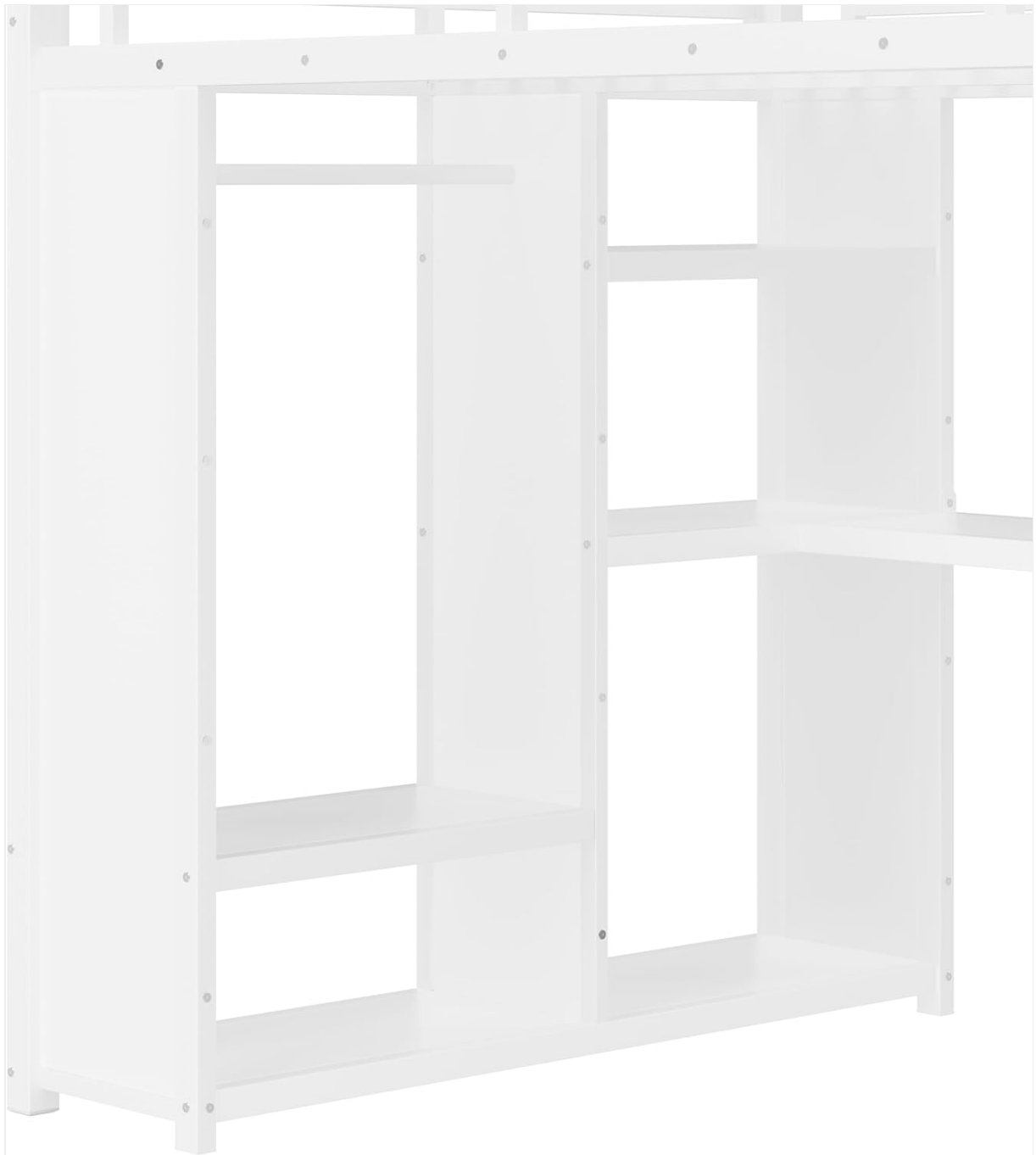
Image 4: Detailed view of the wardrobe section and adjacent storage shelves. The wardrobe includes a hanging rod for clothes, and the shelves provide open storage compartments.