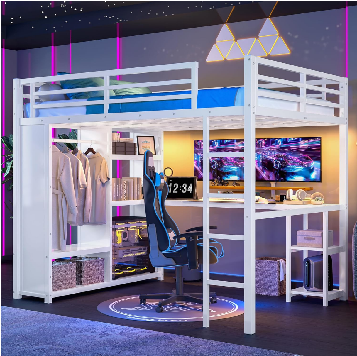
Image 1: Fully assembled HZSMHDZKJ Queen Size Modern Loft Bed, showcasing the integrated desk, storage shelves, and wardrobe. The bed frame is white metal, and the under-bed area is configured for a workstation and storage.