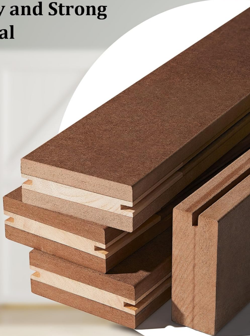
Image: High Quality and Strong MDF Material. This image illustrates the multi-layered engineered wood (MDF) construction with a smooth white PVC surface, highlighting its scratch resistance, easy-to-clean properties, and CARB Phase 2 compliance.