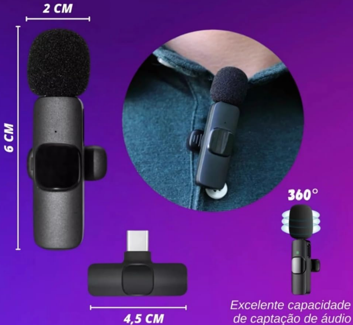
Image Description: This image illustrates the compact size and design of the microphone. It shows a microphone attached to a shirt collar, highlighting its discreet nature. Dimensions are provided: 6 cm in length and 2 cm in width for the microphone, and 4.5 cm for the receiver. A 360-degree audio capture icon emphasizes its omnidirectional capability.