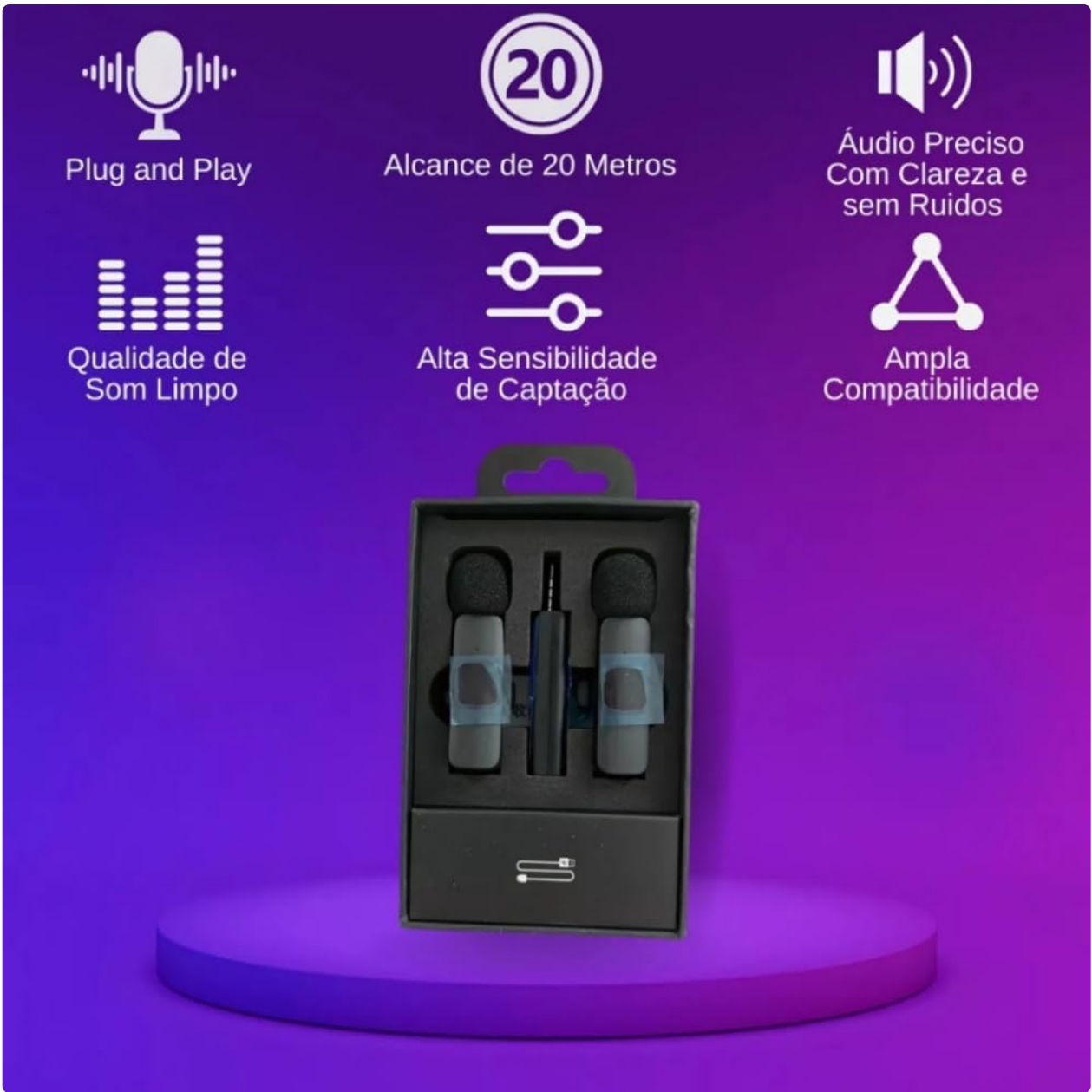
Image Description: This graphic highlights the main features of the microphone kit. Icons and text indicate 'Plug and Play', '20 Meter Range', 'Precise Audio with Clarity and No Noise', 'Clean Sound Quality', 'High Capture Sensitivity', and 'Wide Compatibility'. A small box containing the two microphones and receivers is shown at the bottom.