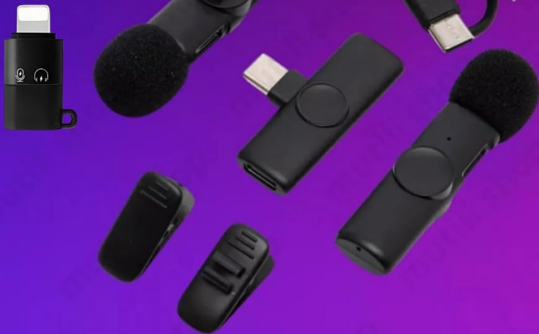
Image Description: This image displays all components included in the AGold Premium Wireless Lavalier Microphone Kit. It shows two black wireless lavalier microphones, one USB-C receiver, one Lightning receiver, two black windproof foam covers, and a black USB charging cable. The items are neatly arranged, indicating a complete kit ready for use.