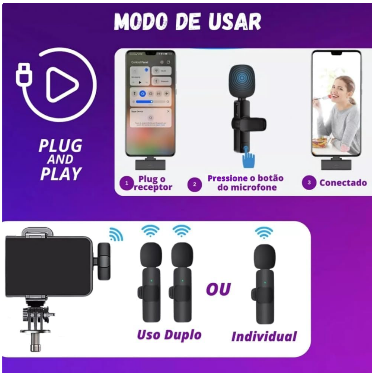
Image Description: This image provides a visual guide to the 'Plug and Play' setup. It shows three steps: 1) Plug the receiver into the phone, 2) Press the microphone button, and 3) The device is connected. Below, it illustrates both dual and individual microphone usage scenarios.