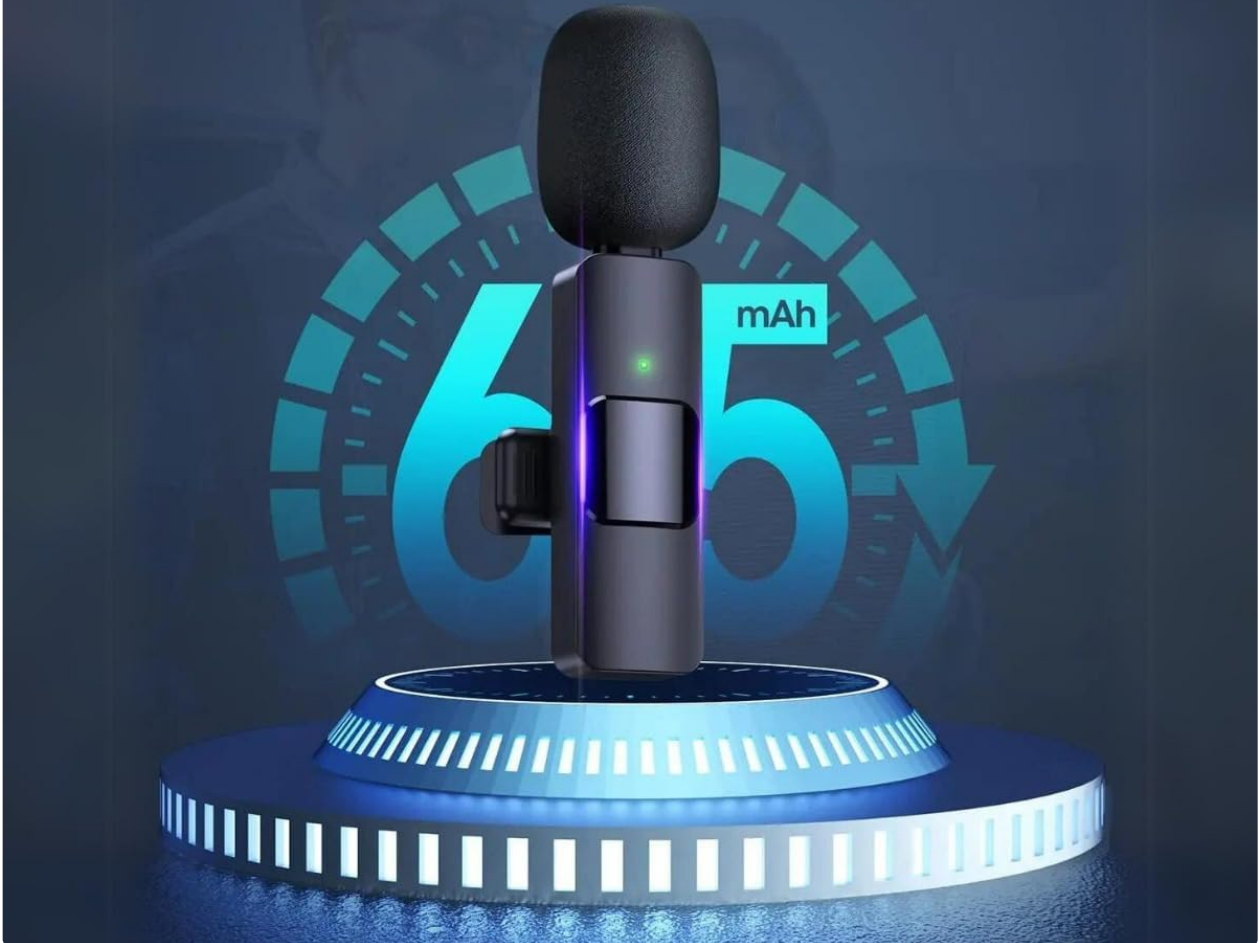
Image Description: This image provides detailed battery specifications. It highlights a charge time of 1.5 hours, a resistance (usage time) of 6 hours, and a battery capacity of 65 mAh, emphasizing the long battery life of the device.