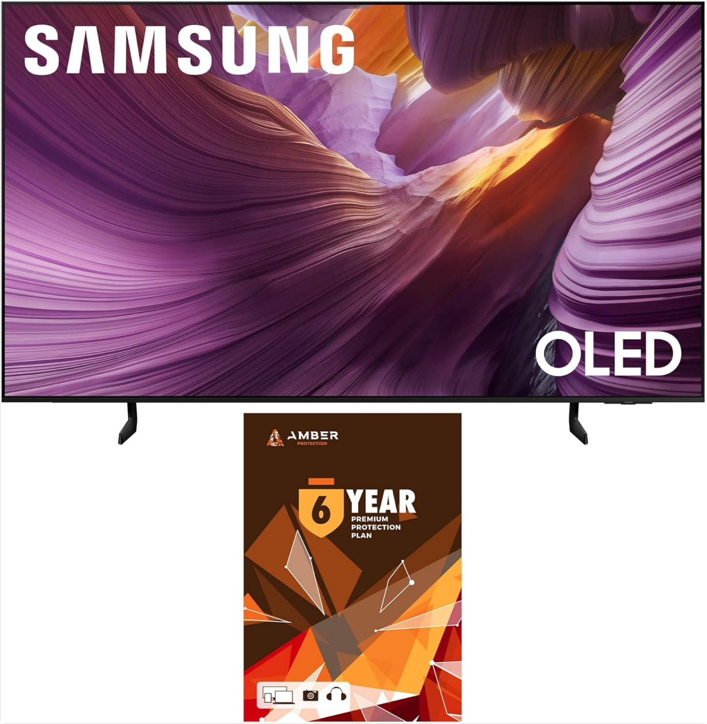
Image: The Samsung QN55S85FAFXZA 55 Inch OLED HDR 4K Smart TV shown with its included 6-Year Amber Protection Plan documentation.