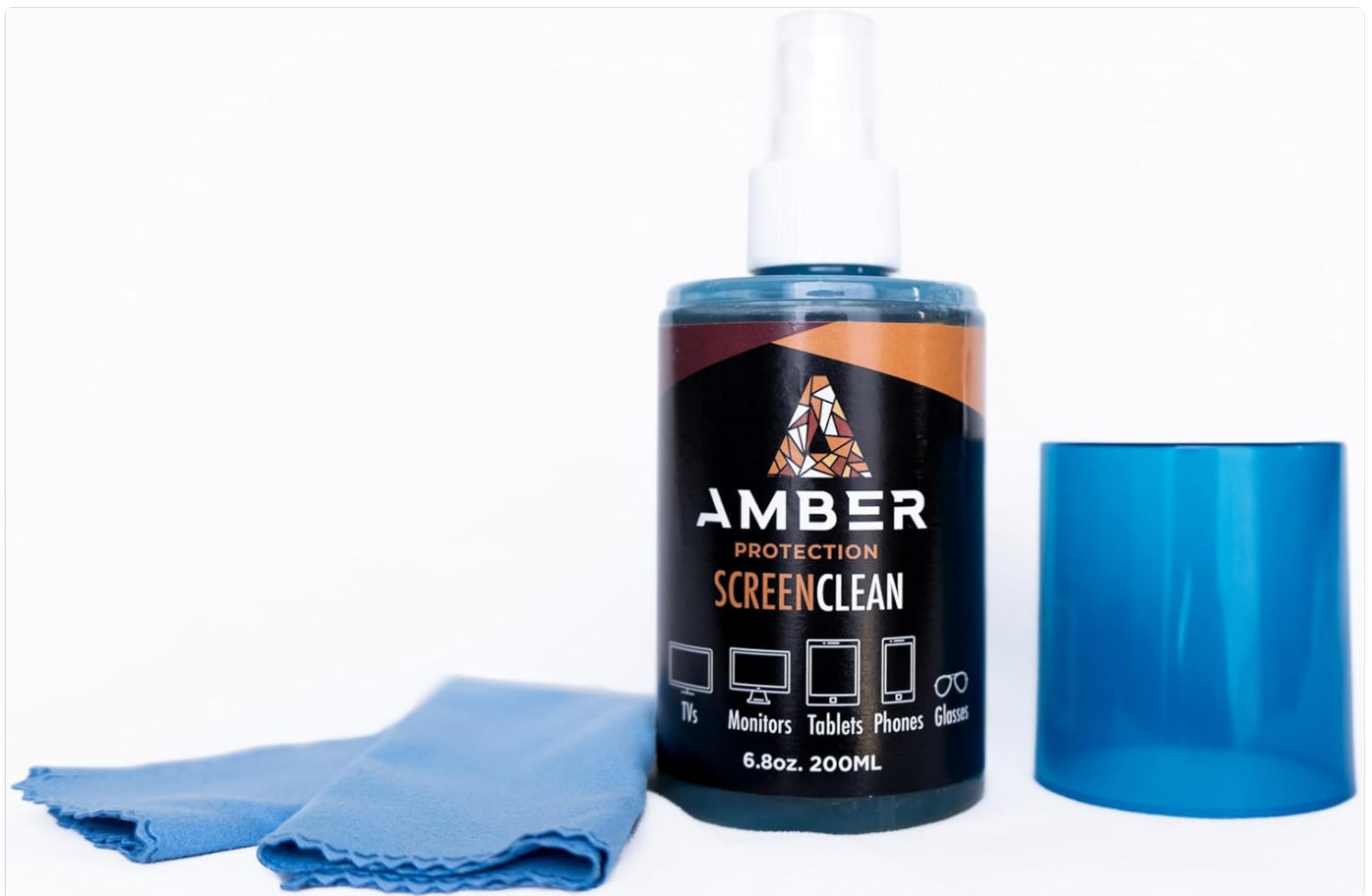
Image: The Amber Protection HDTV Screen Cleaner Kit, including a spray bottle and cleaning cloth.