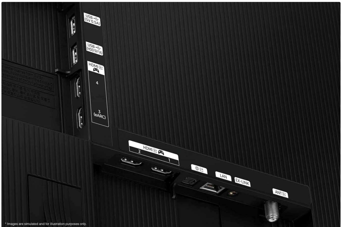
Image: Close-up of the TV's back panel, highlighting the various input ports including HDMI, USB, LAN, and antenna connections.