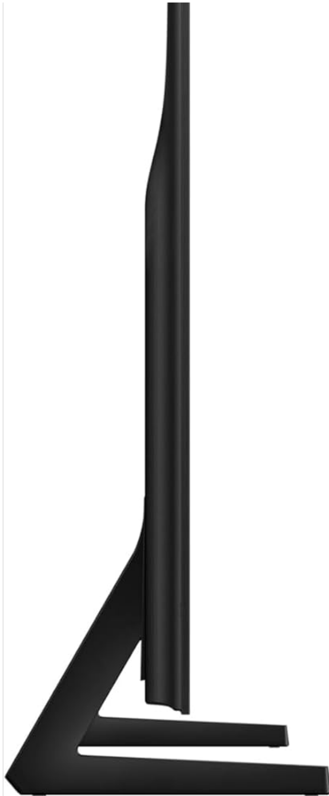
Image: Side profile of the Samsung QN55S85FAFXZA TV, illustrating its slim design and the attached stand.